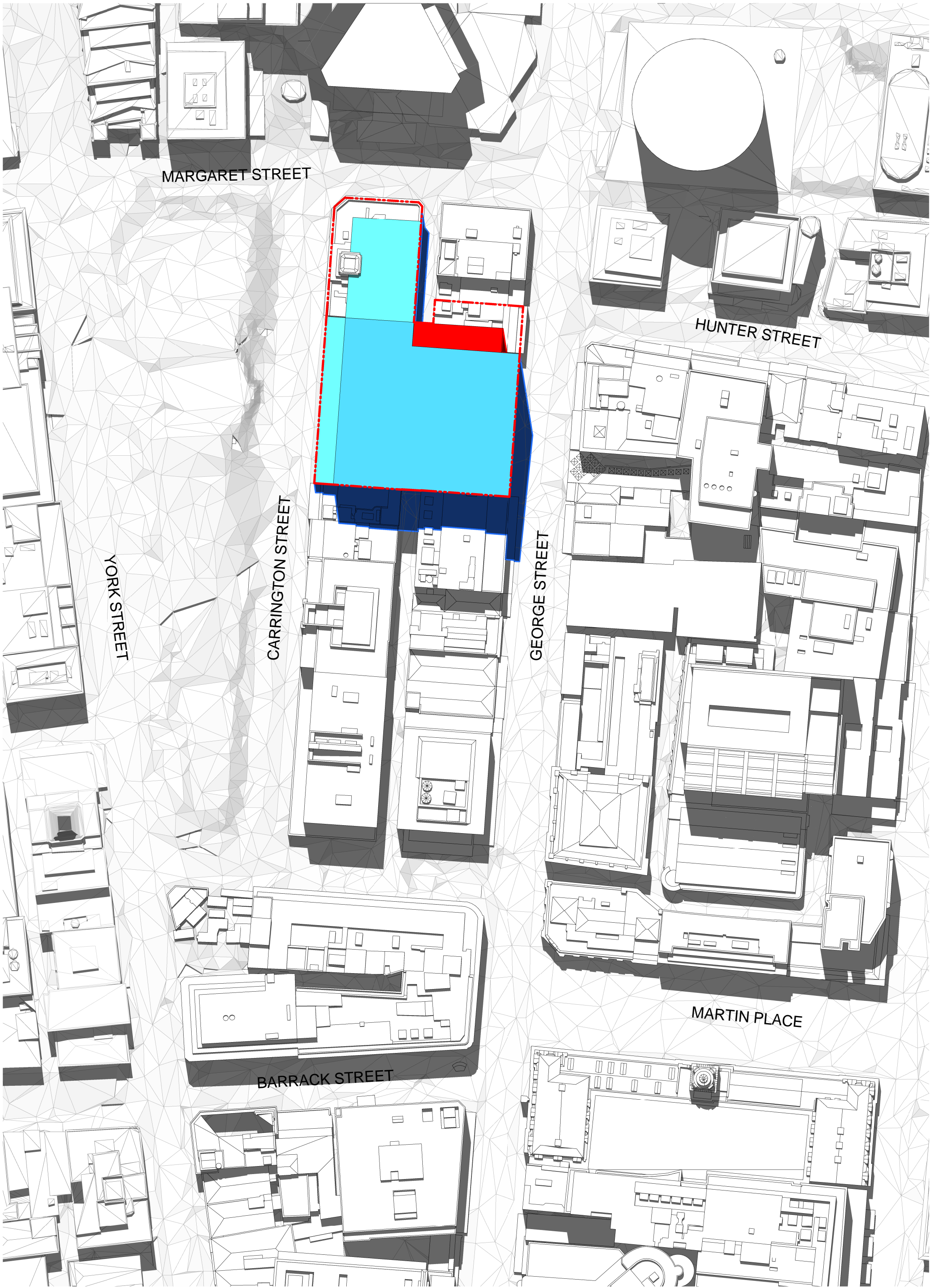
1 S75W - 22 December 1100 - Existing Scale: 1 : 1000