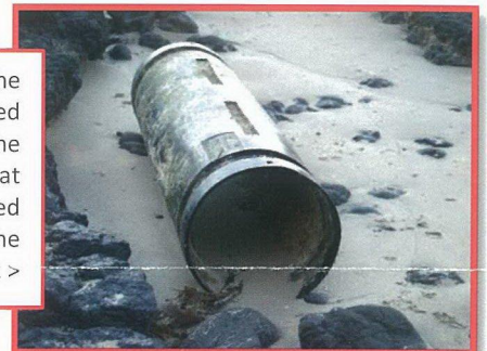
Photo of a piece of the diseased/ contaminated pipes from one of the Abalone Farms that contaminated 1200 metres of the Victorian Coast >

Imagine the destruction of four trenches of pipes like these being laid > each ½ km long – to pump Port water 24/7! It will be a first for our Port. What will be next???