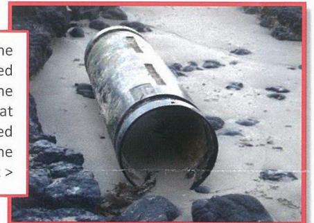
Photo of a piece of the diseased/ contaminated pipes from one of the Abalone Farms that contaminated 1200 metres of the Victorian Coast >

Imagine the destruction of four trenches of pipes like these being laid > each ½ km long – to pump Port water 24/7! It will be a first for our Port. What will be next???