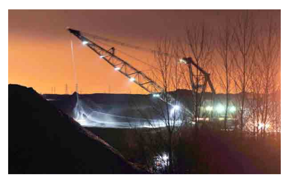
Figure 1. An image of a dragline working at night

the full extent of the visual impact on this view, as opposed to only half of the visual impact, as shown on this photomontage. As also mentioned in my earlier report, Anglo American cannot rely on a few rows of trees along the site boundary to screen these views from the Golden Highway, over a 20+year period. An assessment of this retracted mine plan cannot be made without these photomontages.