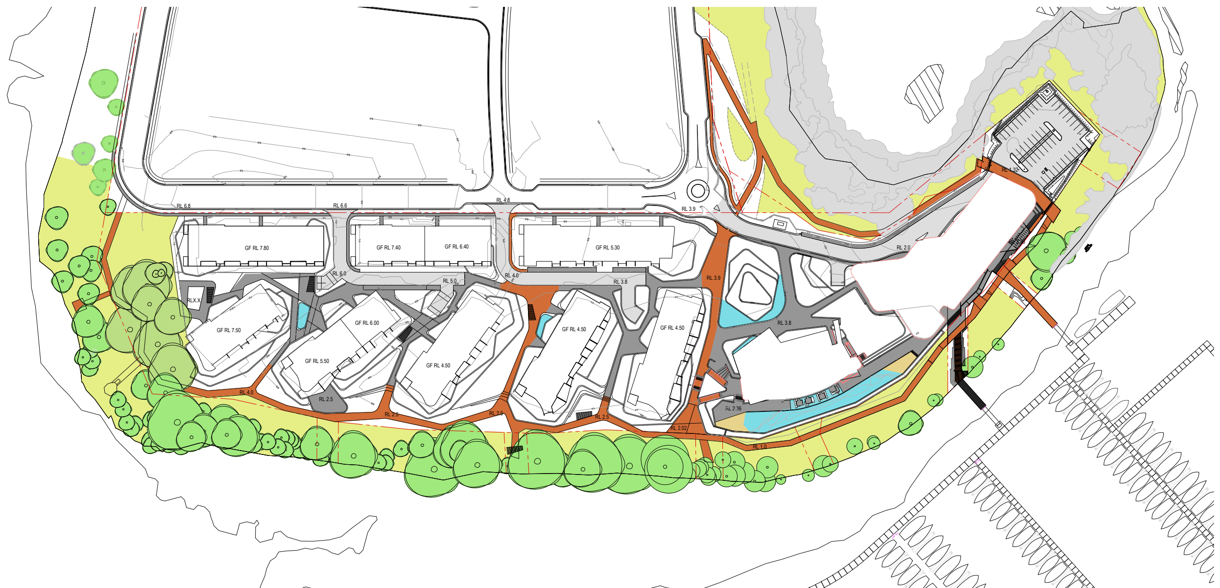
Figure 14. Indicative design levels open space.