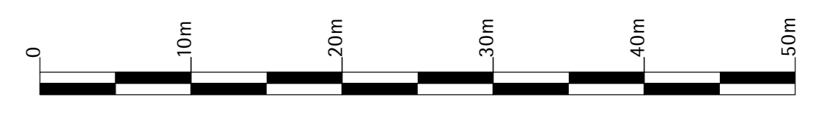
01 North Elevation 1:1000