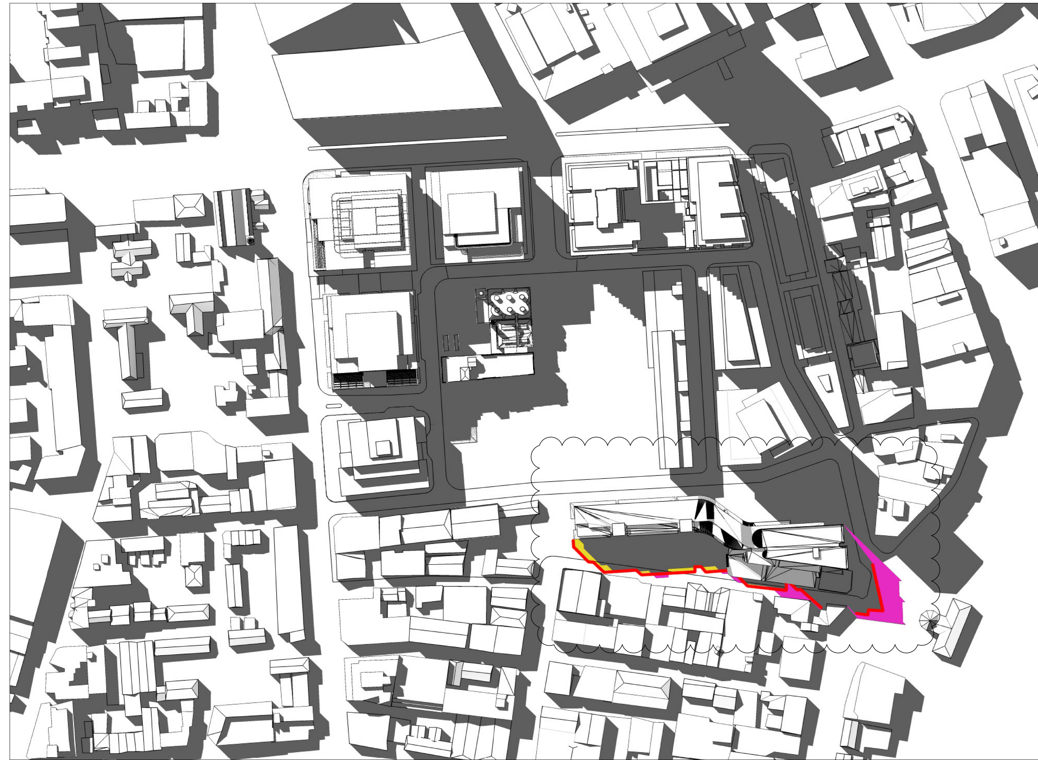
03 21 March 2pm

General Notes 1. Do not scale drawings. Dimensions govern. 2. All dimensions are in meters unless noted otherwise. 3. All dimensions shall be verified on site before proceeding work. 4. Foster + Partners shall be notified in writing of any discrepancies. 5. Australian Eastern Time Zone: UTC/GMT +10 hours