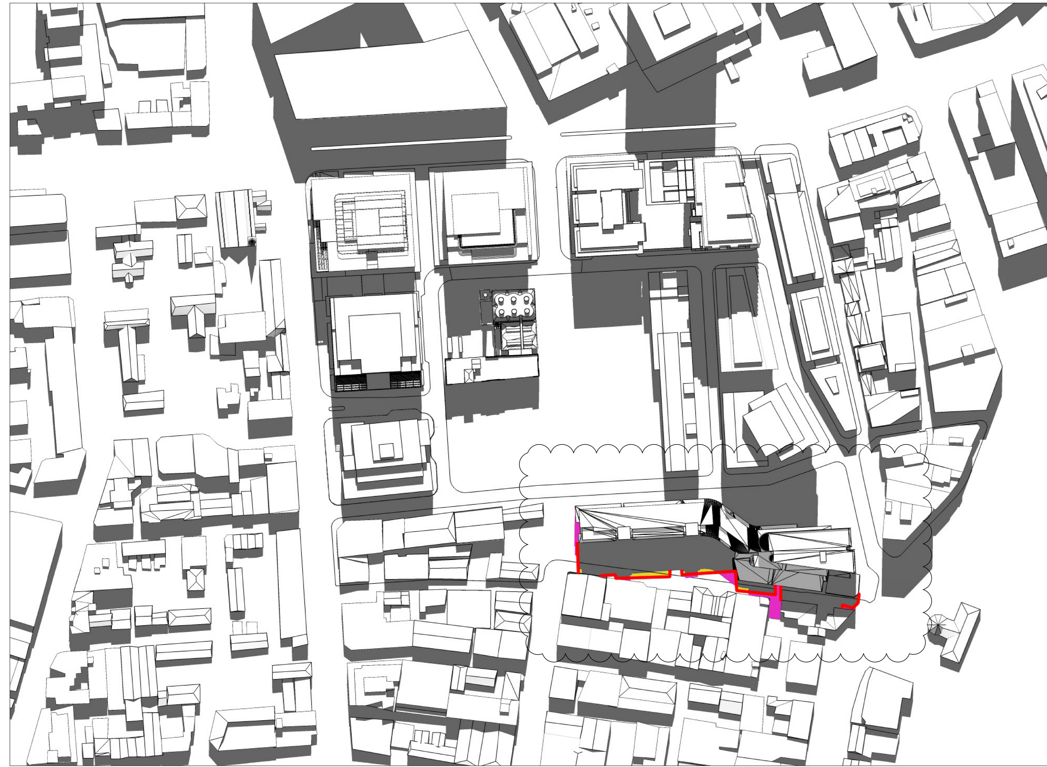
01 21 March 12pm