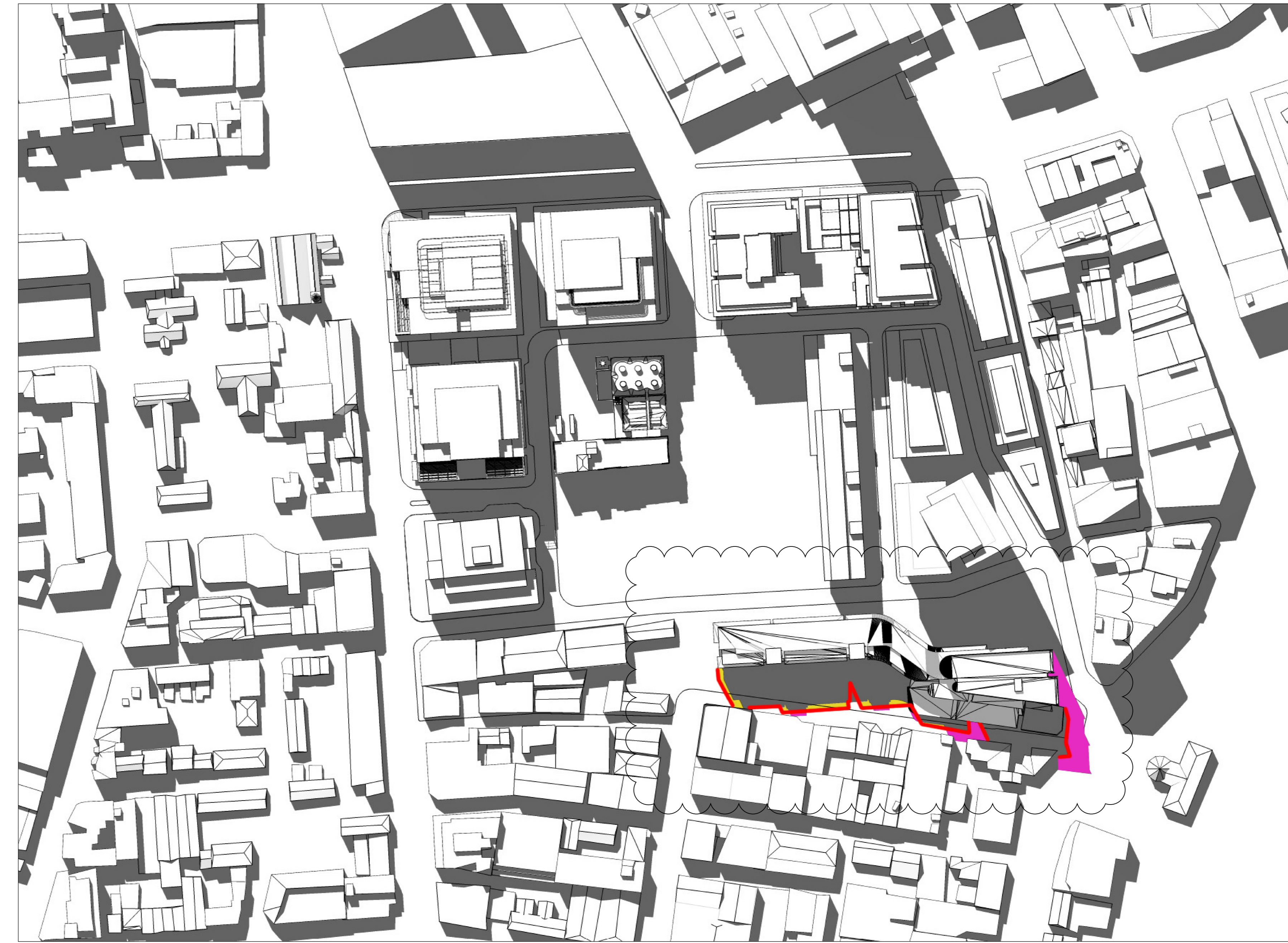
02 21 March 1pm