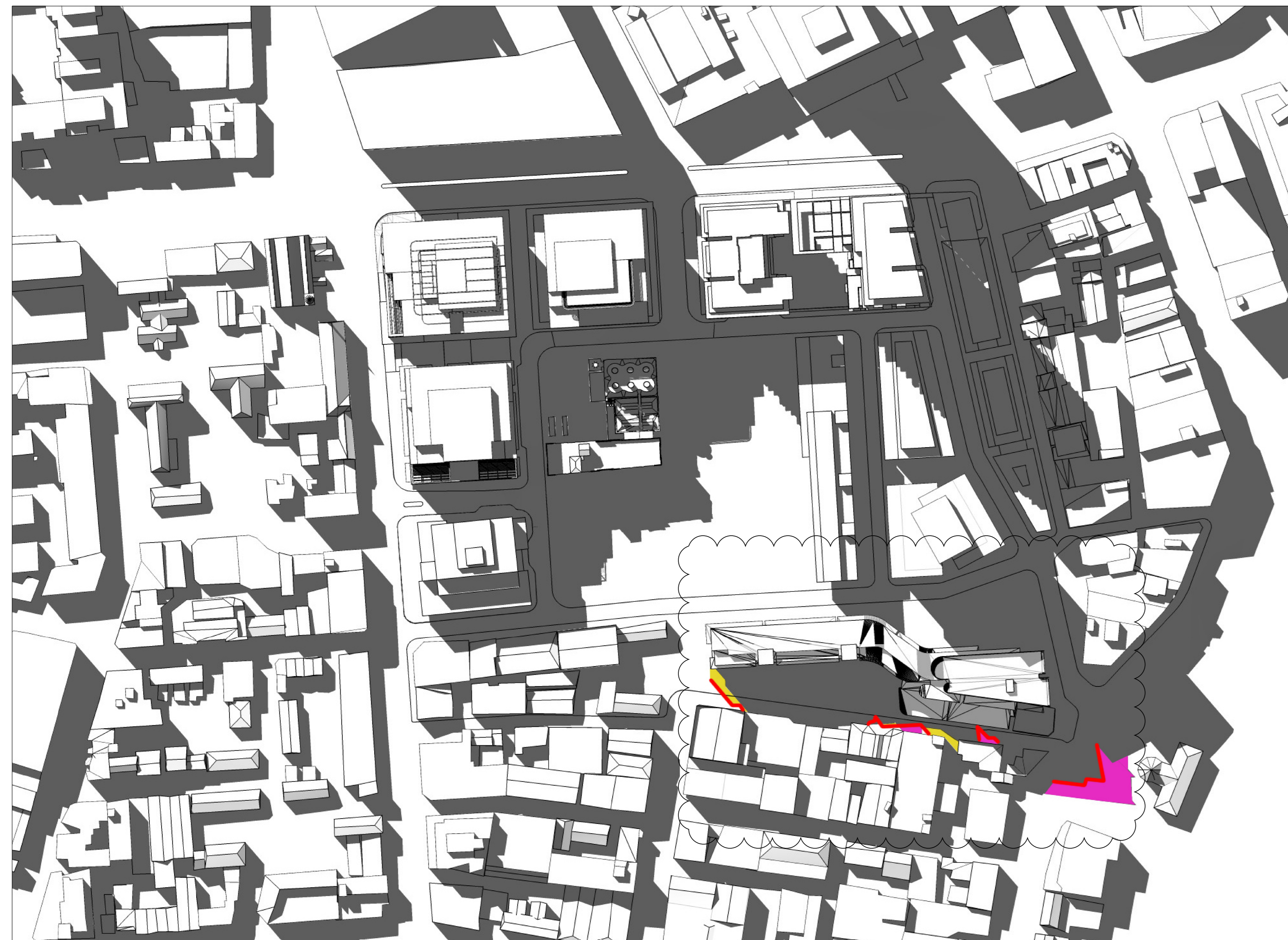
03 14 April 2pm

General Notes 1. Do not scale drawings. Dimensions govern. 2. All dimensions are in meters unless noted otherwise. 3. All dimensions shall be verified on site before proceeding work. 4. Foster + Partners shall be notified in writing of any discrepancies. 5. Australian Eastern Time Zone: UTC/GMT +10 hours