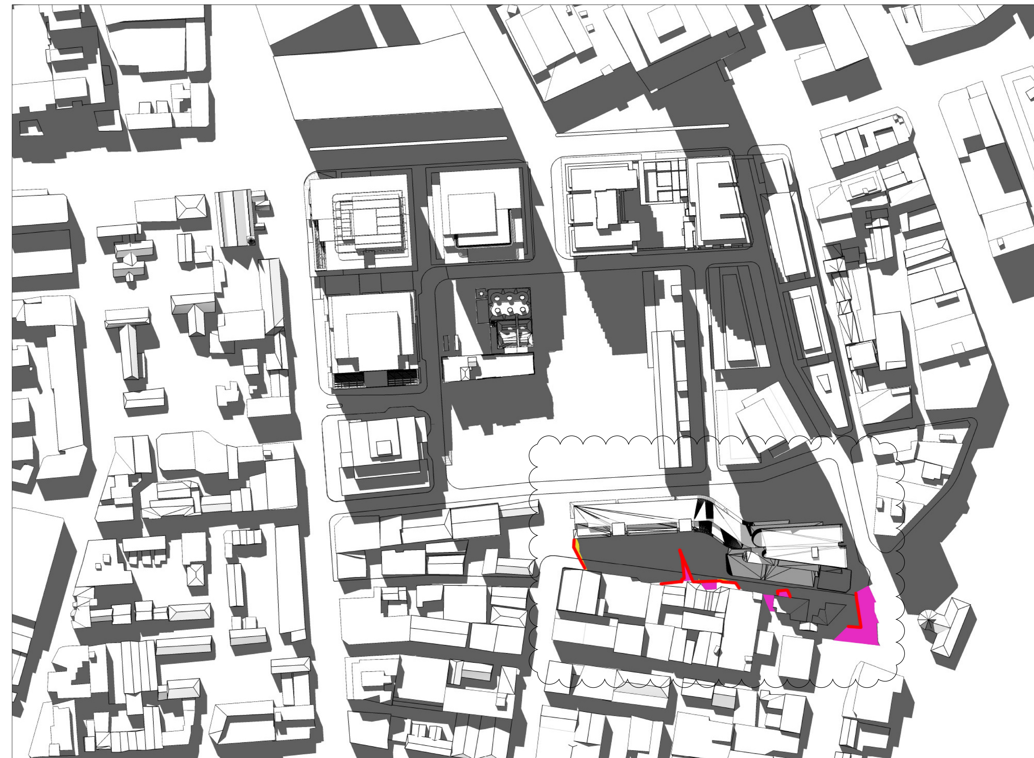
02 14 April 1pm