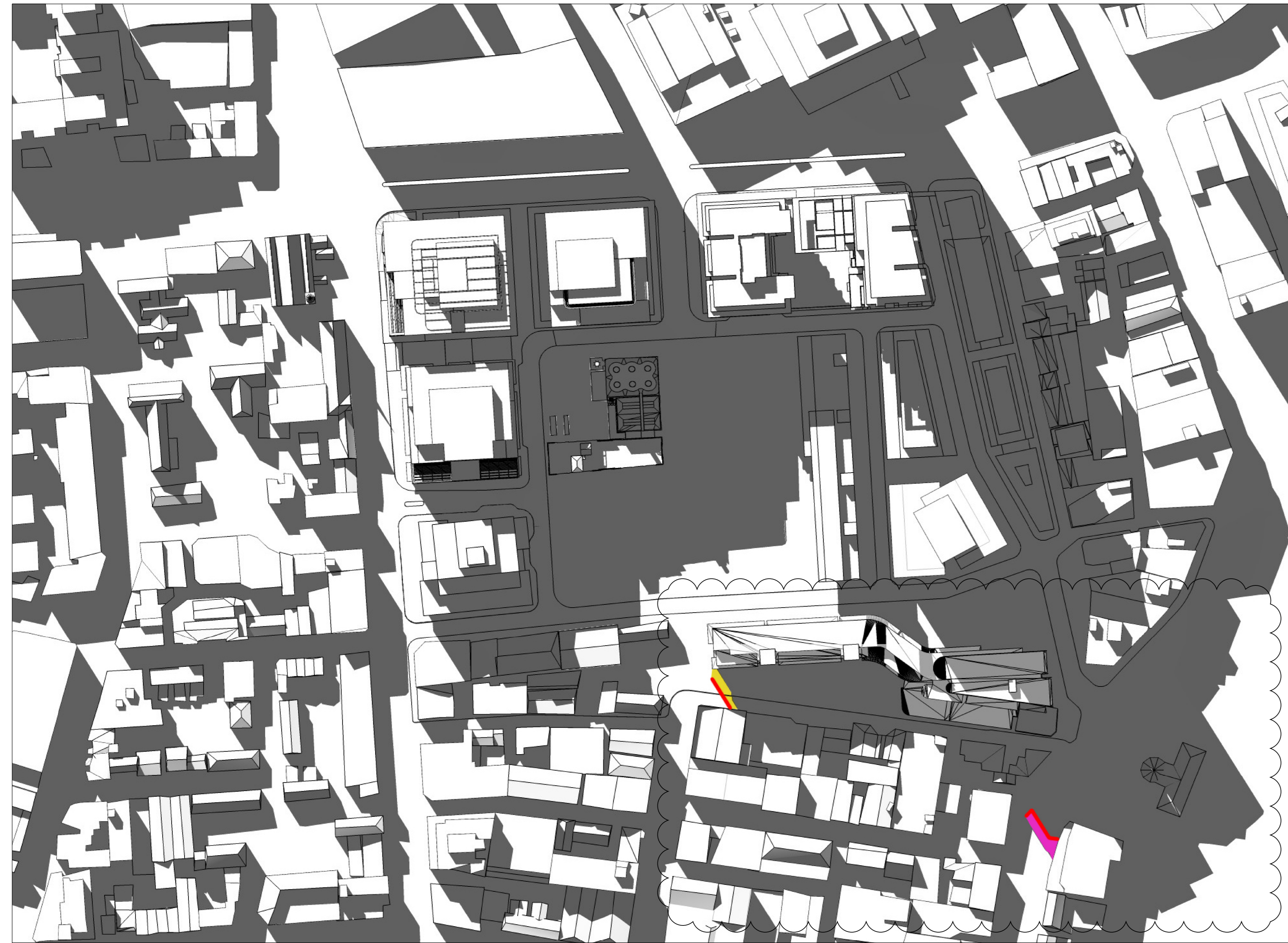
03 21 June 2pm

General Notes 1. Do not scale drawings. Dimensions govern. 2. All dimensions are in meters unless noted otherwise. 3. All dimensions shall be verified on site before proceeding work. 4. Foster + Partners shall be notified in writing of any discrepancies. 5. Australian Eastern Time Zone: UTC/GMT +10 hours