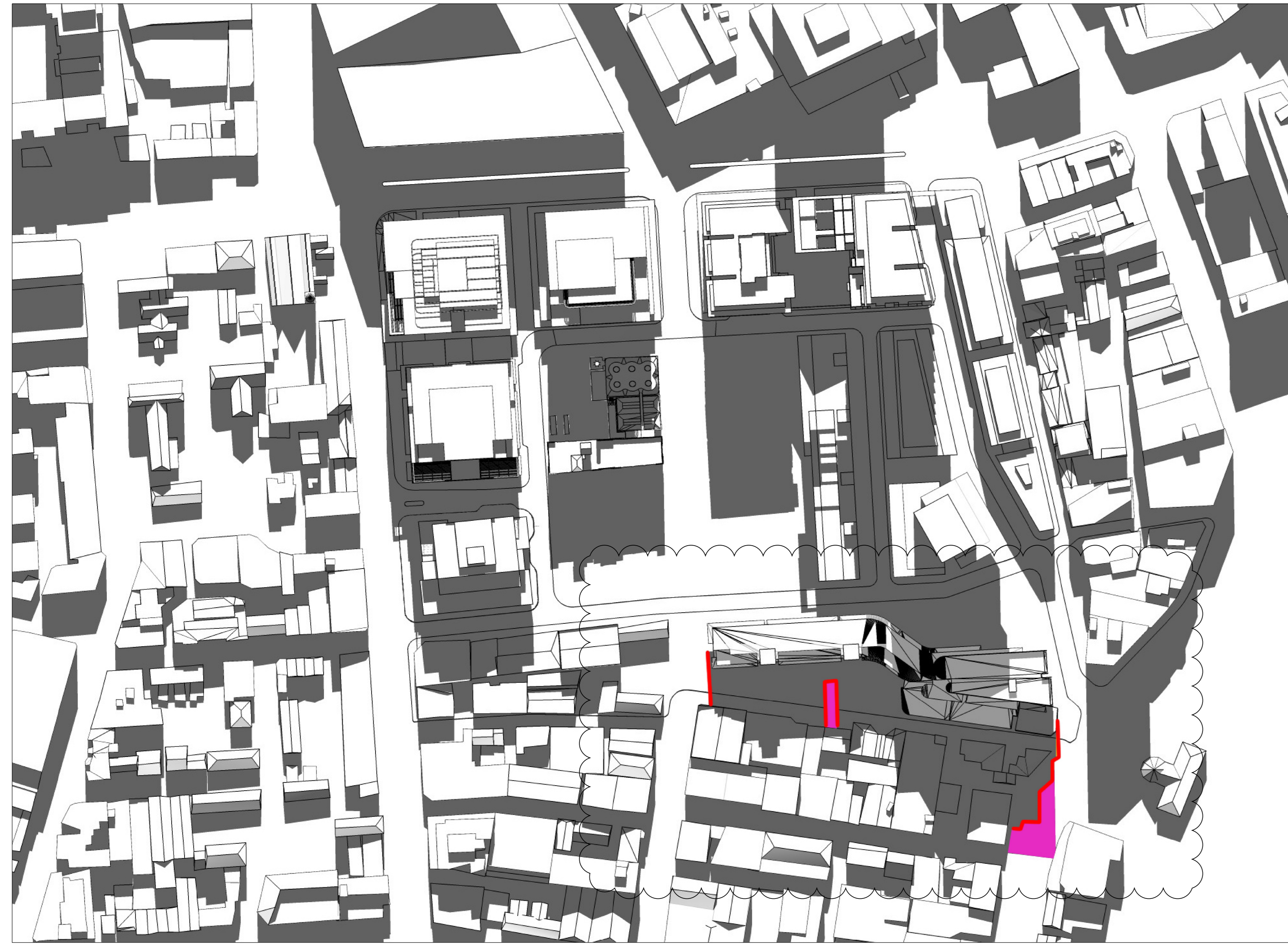
01 21 June 12pm