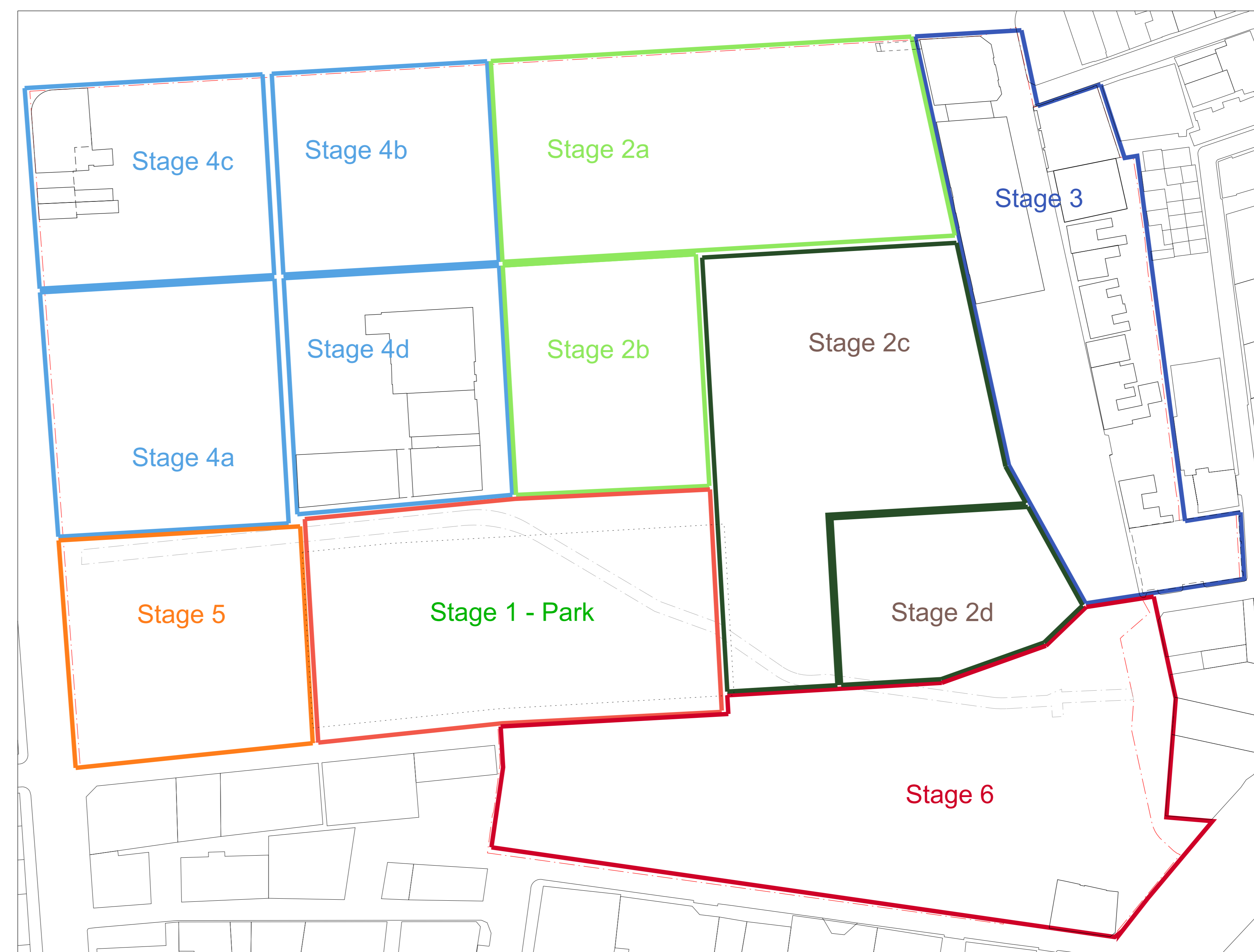
02 Stage zoning 1:2000