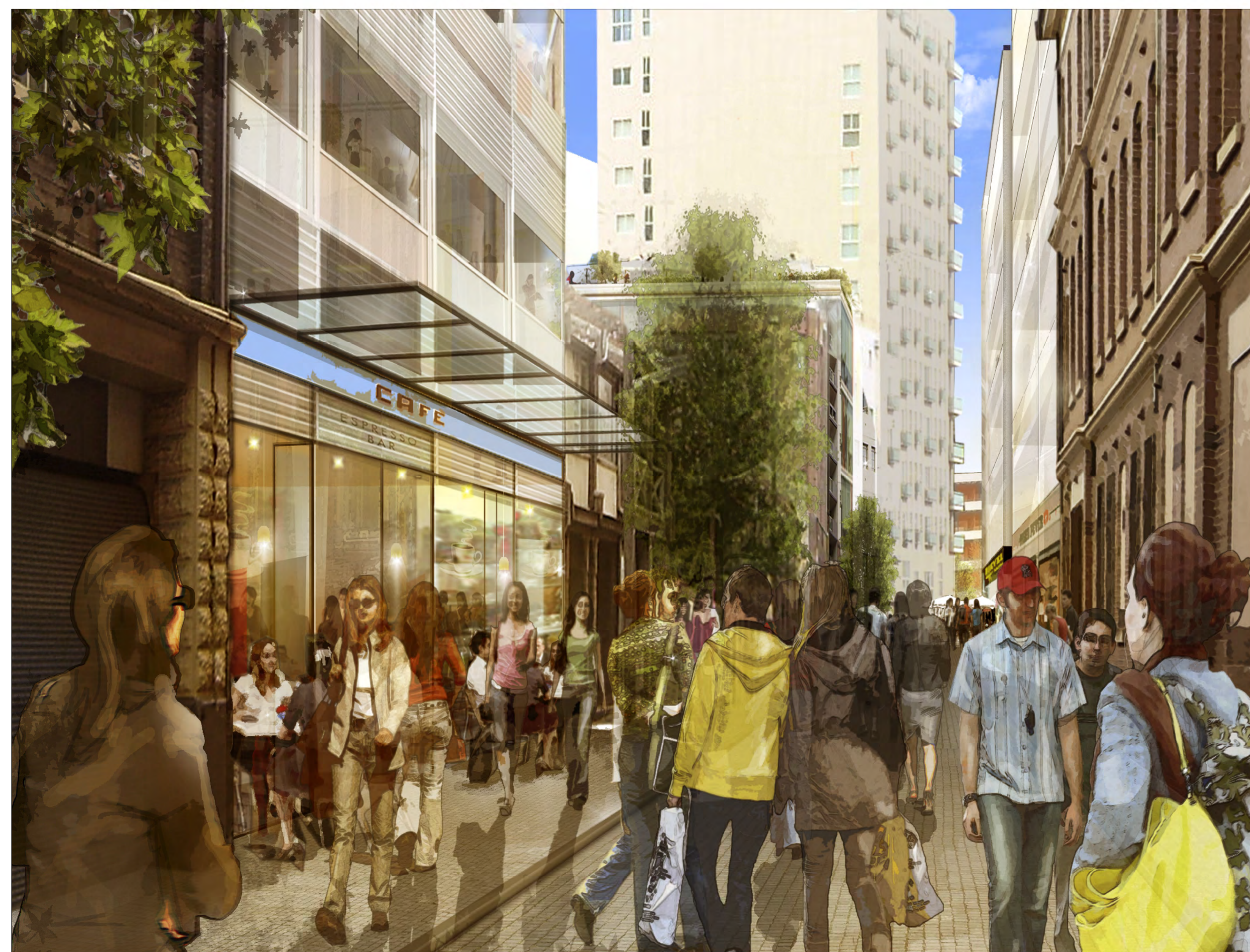
03 Kensington Street NTS