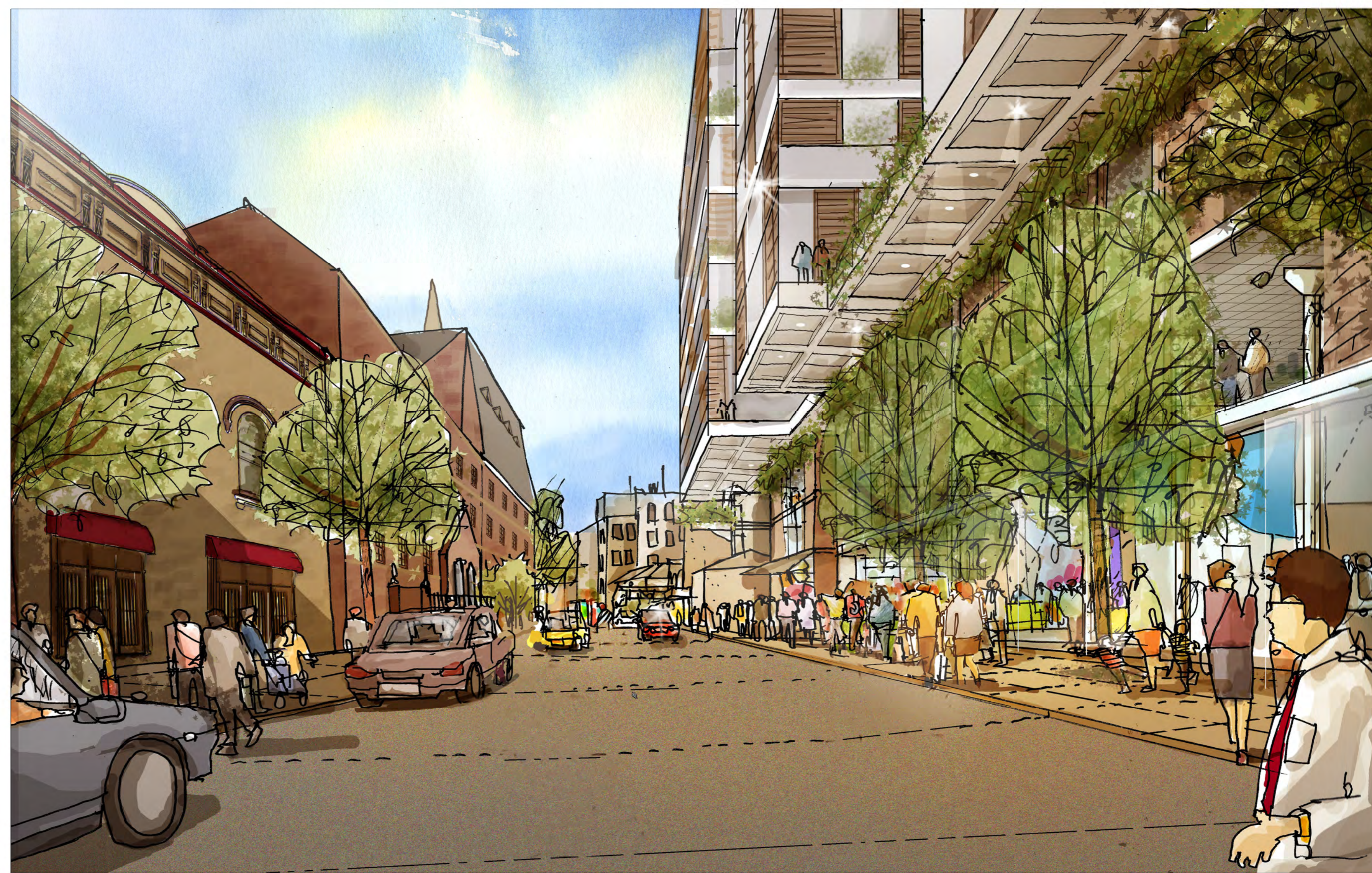
02 Abercrombie Street NTS