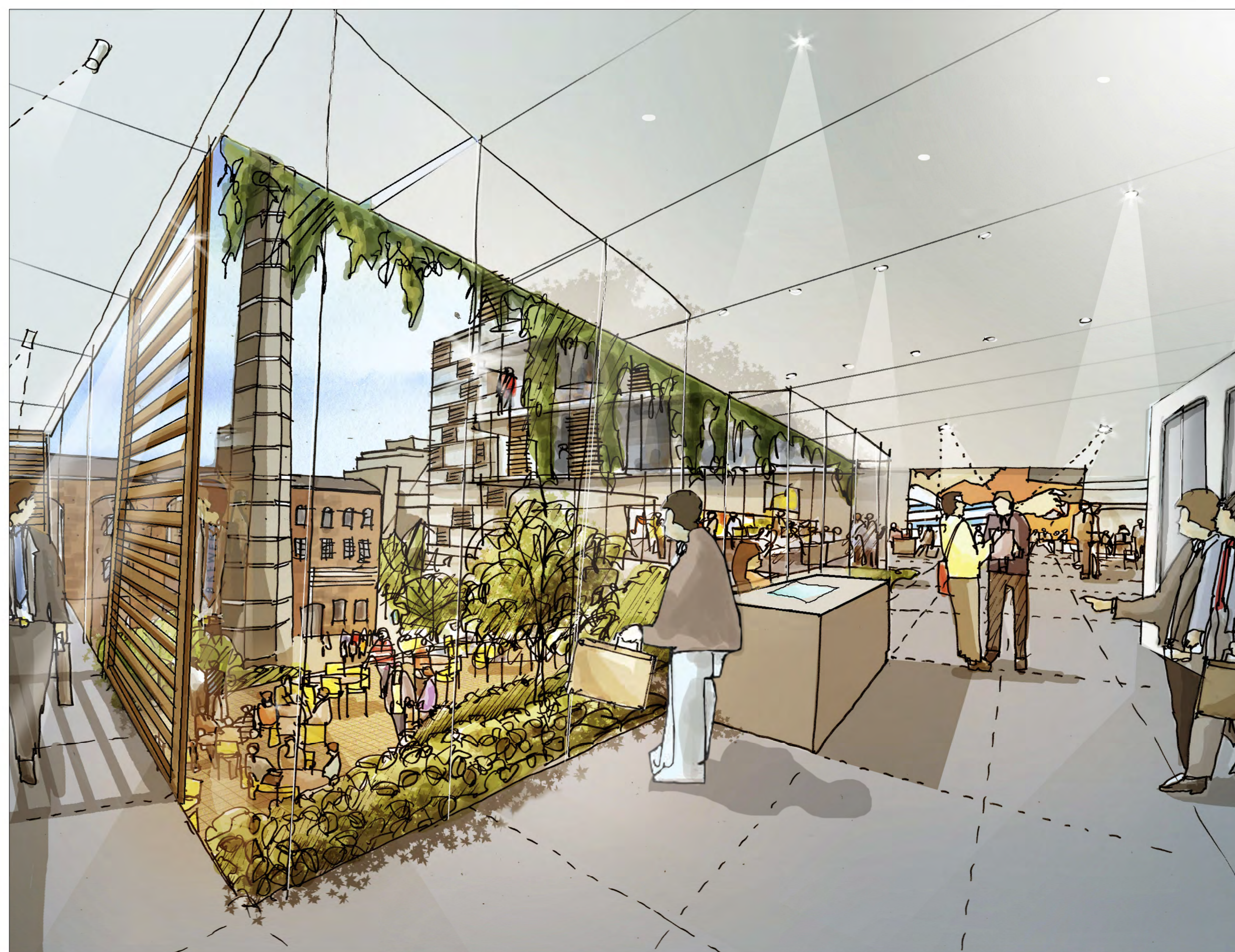
04 Brewery Yard - Offices NTS

General Notes 1. Do not scale drawings. Dimensions govern. 2. All dimensions are in meters unless noted otherwise. 3. All dimensions shall be verified on site before proceeding work. 4. Foster + Partners shall be notified in writing of any discrepancies.