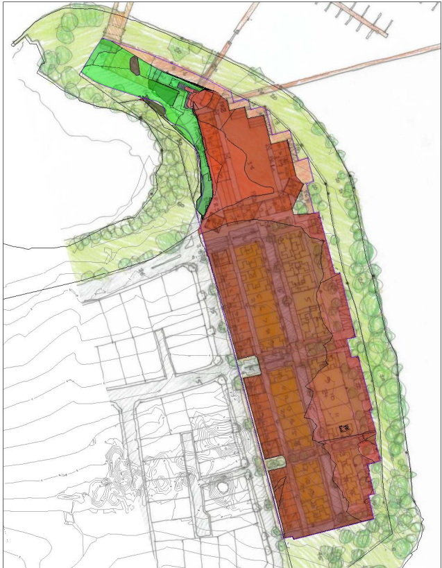
4. DEPTH OF APPROVED CONCEPT EXCAVATION (BASED ON INTERPRETATION OF PIAZZA LEVELS FROM PAGE 10 FORM APPROVED CONCEPT PLAN) (ASSUMED FILL ACCROSS CENTRAL AND SOUTHERN PRECINCT AS NO DETAILS AVAILABLE) REFER TO LEGEND 1.