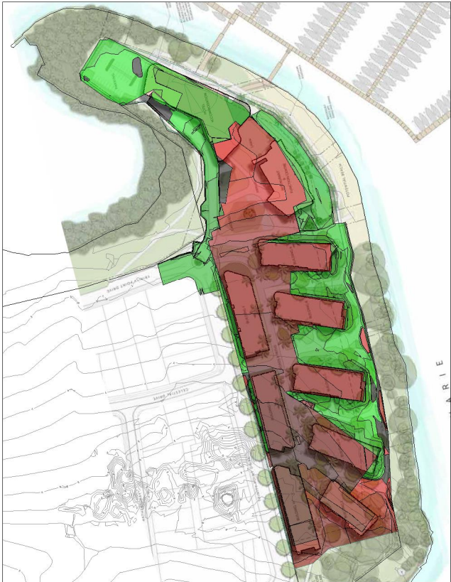
5. DEPTH OF PROPOSED EXCAVATION REFER TO LEGEND 1.