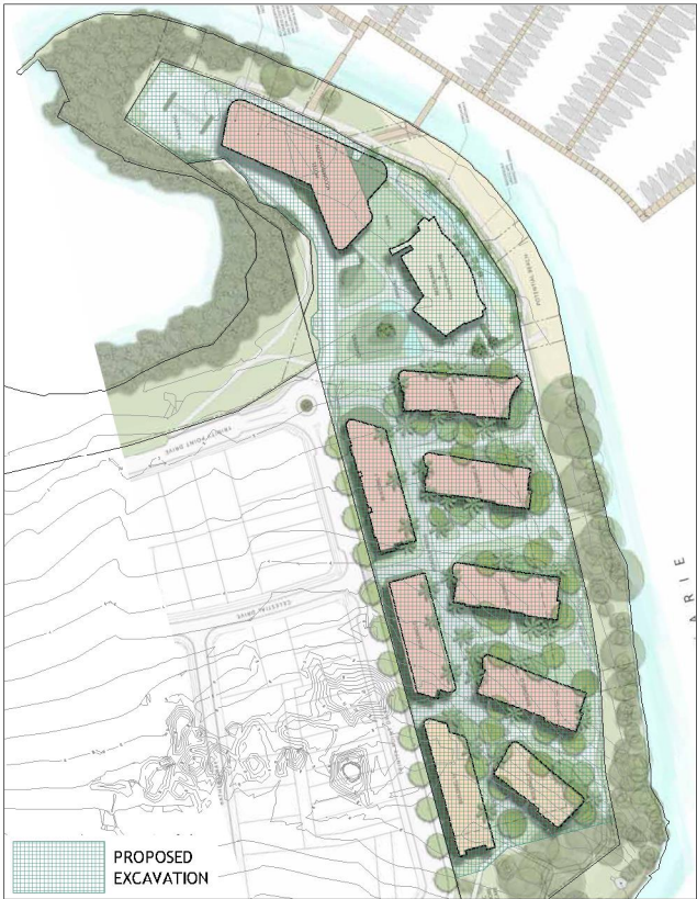
2. FOOTPRINT OF PROPOSED EXCAVATION