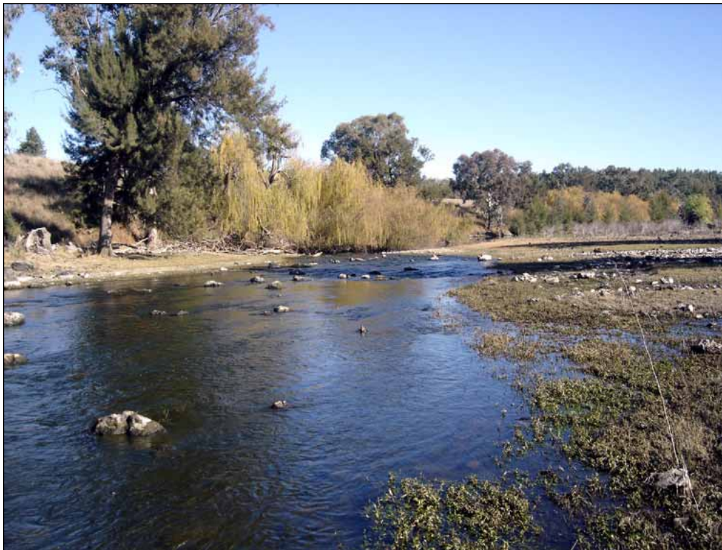
Plate 3 lower: Facing downstream over Site N02.