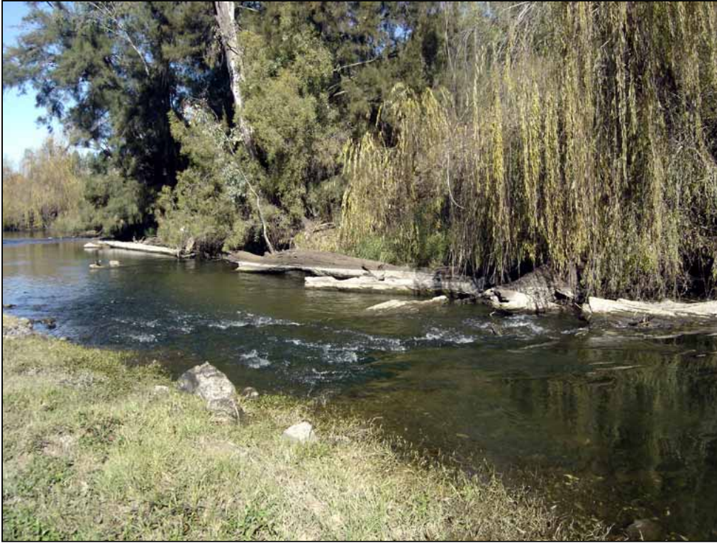
Plate 1 upper: Riparian vegetation along the Namoi River downstream of Keepit Dam.