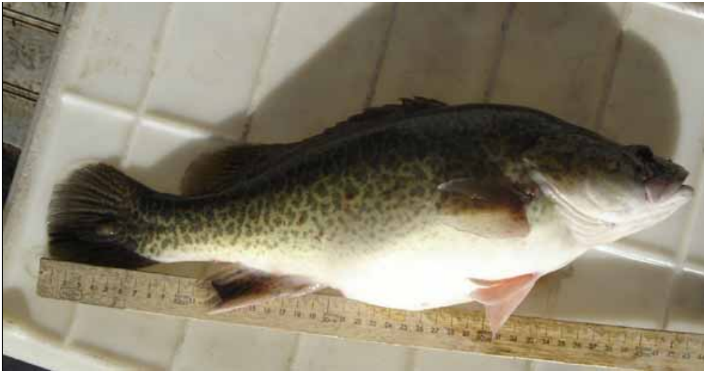
Plate 12 upper: Murray Cod ( Maccullochella peelii )