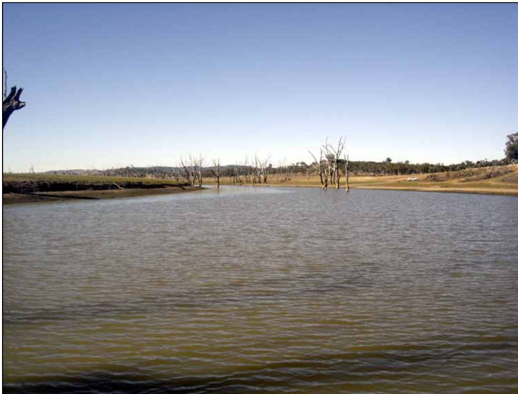
Plate 8 lower: The shallow upstream area of Lake Keepit.