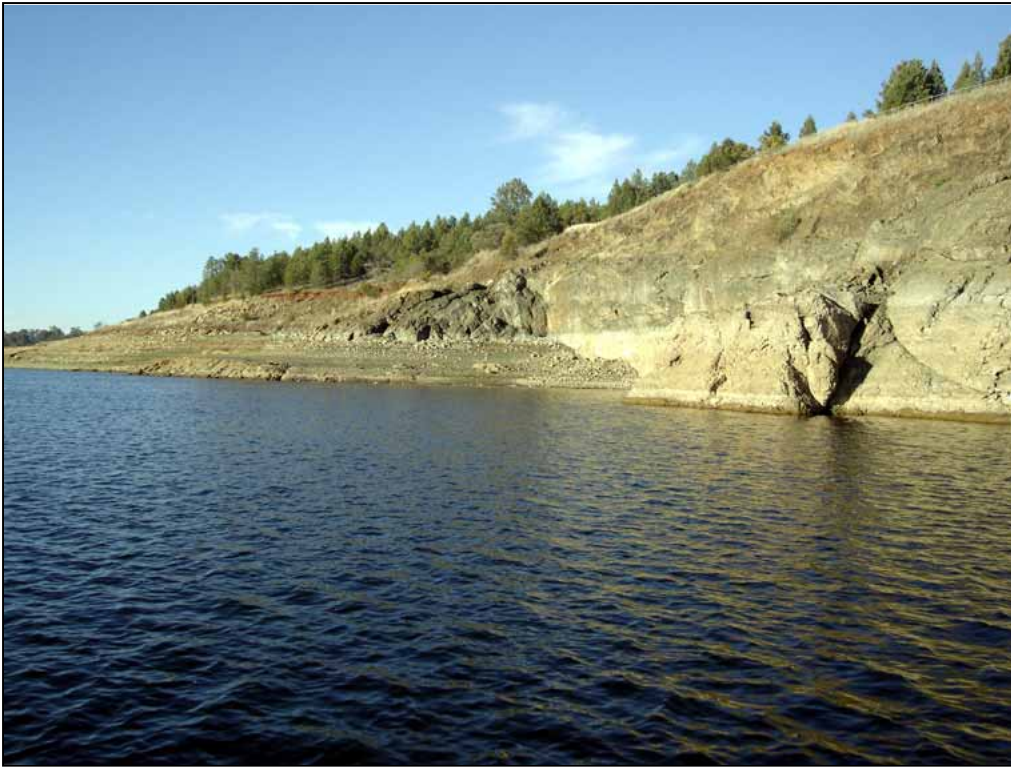
Plate 8 upper: Rocky outcrop at the edge of Lake Keepit at site of old quarry.