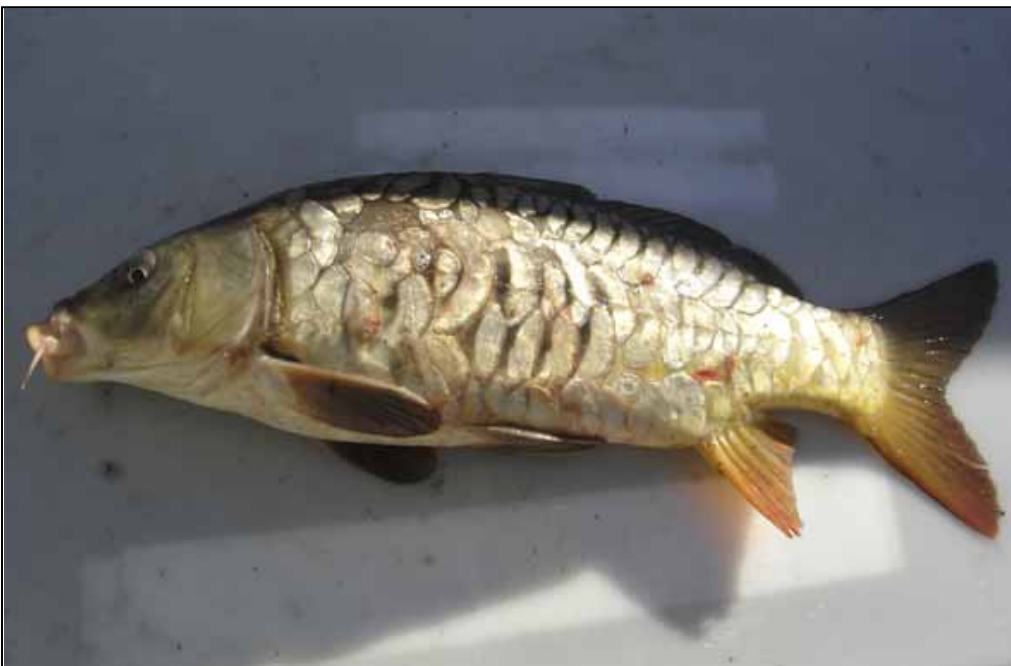
Plate 12 lower: Common Carp ( Cyprinus carpio ) mirrored form.