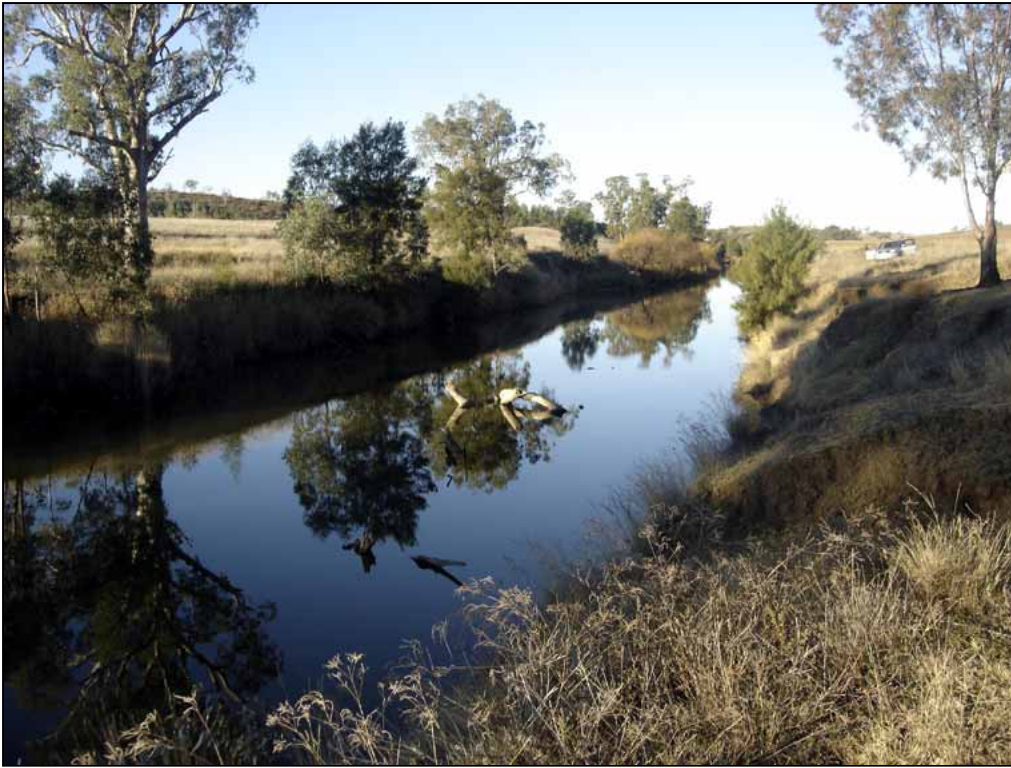
Plate 6 upper: Lower reaches of the Peel River at Site P02.