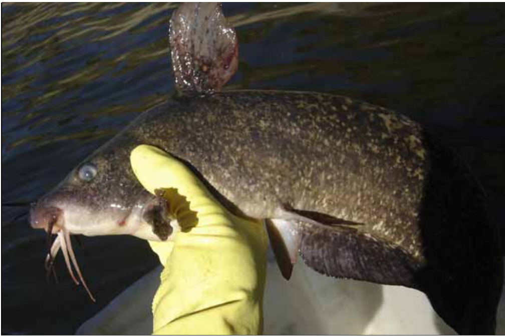
Plate 10 upper: Freshwater Catfish ( Tandanus tandanus )