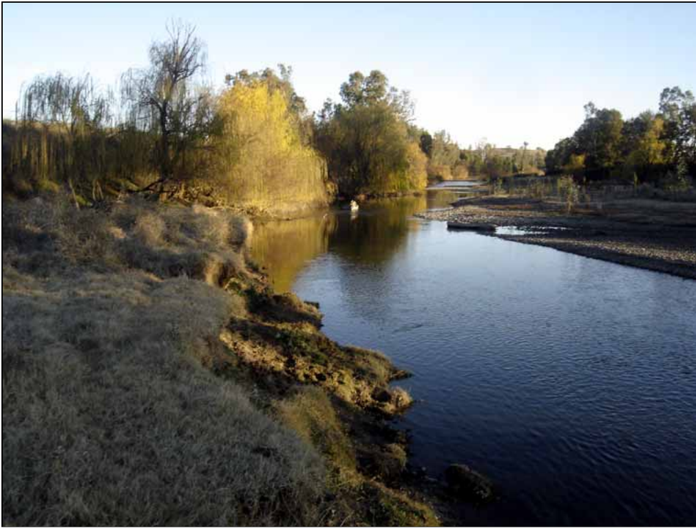
Plate 5 upper: Site N05.