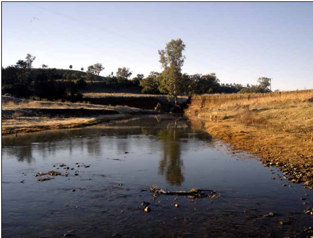
Plate 6 lower: View facing upstream at the open and eroded banks of the Peel River at Site P01.