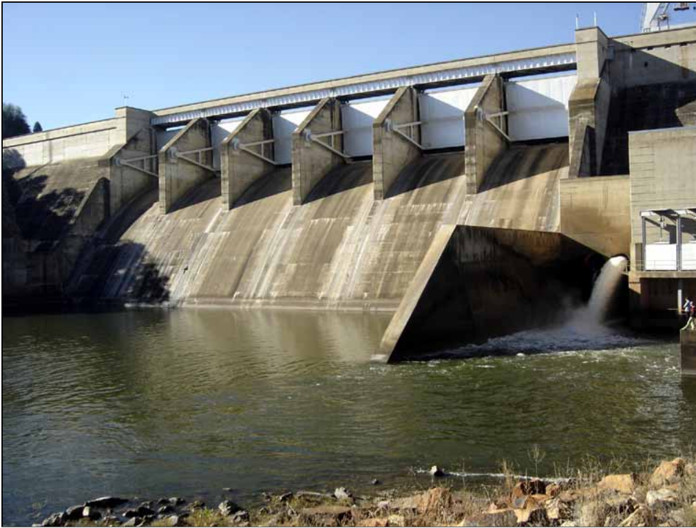
Plate 2 upper: The large pool at the base of Keepit Dam wall.