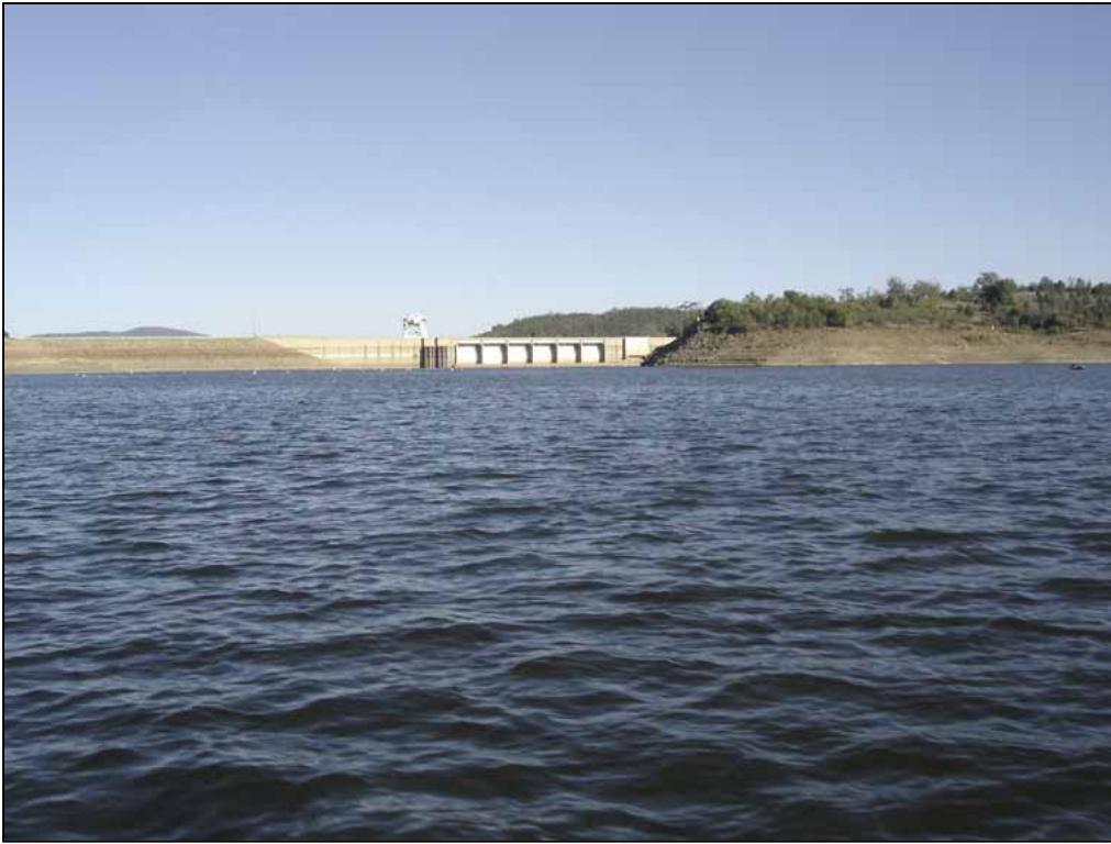
Plate 7 upper: Keepit Dam viewed from within the reservoir.