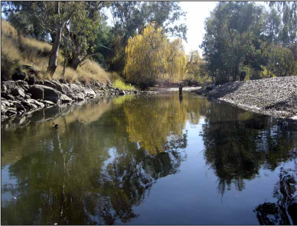
Plate 4 upper: Site N03.