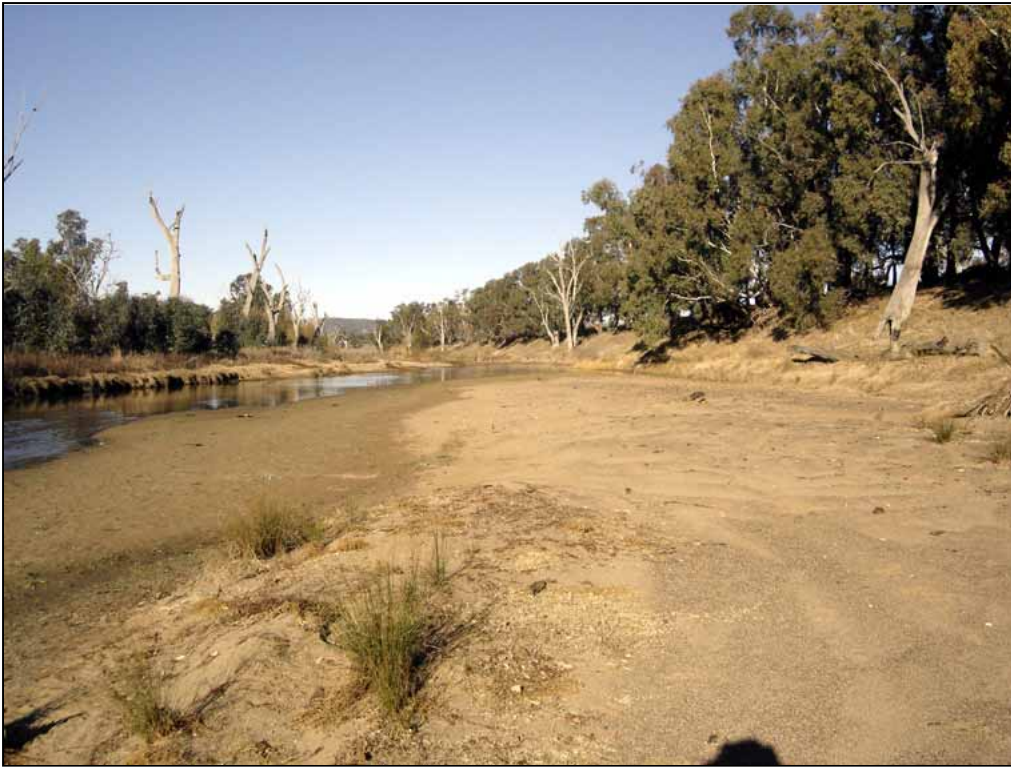
Plate 9 upper: Native riparian vegetation along the upper Namoi River.