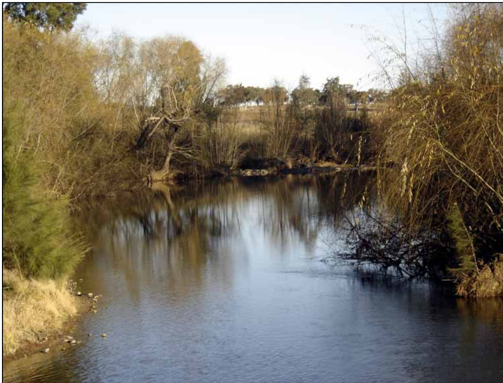
Plate 9 lower: Exotic riparian vegetation along the upper Namoi River near Manilla.