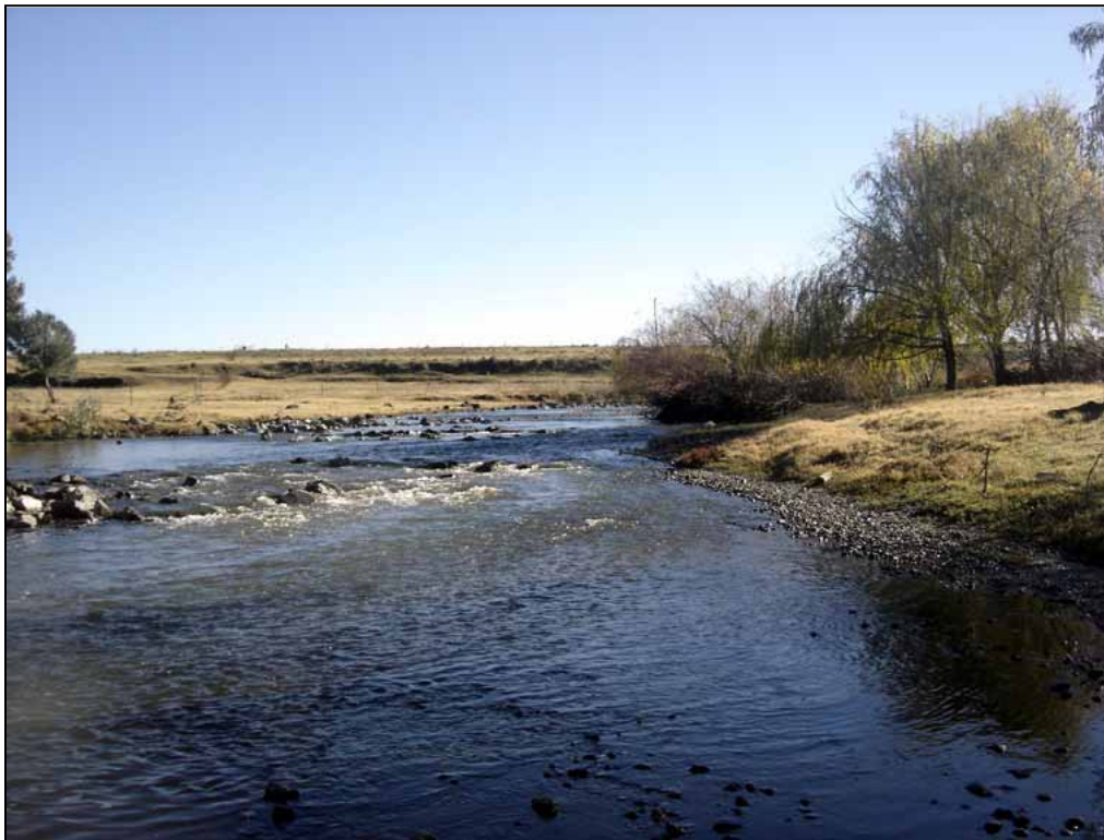
Plate 5 lower: Site N06.