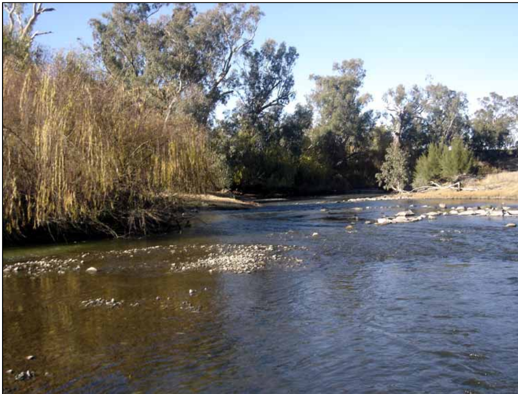
Plate 1 lower: The riparian vegetation at Site N06 was typical in having both native and introduced species.