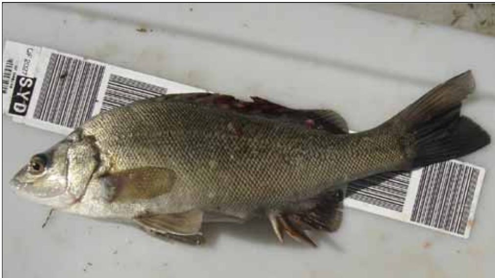
Plate 11 lower: Silver Perch ( Bidyanus bidyanus )