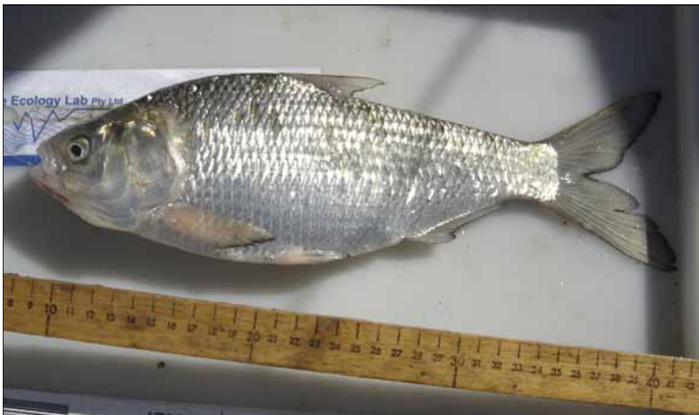
Plate 10 lower: Bony Herring ( Nematalosa erebi )