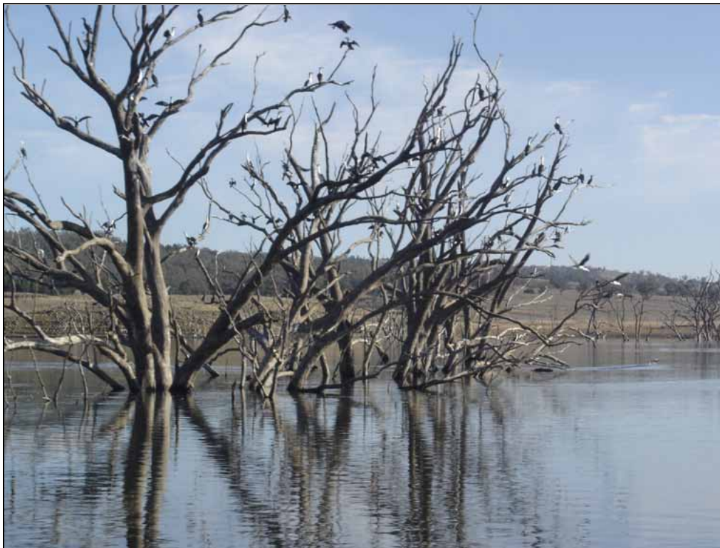
Plate 7 lower: Standing trees on Lake Keepit.