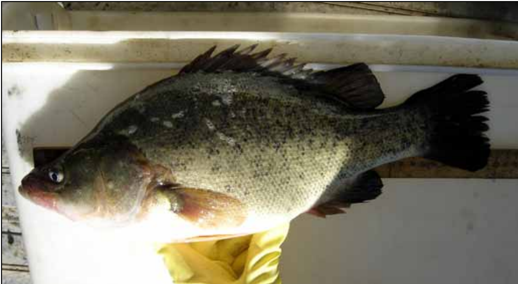
Plate 11 upper: Golden Perch ( Macquaria ambigua )