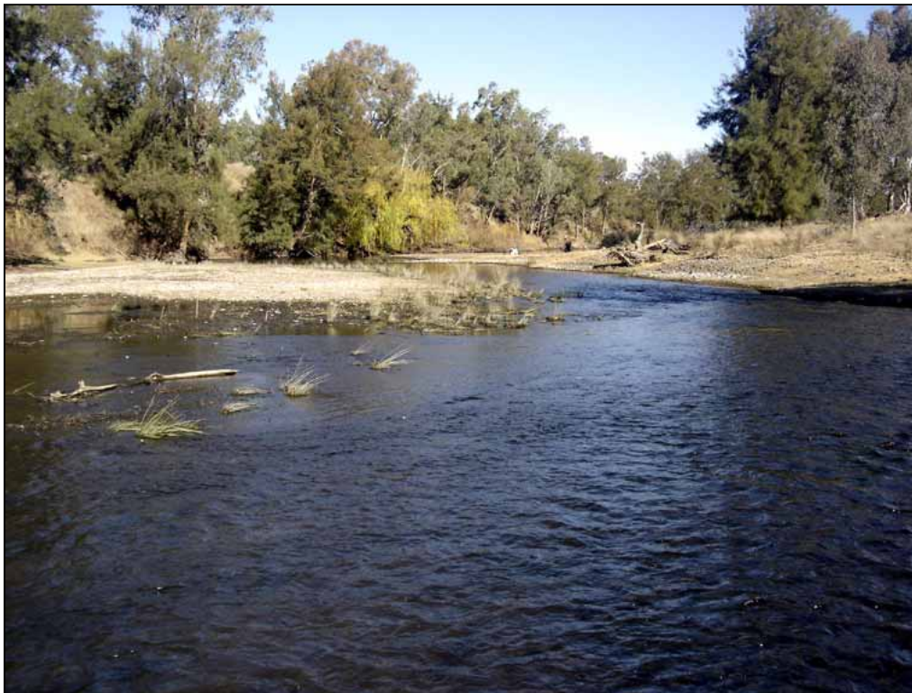
Plate 4 lower: Site N04.