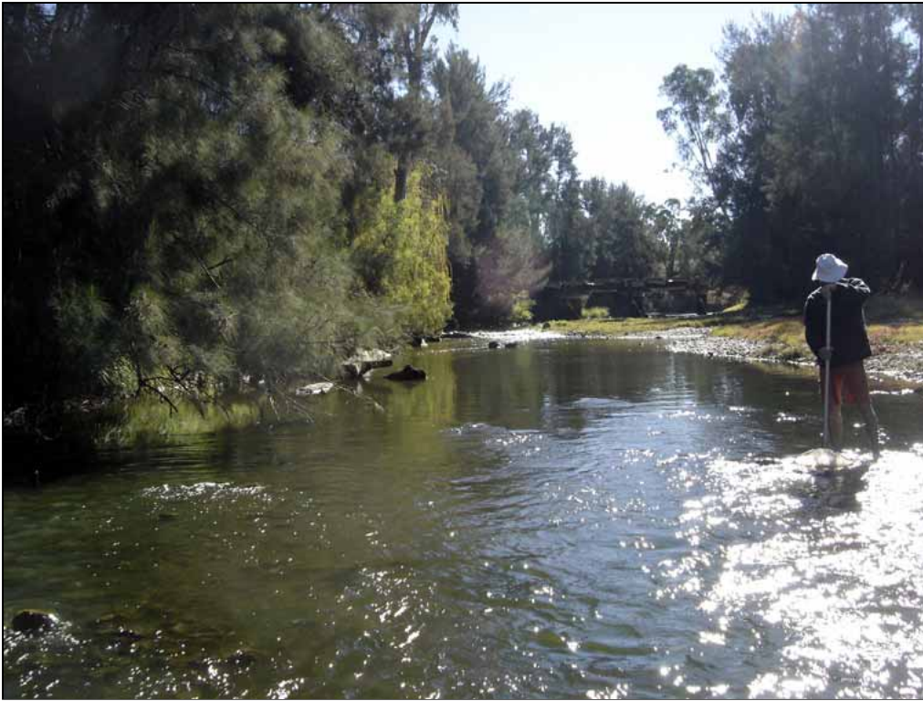
Plate 3 upper: View facing upstream through Site N01 while Ecology Lab personnel sample macroinvertebrates in riffle habitat.