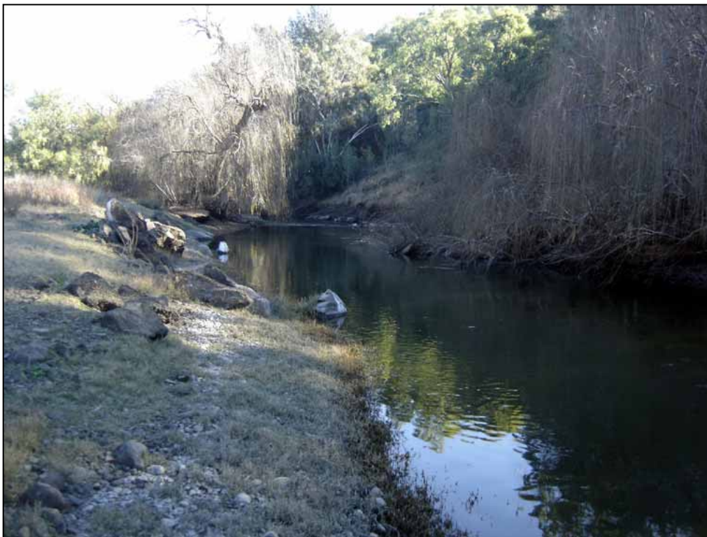
Plate 2 lower: View of the Namoi River channel below Keepit Dam.