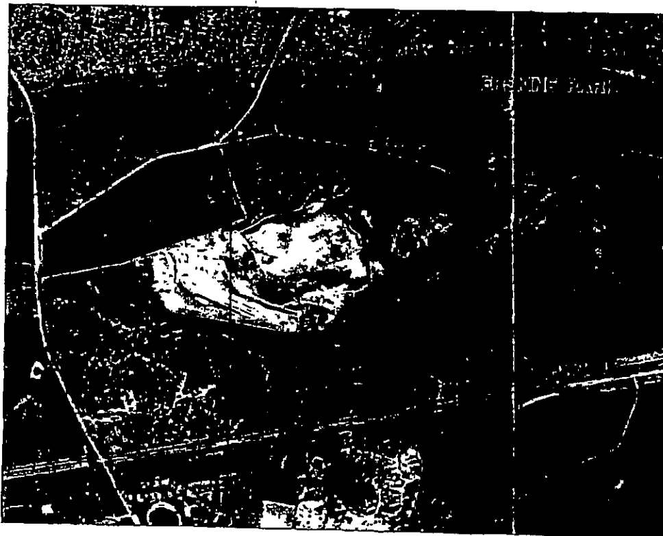
Figure 2 Erskine Park CSR lands for which Section 90 Consent to Destroy is requested