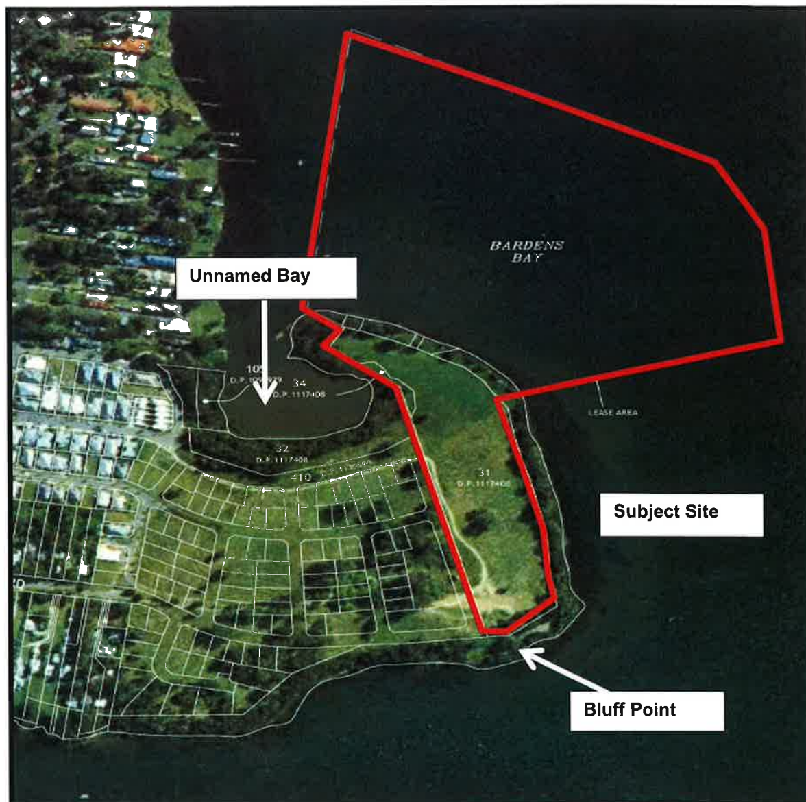
Figure 2: Extent of Site Area