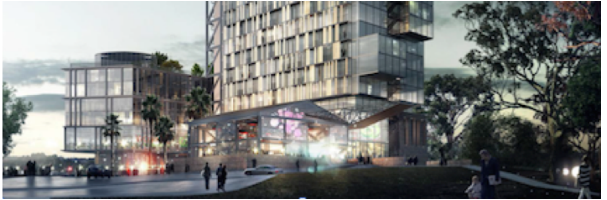
Figure 17, Design Excellence Competition Entry