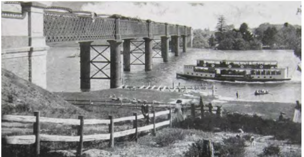
Figure 10, The road bridge and Bedlam Punt at Meadowbank.