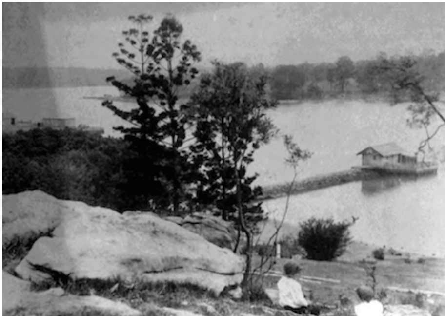
Figure 8, Robertson and Marks Architects, Meadowbank Shepherds Bay Urban Renewal Masterplan Project Application MP09_0216) November 2010