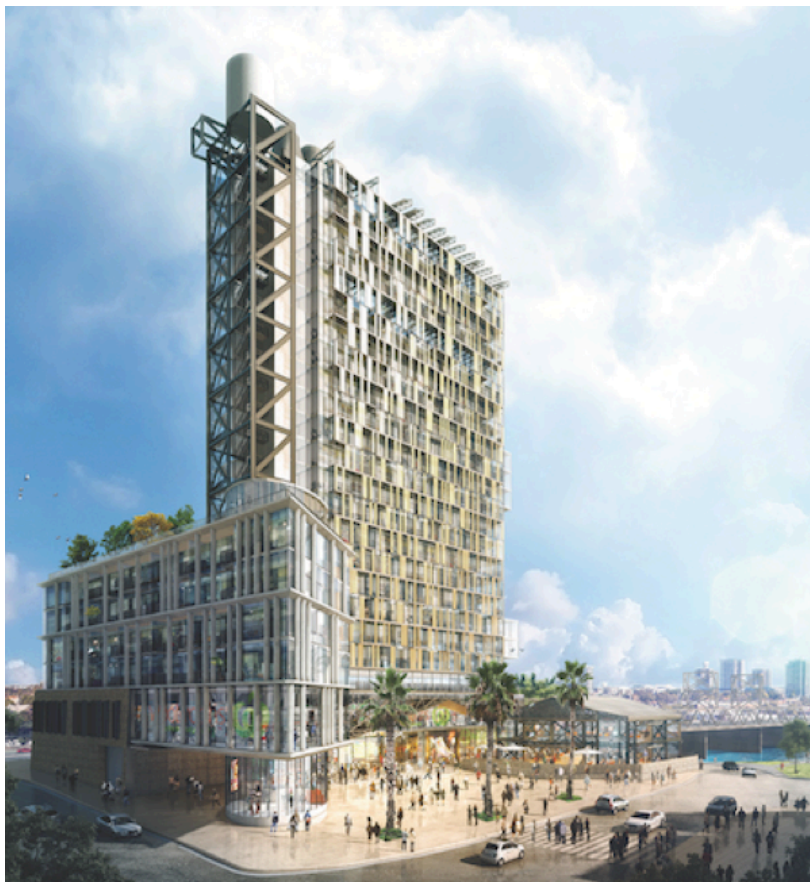
Figure 18, DA Submission