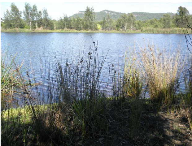
Waterbody looking West - February 2014