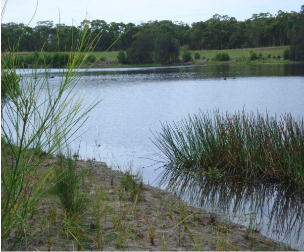
Waterbody looking south – February 2010