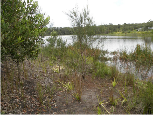
Waterbody looking South - February 2013