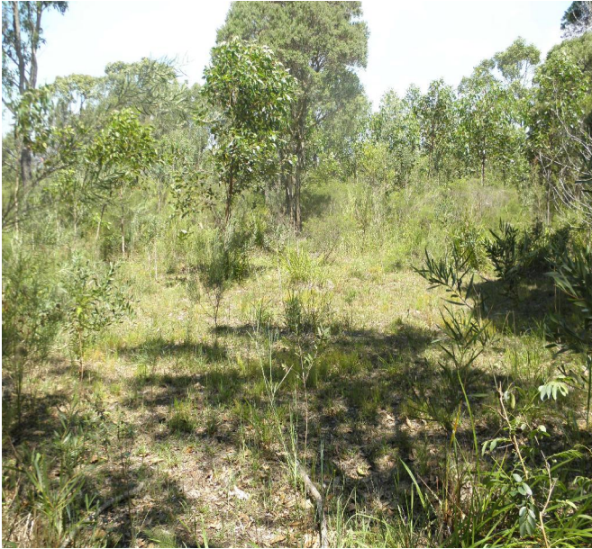
The Island Area also looking south - February 2008 (a)