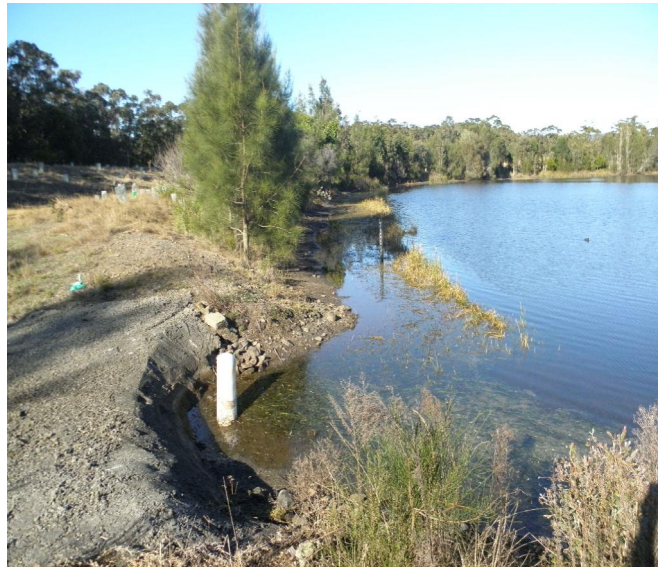
Waterbody looking south along edge - July 2014