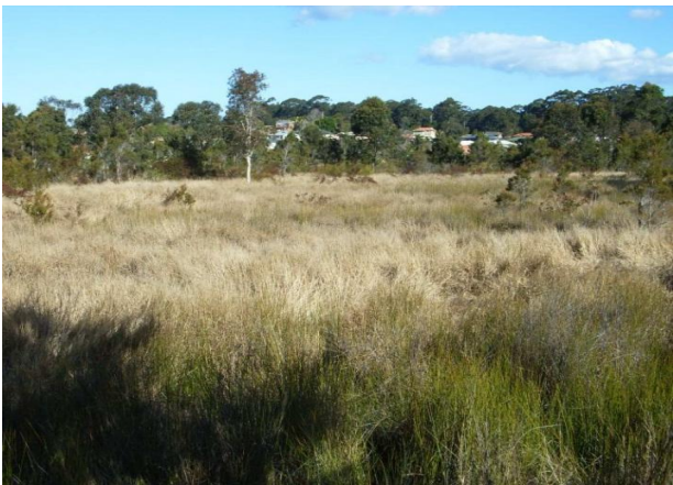
Central - Island area looking south – July 2007