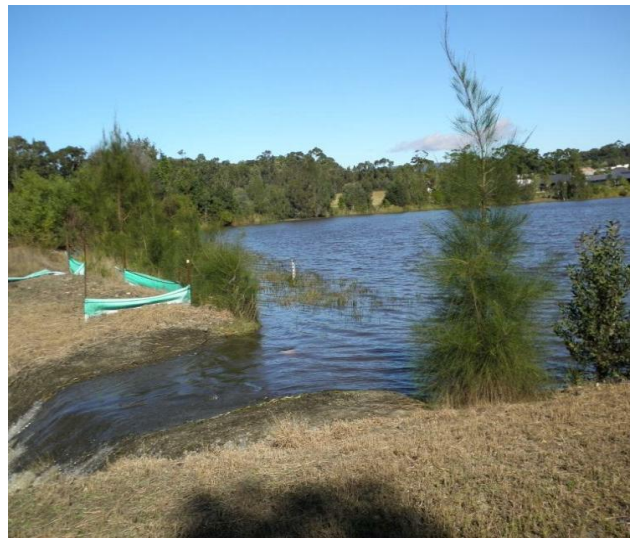
Waterbody view south along edge – July