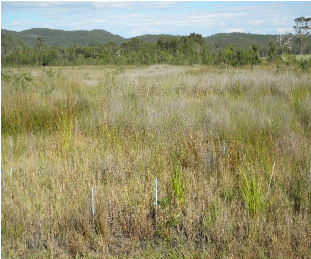
Wallum area looking West - february 2014