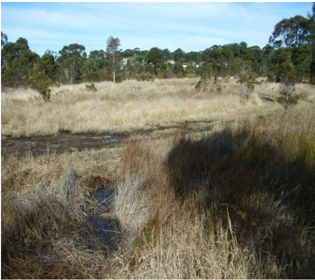
Central - Island area looking south – July 2008