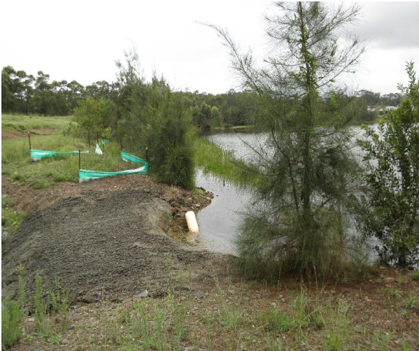
Waterbody looking south along edge – 2013 February 2013