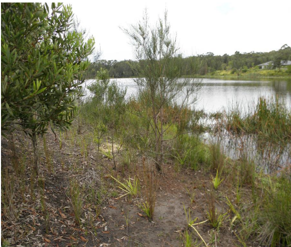
Waterbody looking south – February 2012