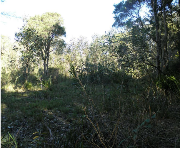
Central area looking south - July 2014