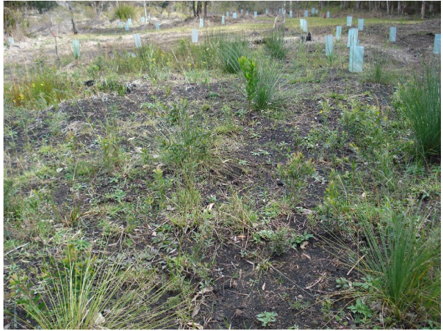
The Island Area also looking south - July 2009 (a)