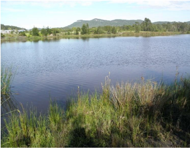
Waterbody looking west – February 2012