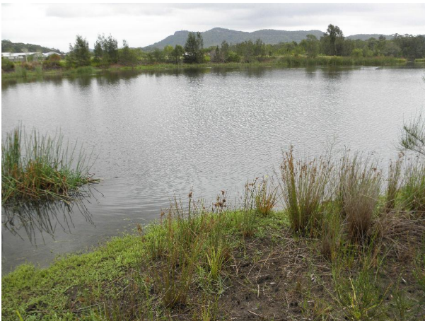
Waterbody looking West - February 2013