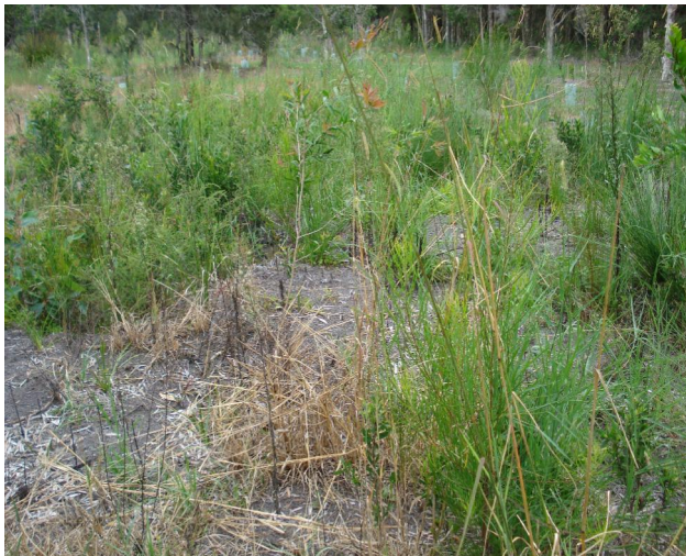
The Island Area also looking south - February 2010 (a)