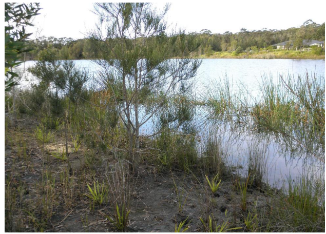
Waterbody looking South - July 2013