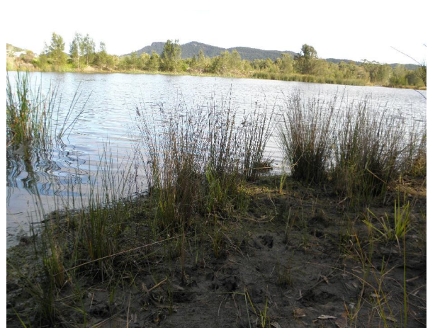
Waterbody looking West - July 2013