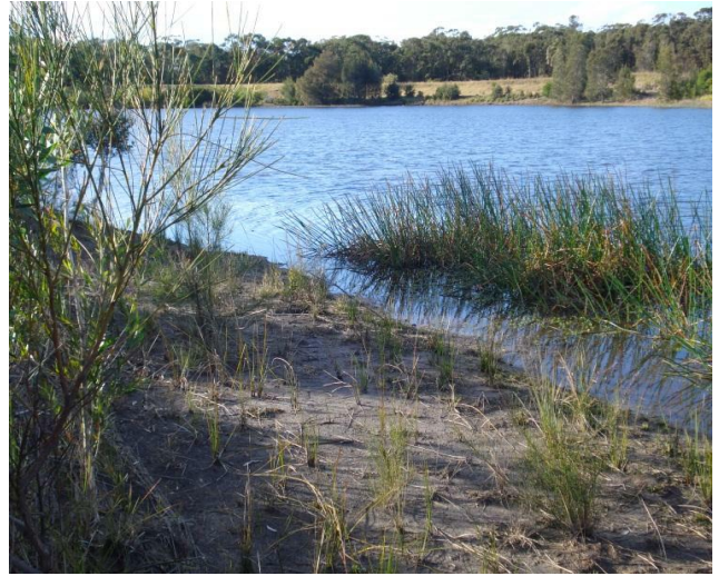
Waterbody looking south – July 2010