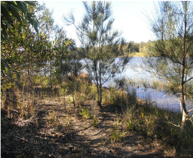
Waterbody looking South - July 2014