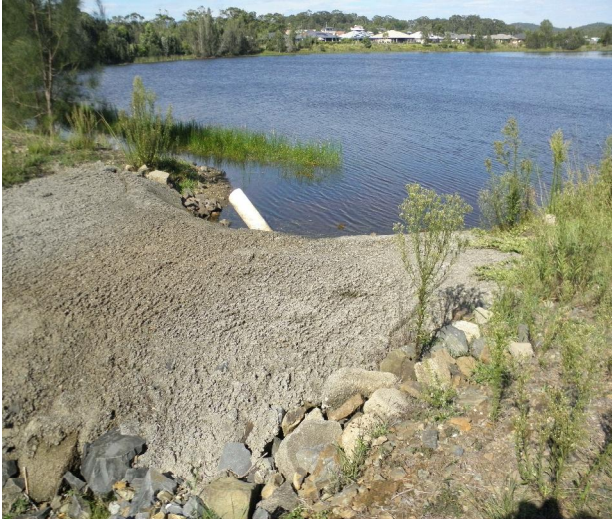
Waterbody looking south along edge – February 2014