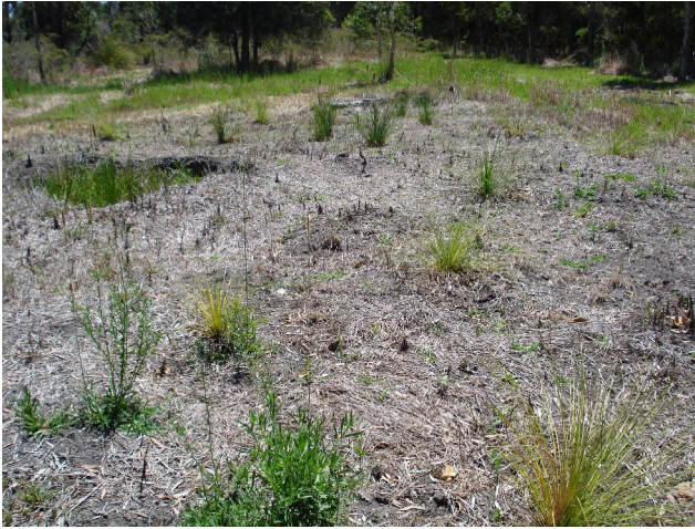
The Island Area also looking south - February 2009 (a)