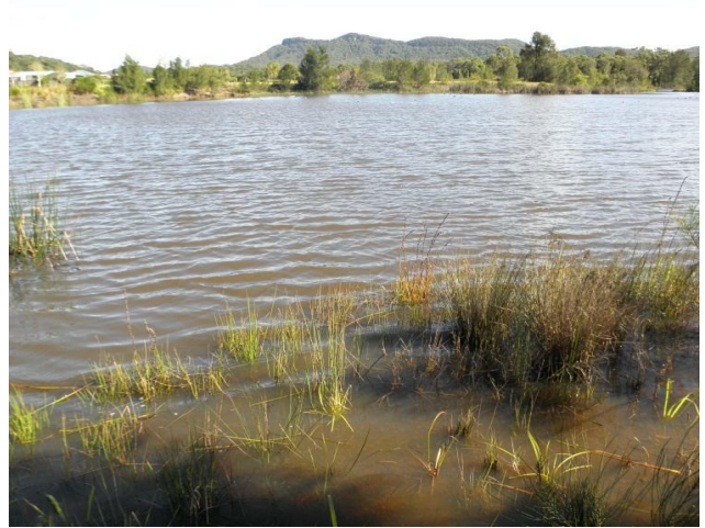
Waterbody looking west – July 2012