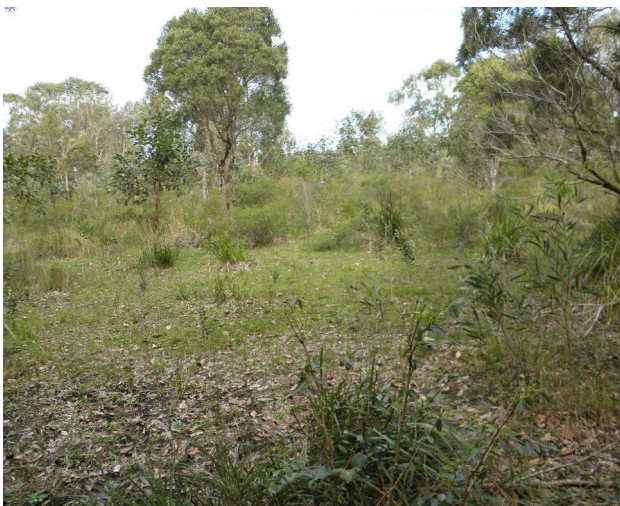
Central area looking south - July 2013