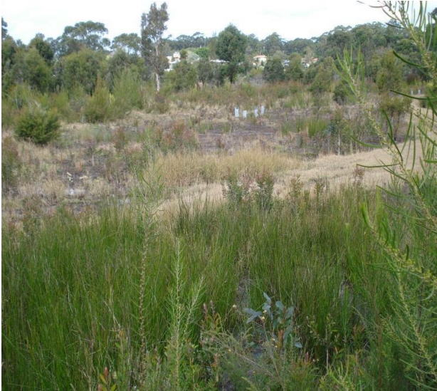
Central - Island area looking south – July 2010