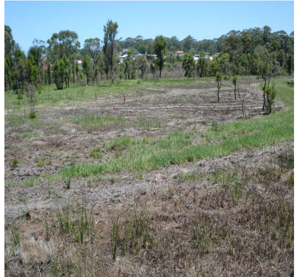
Central - Island area looking south – Feb