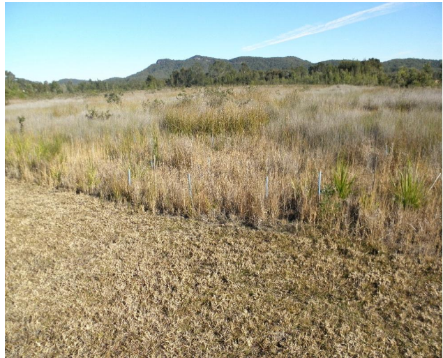
Wallum area looking West - July 2014