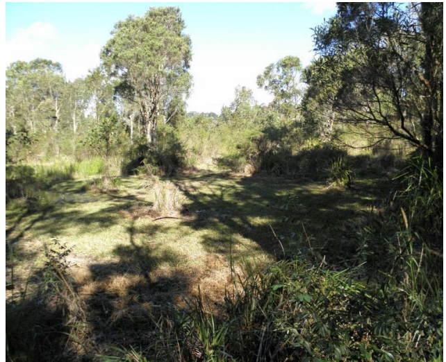
Central area looking south – July