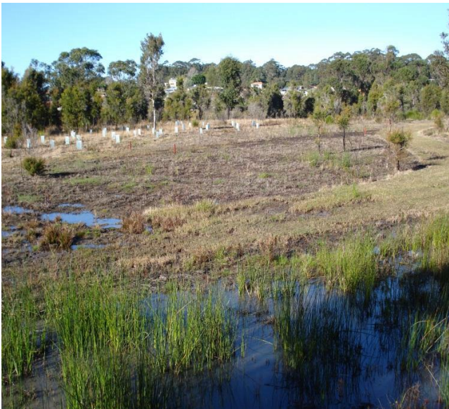
Central - Island area looking south – July 2009