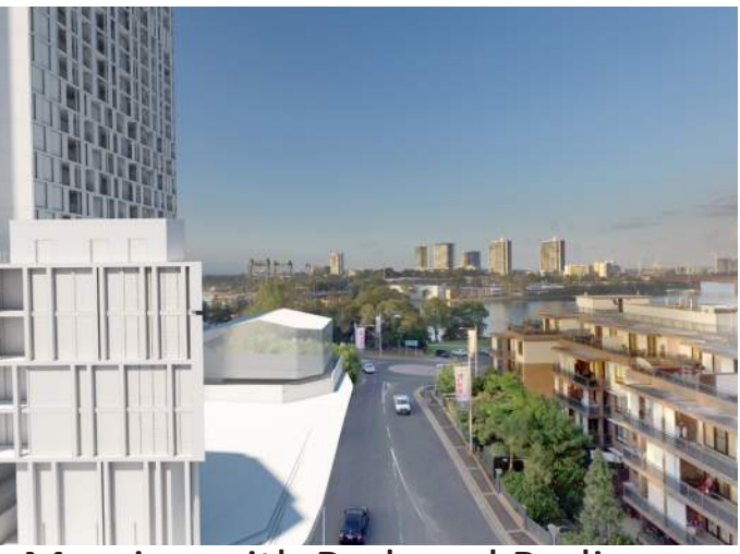
DA Massing with Reduced Podium