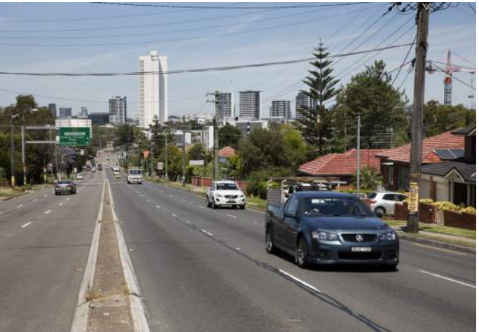
DA Massing with Reduced Podium