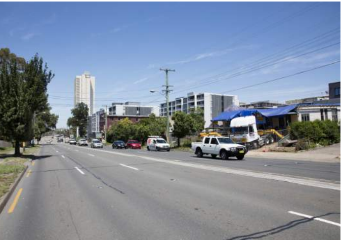
DA Massing with Reduced Podium