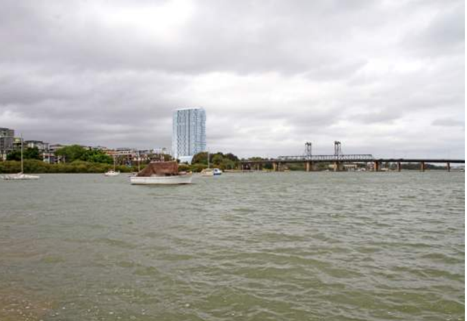
DA Massing with Reduced Podium