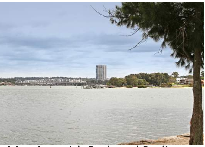
DA Massing with Reduced Podium