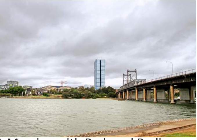
DA Massing with Reduced Podium