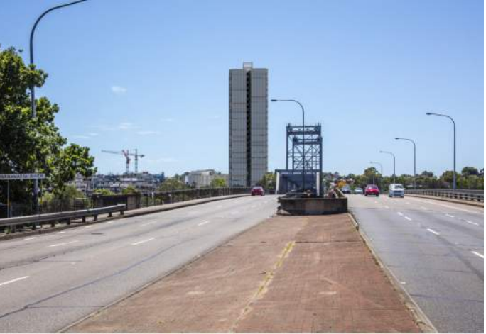
DA Massing with Reduced Podium