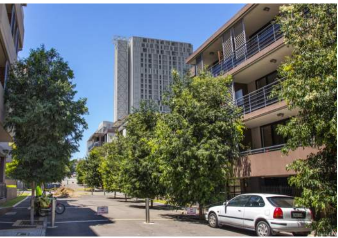
DA Massing with Reduced Podium