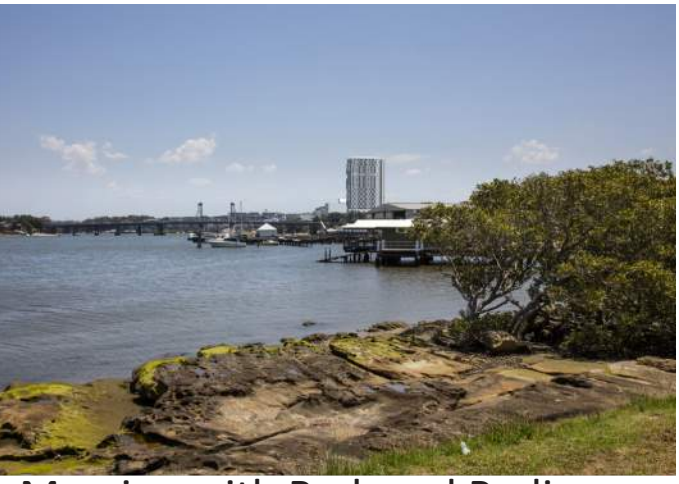
DA Massing with Reduced Podium