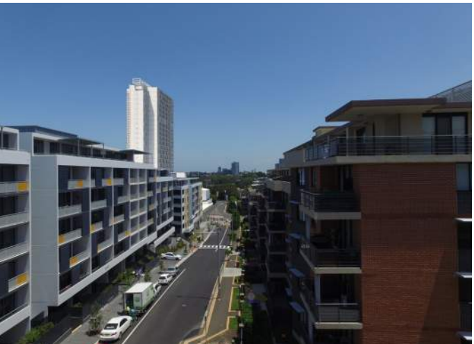
DA Massing with Reduced Podium