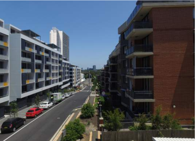
DA Massing with Reduced Podium