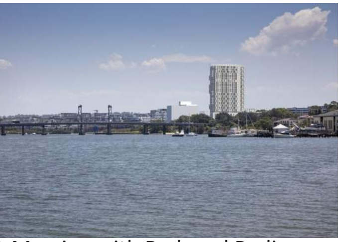
DA Massing with Reduced Podium