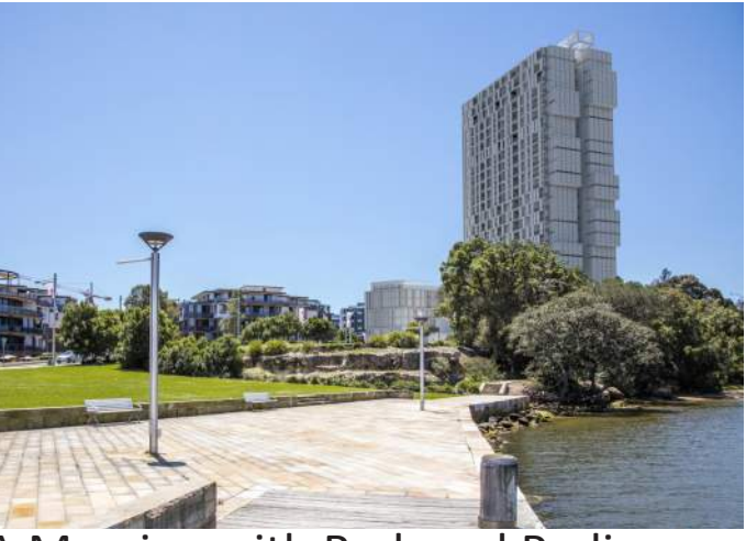
DA Massing with Reduced Podium