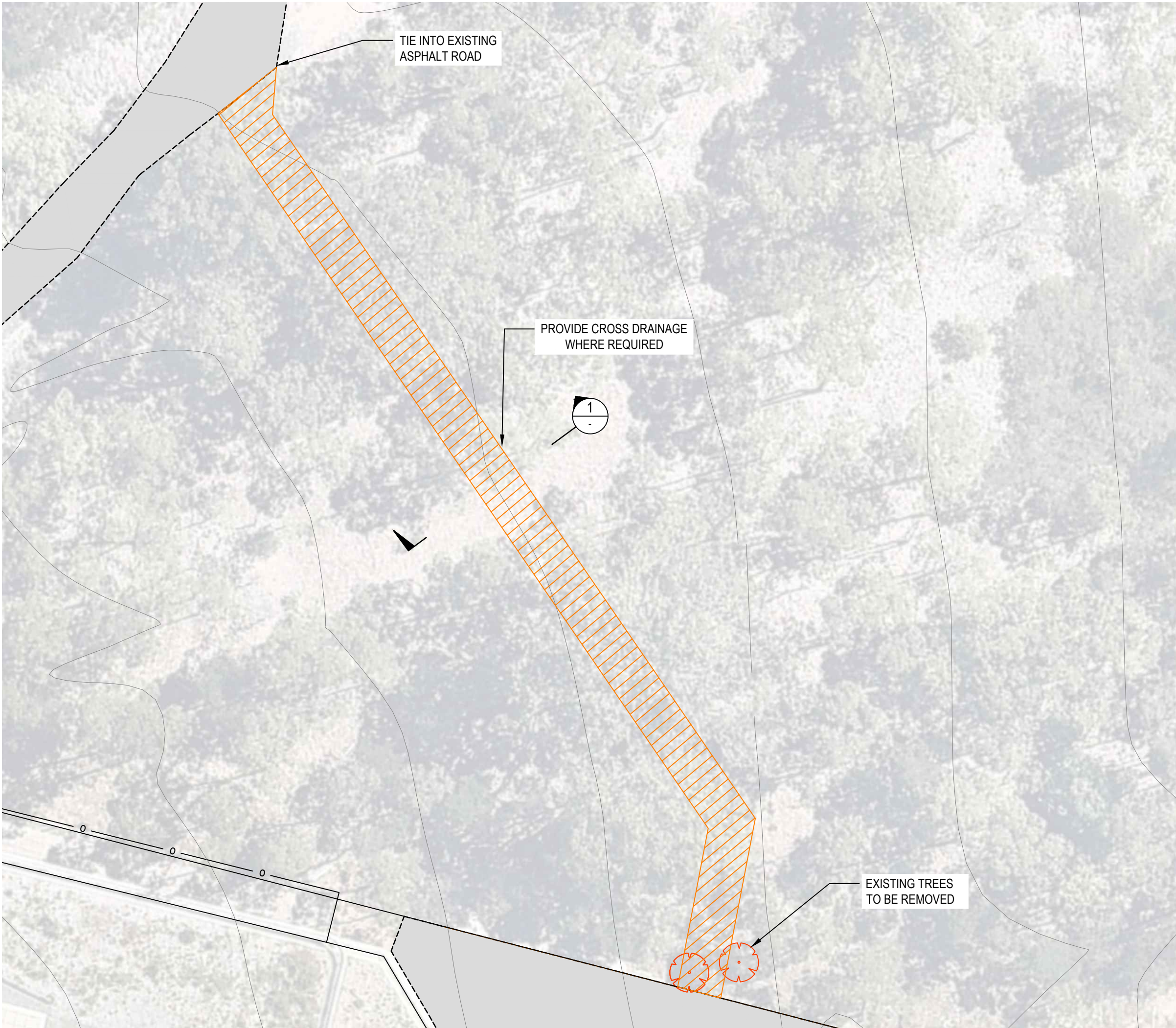
DETAIL 1 - PROPOSED ACCESS ROAD SCALE 1:250