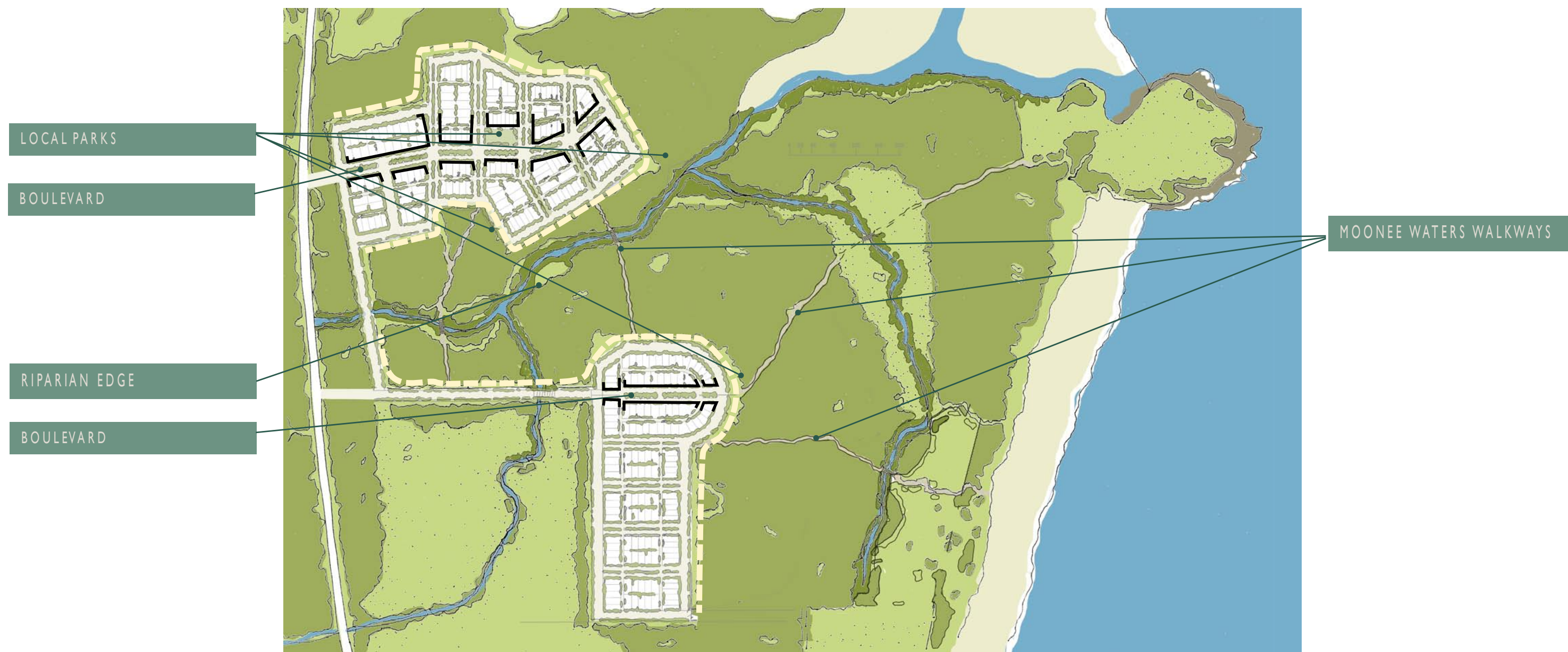
Fig 5-1: Special places location plan

Integral to the Concept Plan are a series of special places which form the highlights of the public domain. These are reference points in the evolving villages, providing both semi-urban and naturalistic settings for daily life and leisure.