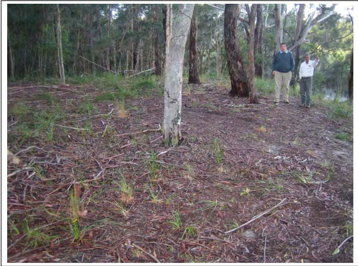
Overview of PAD 2 location. Photograph facing south.