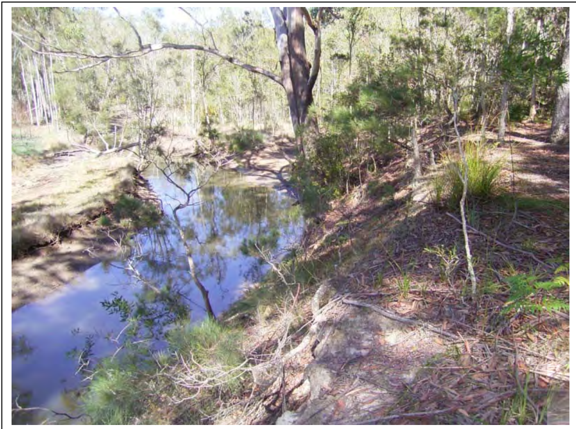
Overview of PAD 2 location. Photograph facing south, southwest.