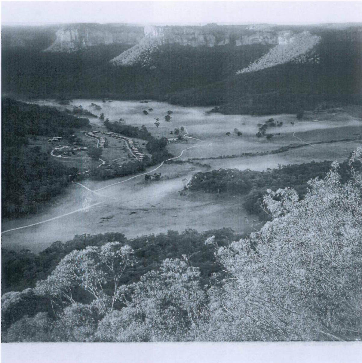
Figure 1. The resort precinct in Wolgan Valley.