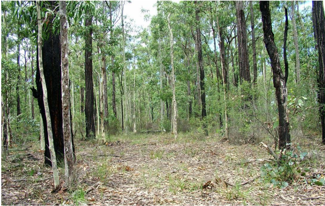
Plate P3: Transect 2, looking south. Note the dense Eucalypt vegetation and leaf litter within this transect.