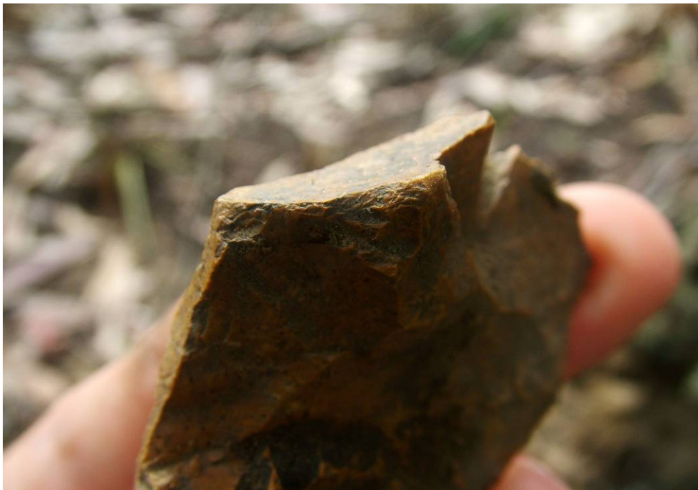
Plate P12: Silcrete core identified as Spine Road 1 - detail photograph of platform preparation.

Use or disclosure of data contained on this sheet is subject to the restriction on the distribution page of this document.