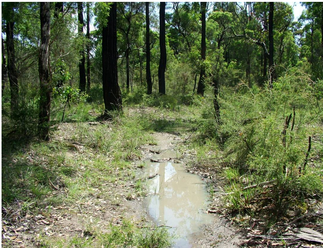
Plate P8: Transect 4, looking west. This photograph shows one of the poorly defined creeks located in the HEZ, and the dense vegetation in this area.

Use or disclosure of data contained on this sheet is subject to the restriction on the distribution page of this document.