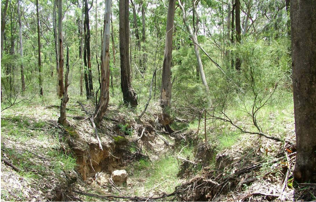
Plate P5: Transect 3, looking north. This photograph shows one of the poorly defined creek lines within Precinct 1. The depth of this creek has been intensified by modifications to the drainage from the Spine Road to the south.