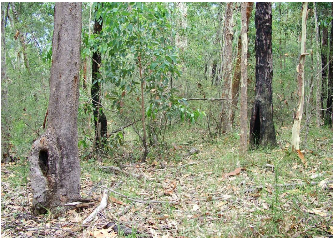
Plate P4: Transect 2, looking south

Use or disclosure of data contained on this sheet is subject to the restriction on the distribution page of this document.