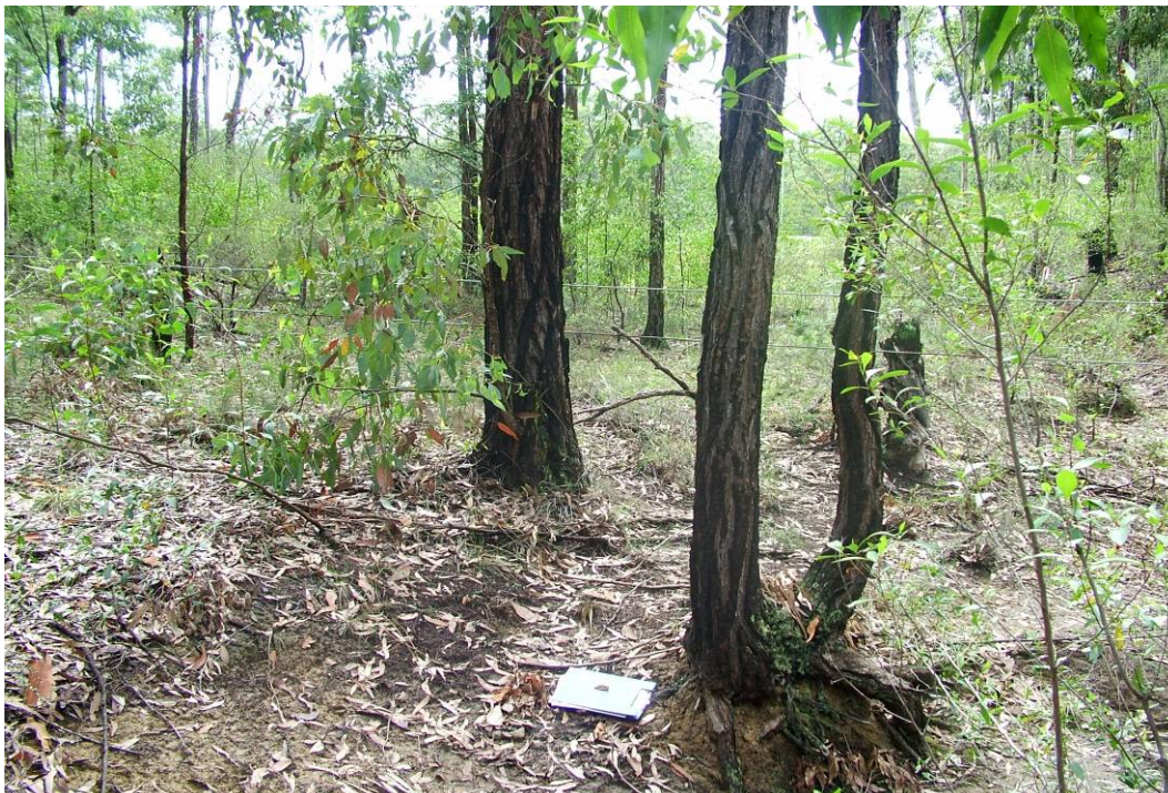
Plate P10: Spine Road 1, looking east. The object was located on the edge of a drainage line, which is visible to the right of the photograph. The Spine Road is just visible behind the trees.