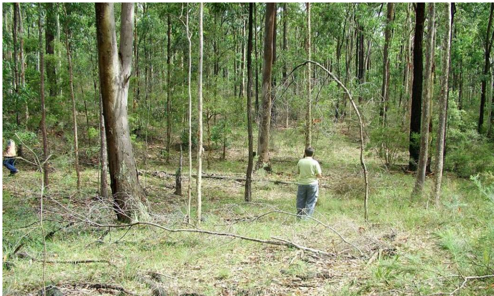
Plate P2: Transect 1, looking east. The two Aboriginal representatives are located on either side of one of the drainage lines within Precinct 1. Note the lack of a defined creek in this area.