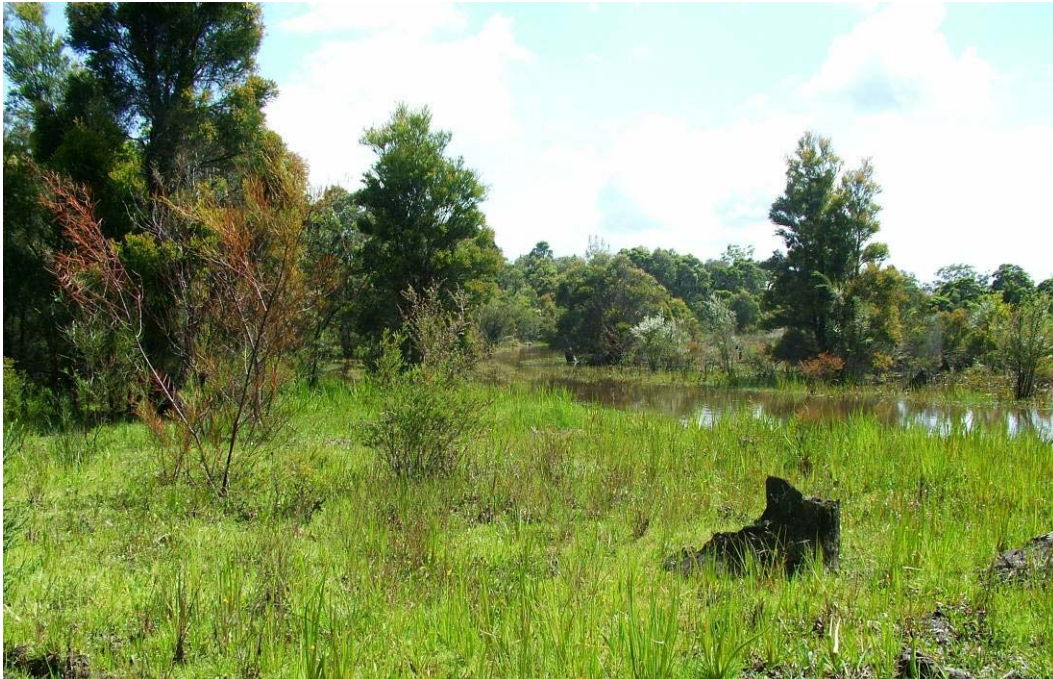
Plate P7: Transect 4, looking north. This photograph shows the wetlands and vegetation coverage located just east of the proposed Pelaw Main Bypass.