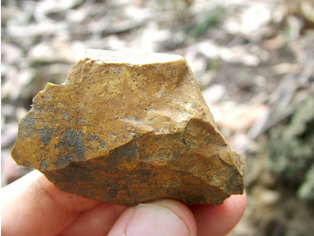
Plate P13: Silcrete core identified as Spine Road 1 - detail photograph of dorsal scar on core.