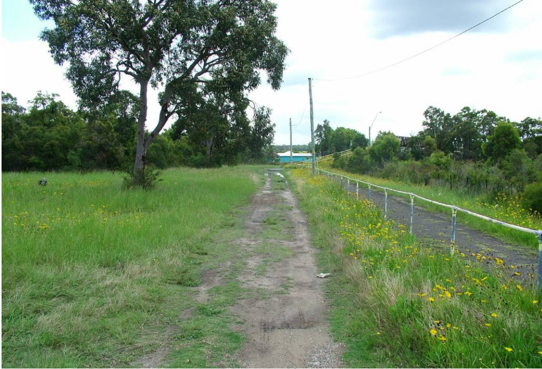
Plate P9: Transect 5, looking north towards the railway line.