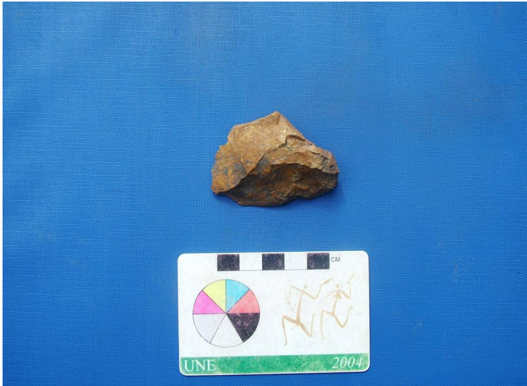
Plate P11: A silcrete core identified as Spine Road 1.