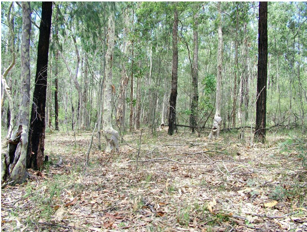
Plate P6: Transect 3, looking north.