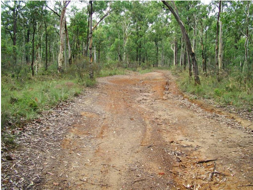
Plate P1: Transect 1, looking south. Note the shallow duplex soils to the right of the photograph, the exposed geological clays in the centre of the photograph, and the dense Eucalypt woodland encompassing the transect.