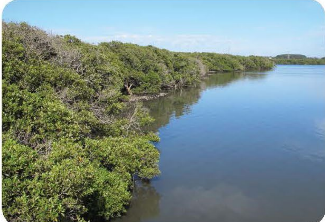
Retain existing mangroves