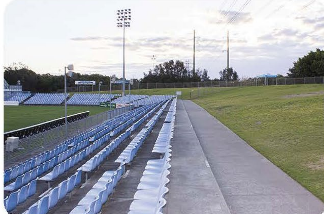
The Southern Cross Group Stadium