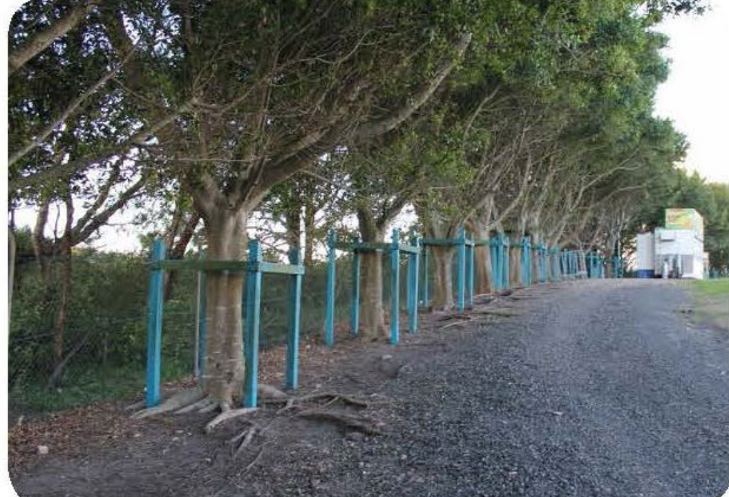
Existing trees along Family Hill