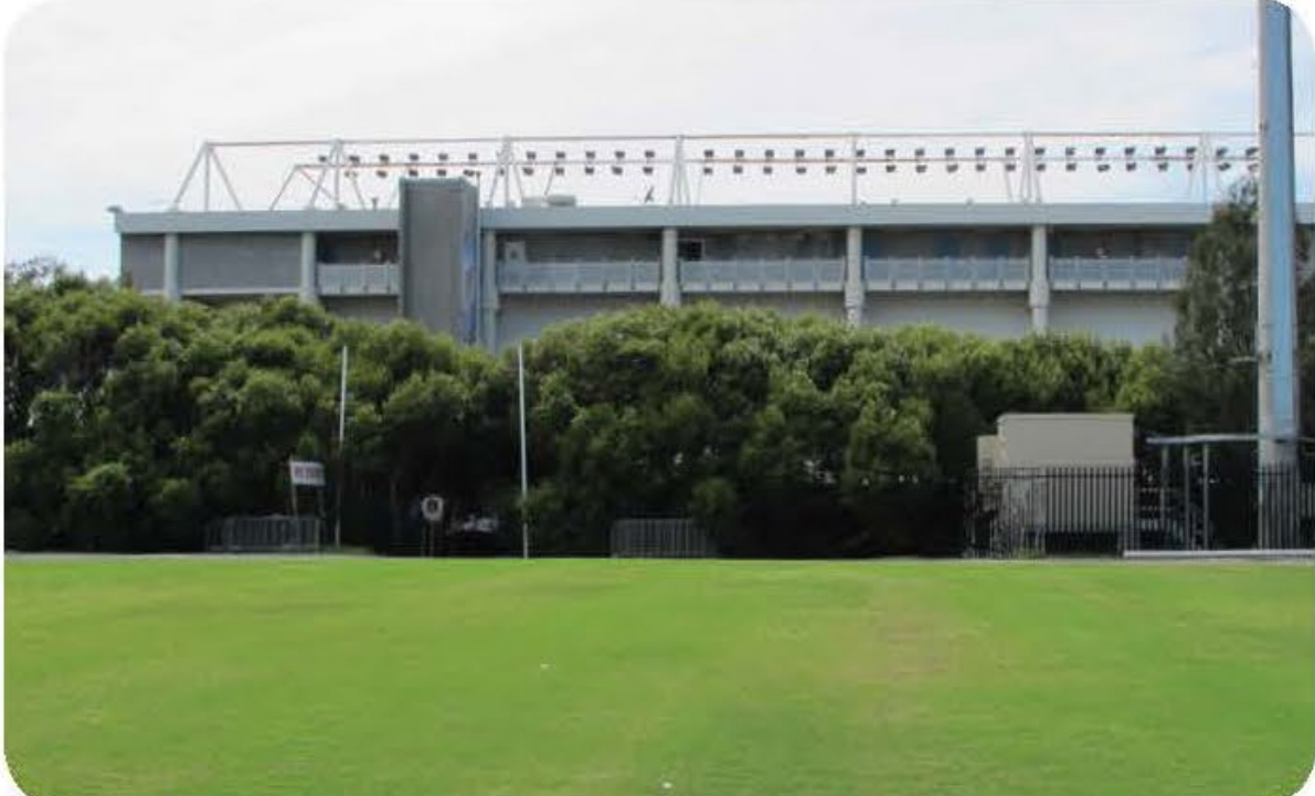
Western playing fields and drainage channel