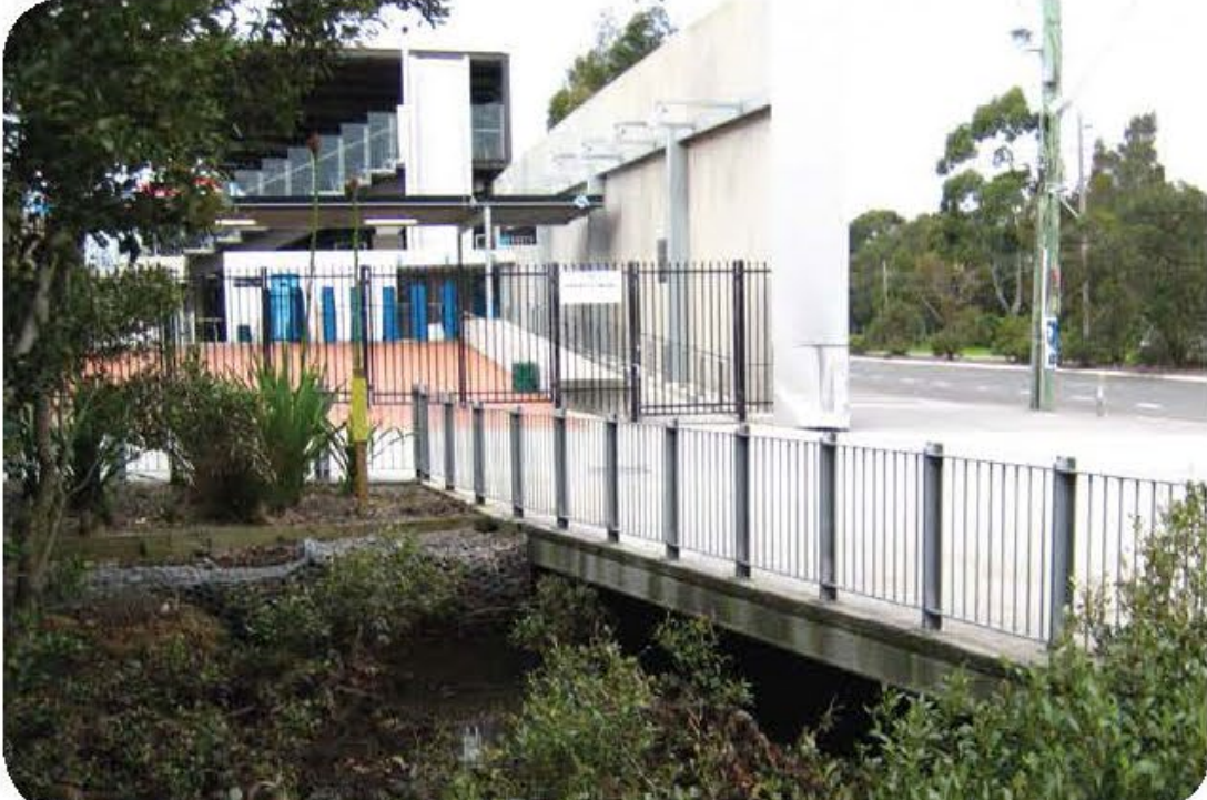
Existing mangrove water course