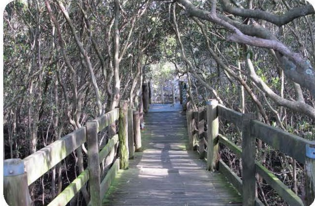
Existing mangrove boardwalk