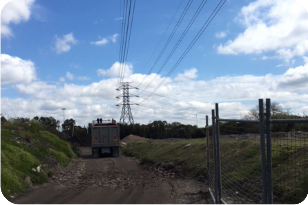
Existing power lines