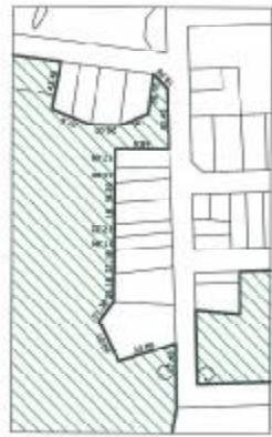
DETAIL 'A' SCALE @ A1 1:2500 SCALE @ A3 1:5000