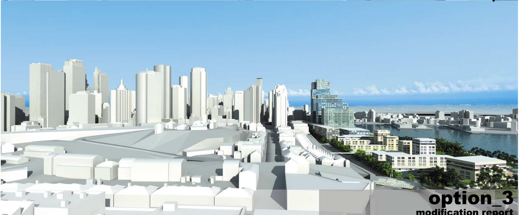
option_3 modification report