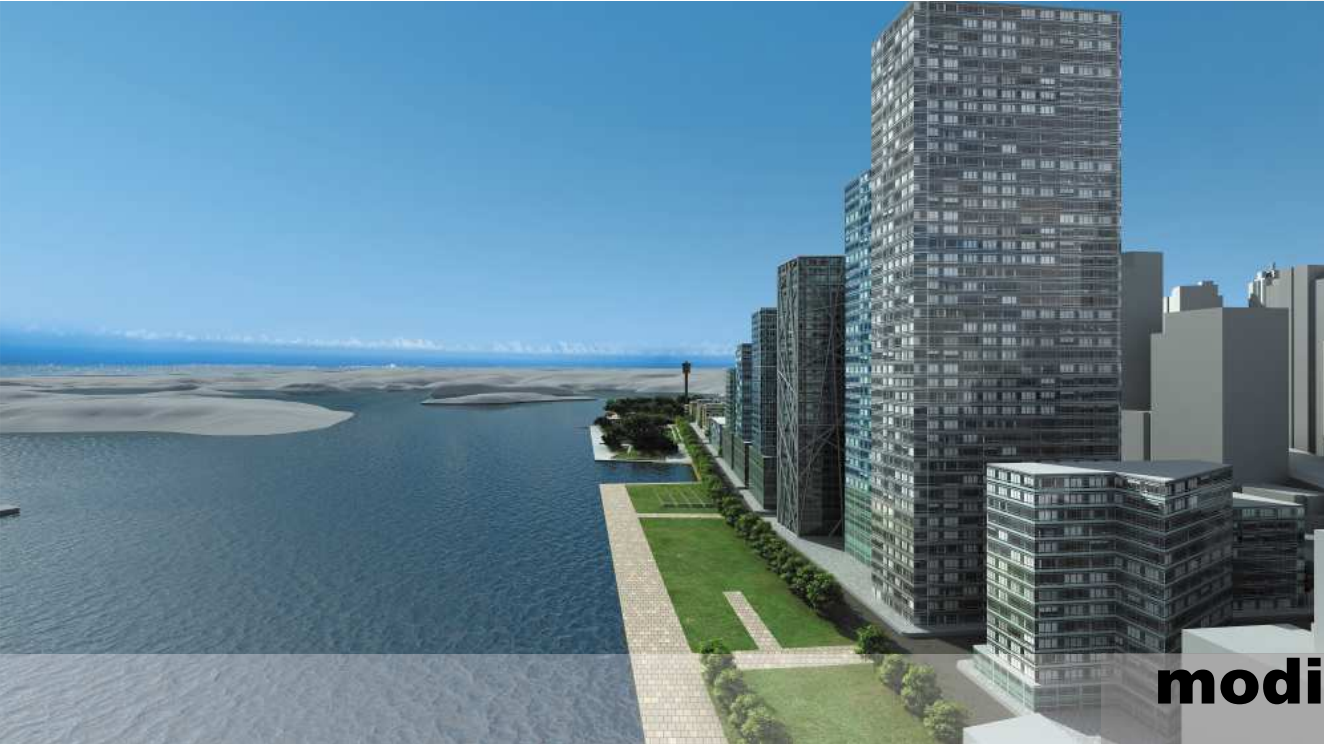
modified option_3 alternate floor space