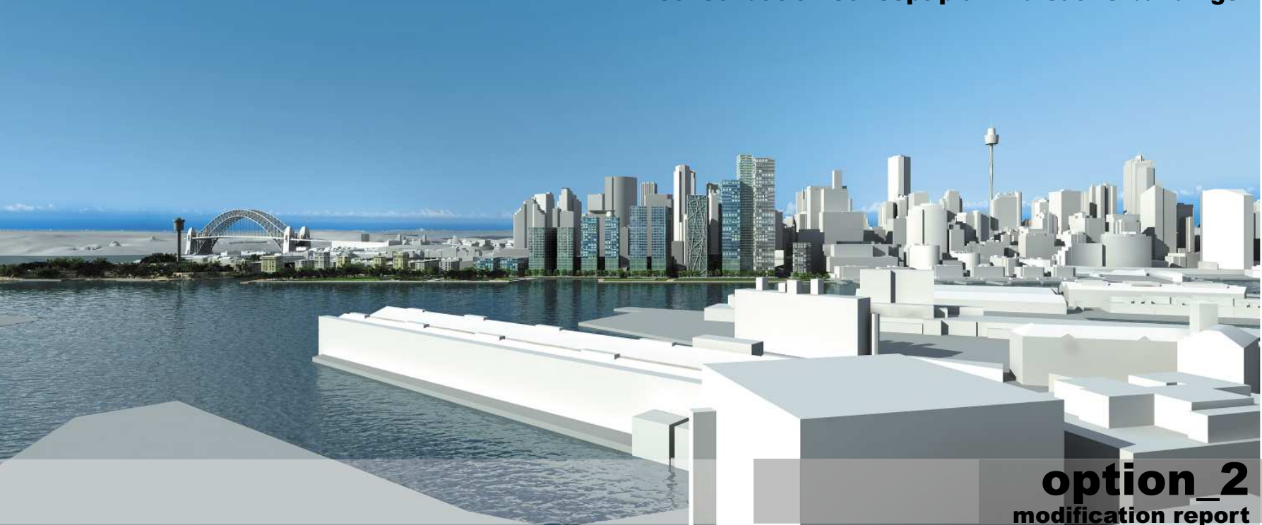
option_2 modification report