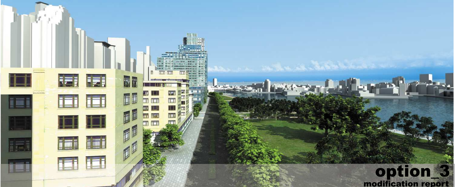
option_3 modification report