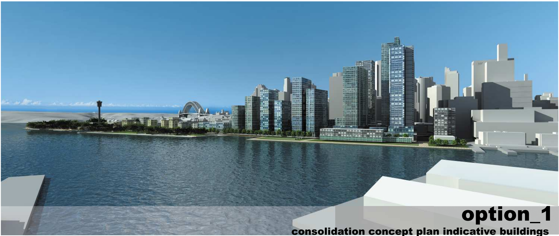
option_1 consolidation concept plan indicative buildings