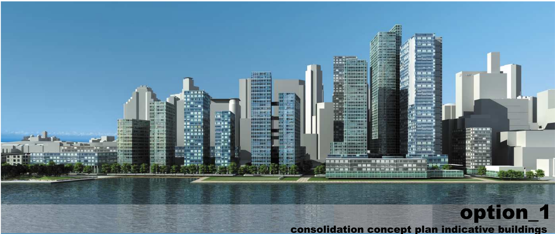
option_1 consolidation concept plan indicative buildings