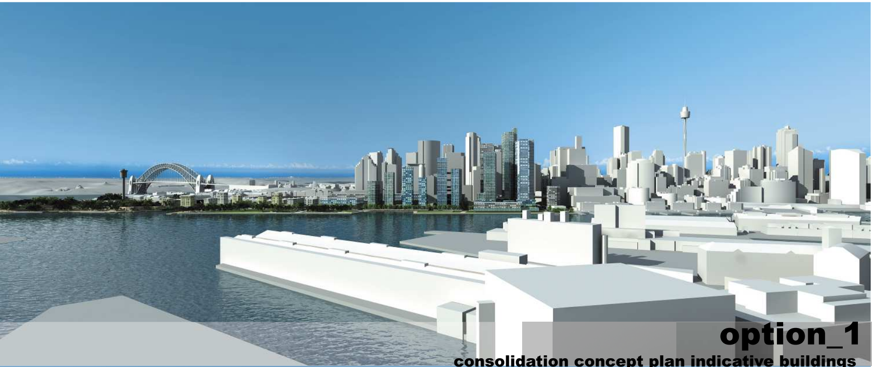
option_1 consolidation concept plan indicative buildings