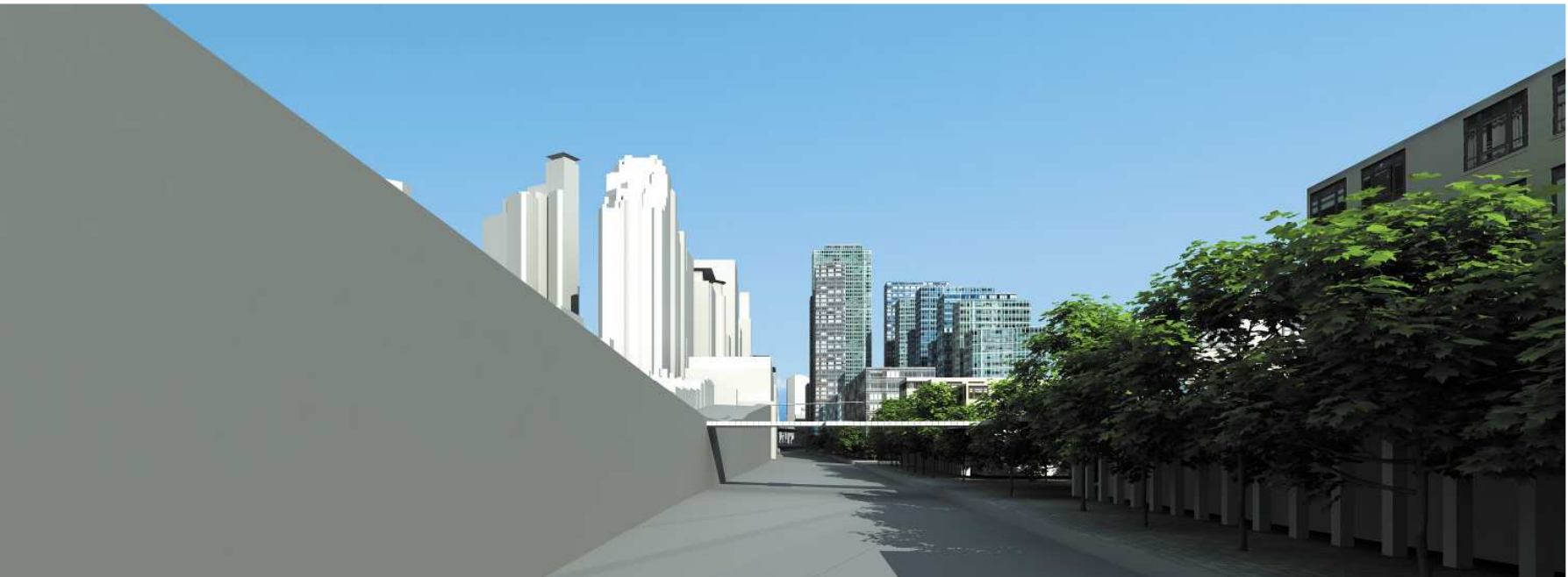
option_1 consolidation concept plan indicative buildings