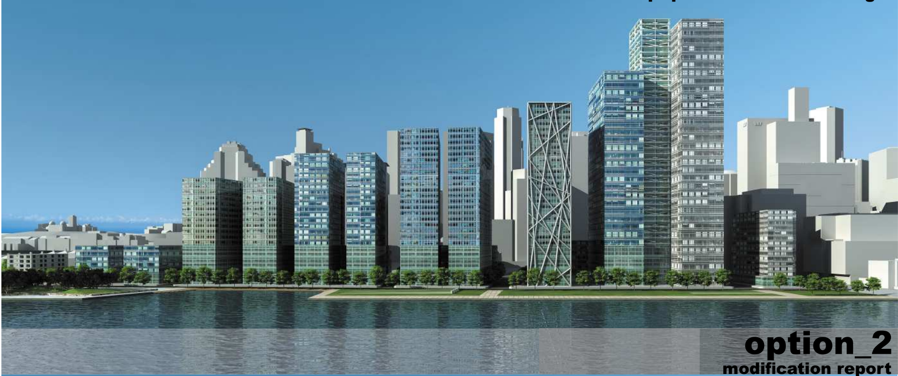
option_2 modification report