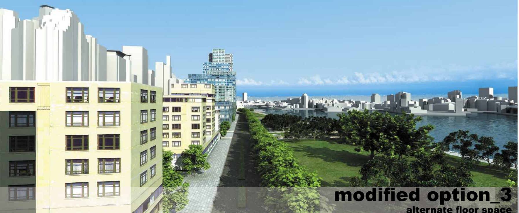
modified option_3 alternate floor space