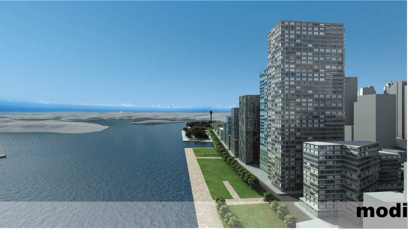
modified option_3 alternate floor space