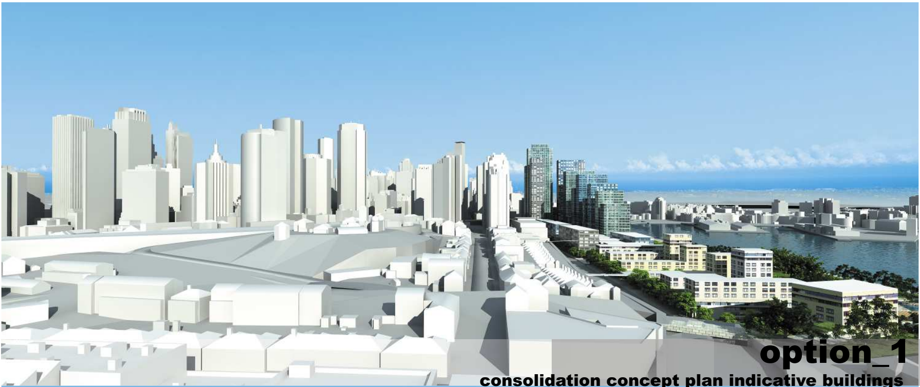
option_1 consolidation concept plan indicative buildings