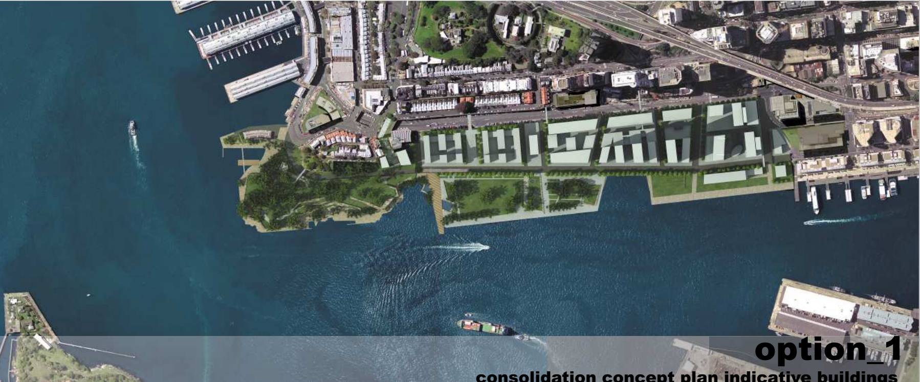
option_1 consolidation concept plan indicative buildings