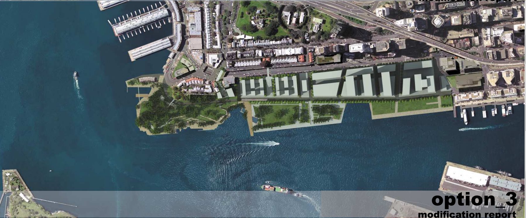
option_3 modification report