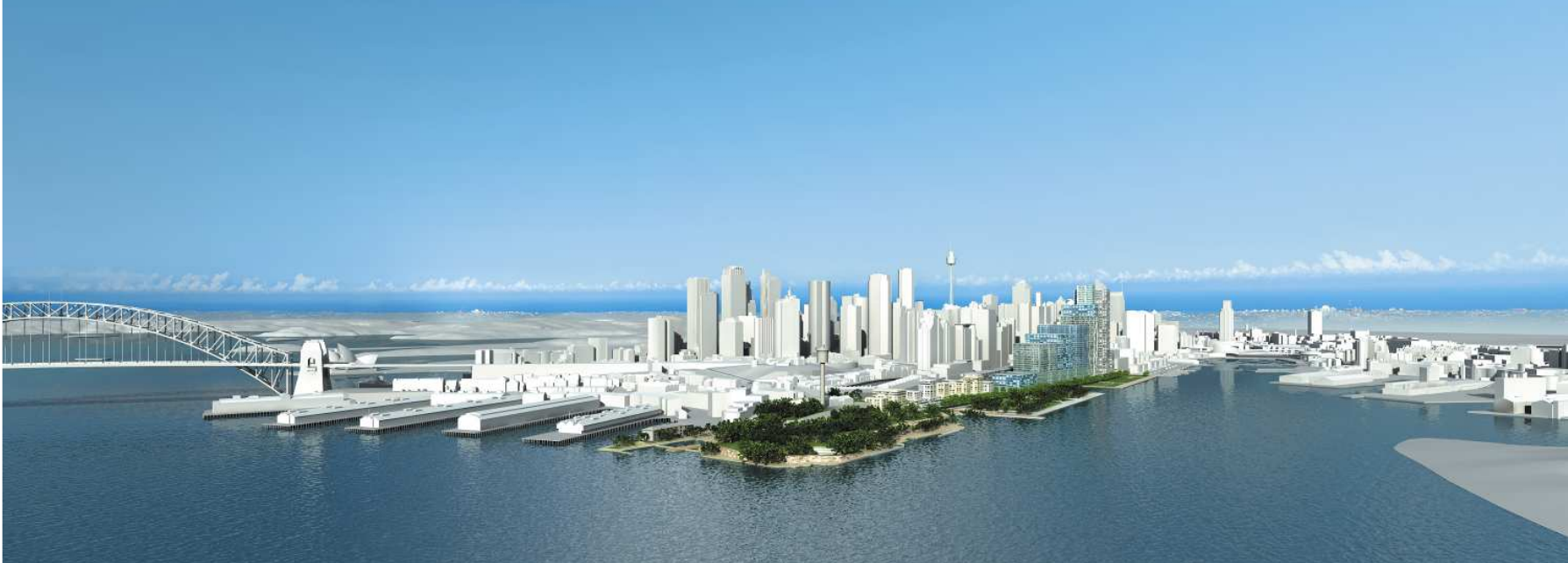
option_2 modification report