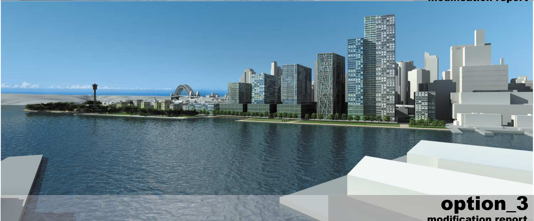
option_3 modification report