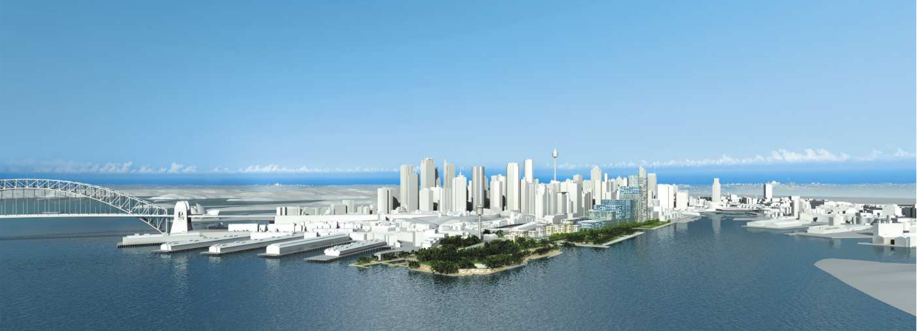
modified option_3 alternate floor space