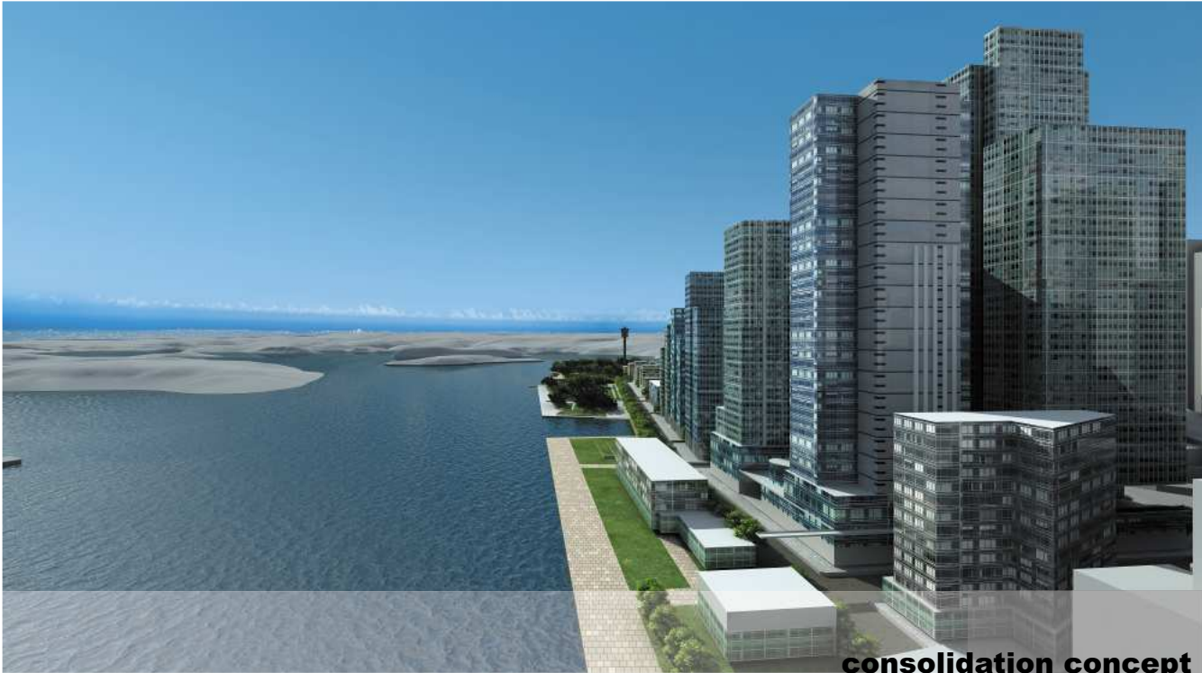
option_1 consolidation concept plan indicative buildings