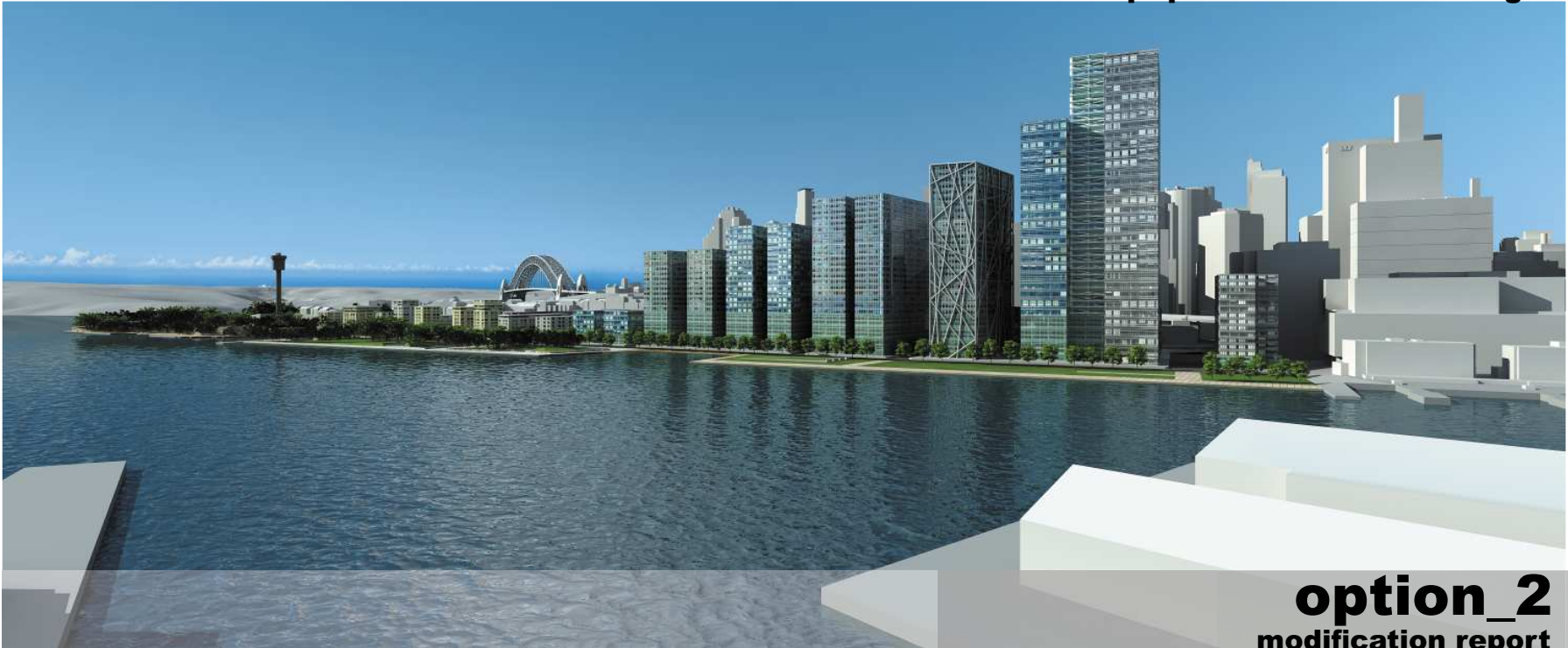
option_2 modification report