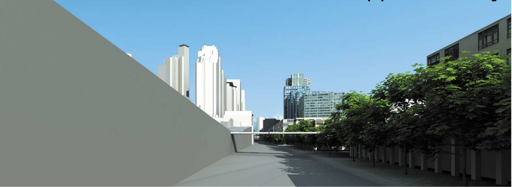
option_2 modification report