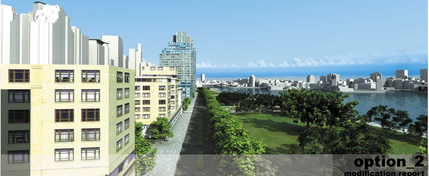
option_2 modification report