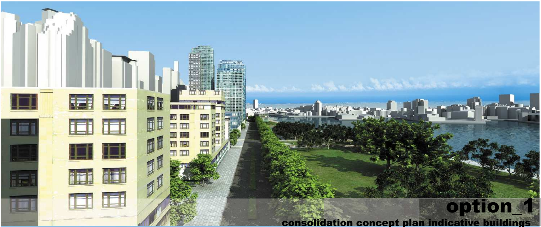
option_1 consolidation concept plan indicative buildings