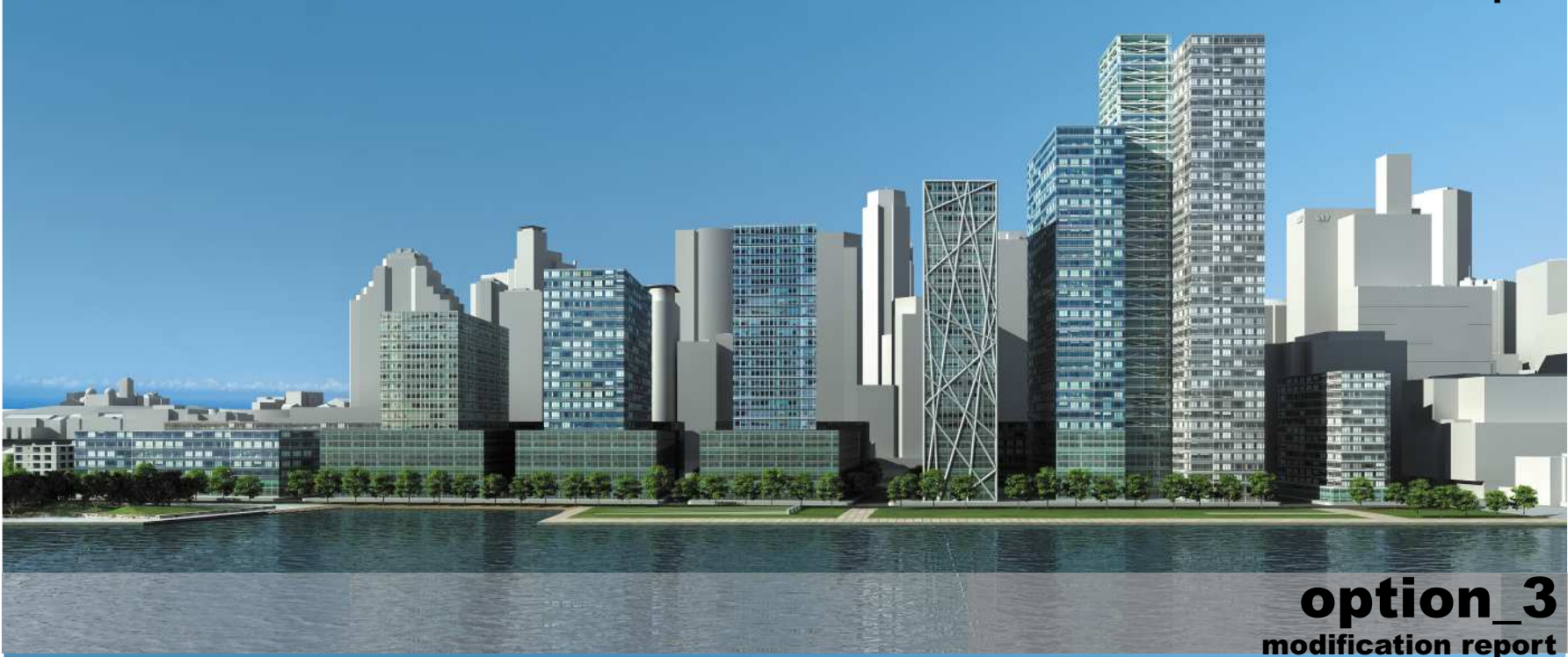
option_3 modification report