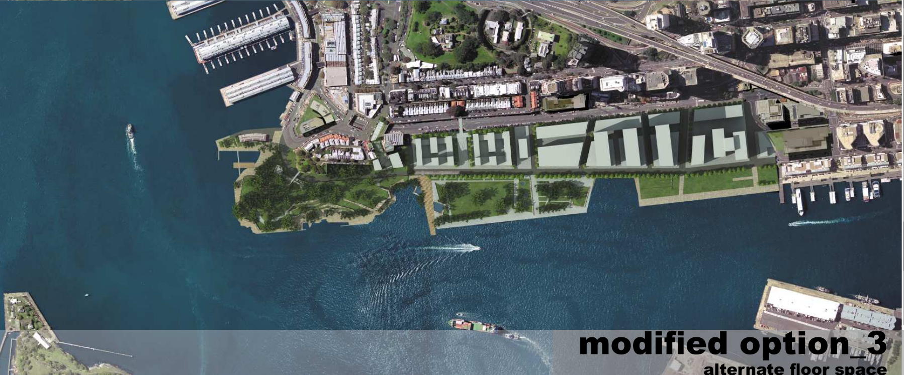
modified option_3 alternate floor space