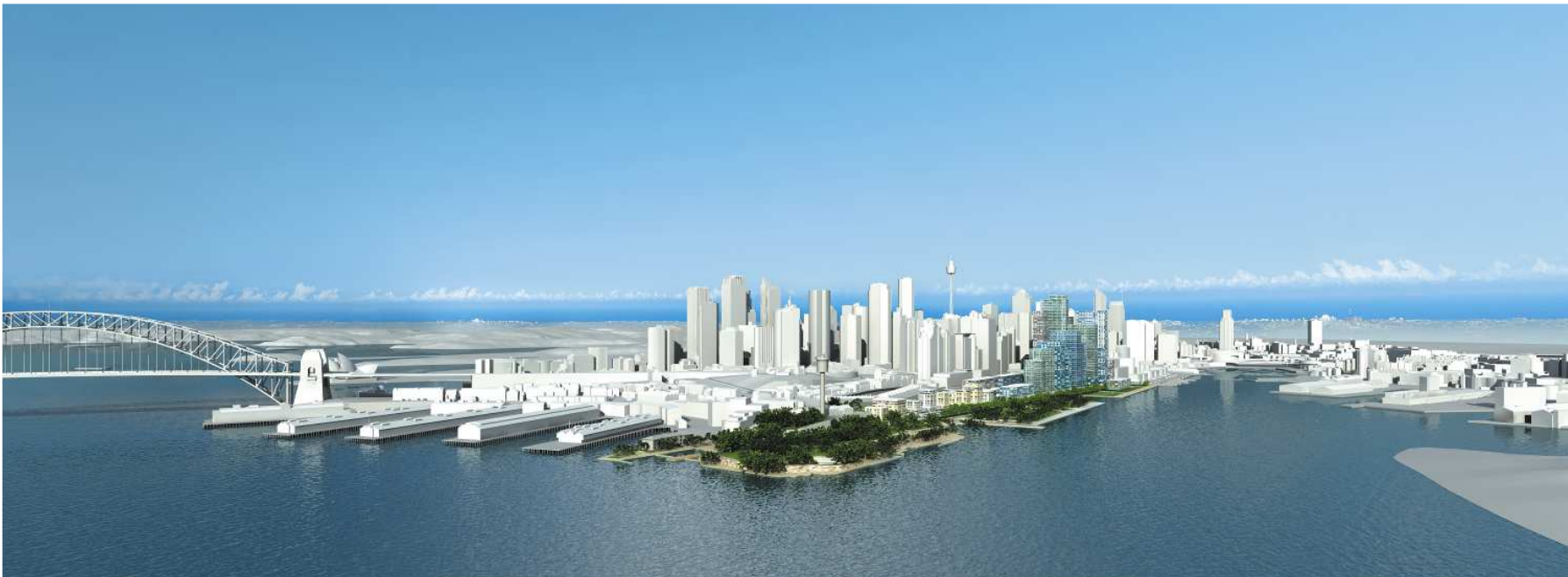
option_1 consolidation concept plan indicative buildings