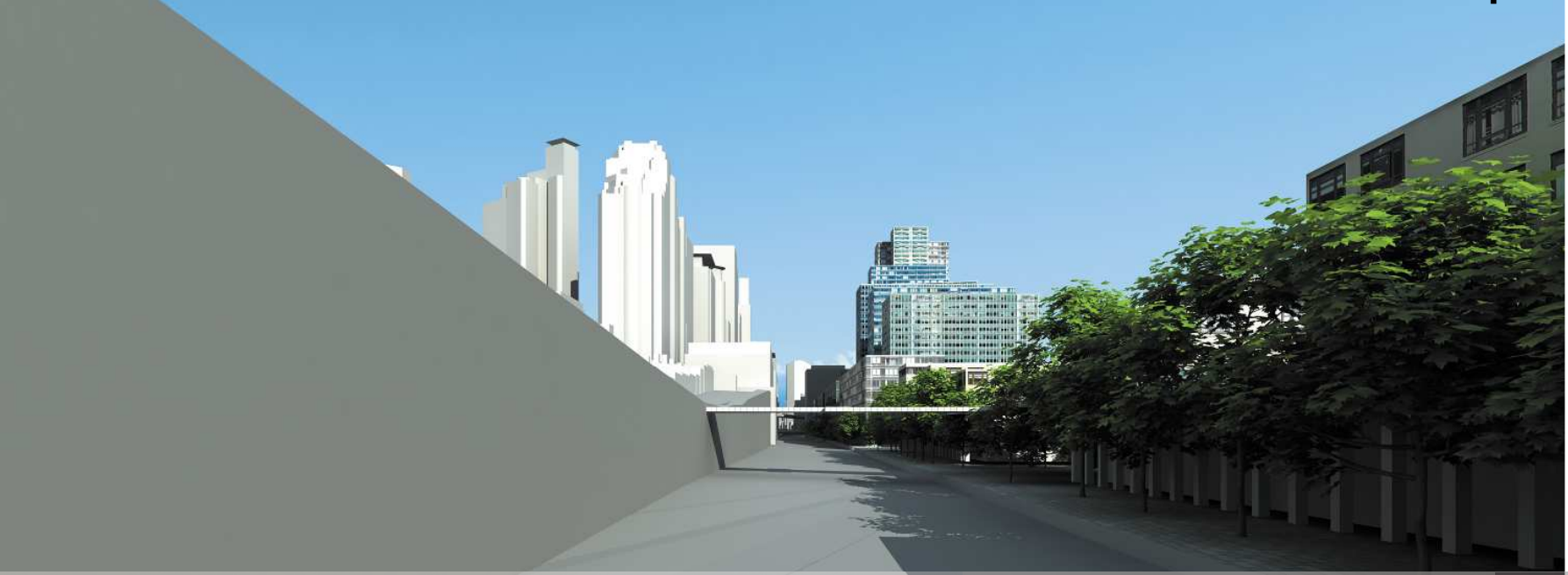
option_3 modification report