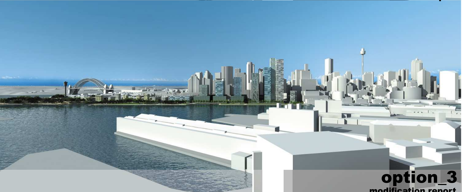
option_3 modification report