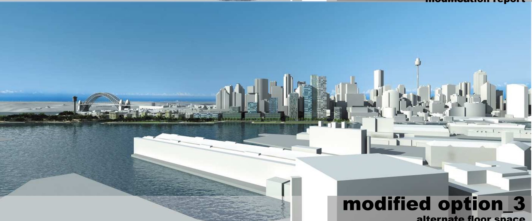
modified option_3 alternate floor space