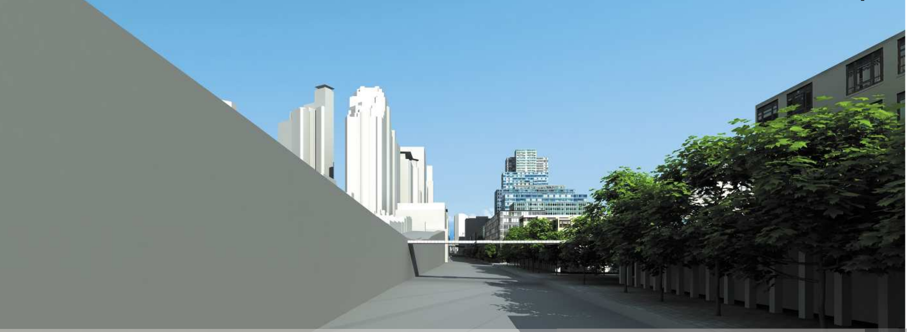
modified option_3 alternate floor space