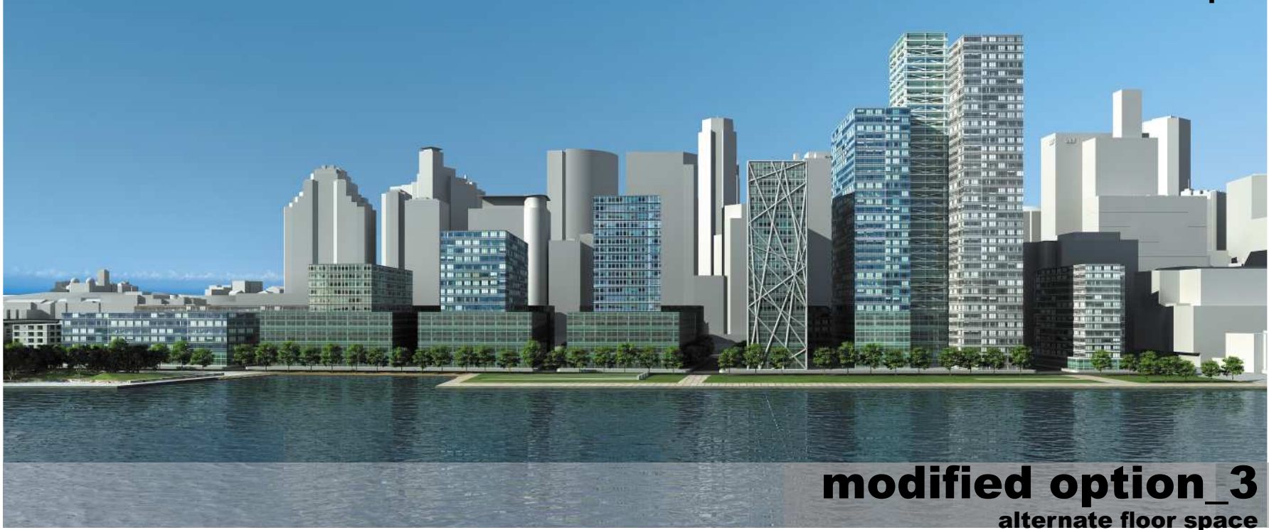
modified option_3 alternate floor space