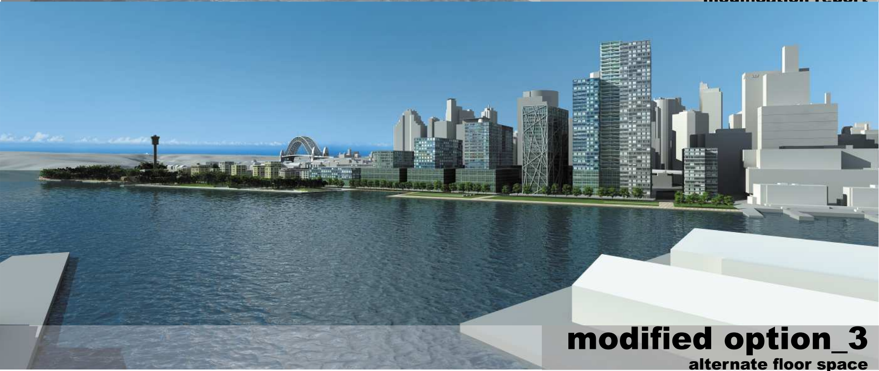
modified option_3 alternate floor space