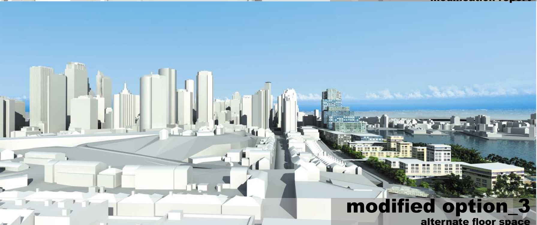
modified option_3 alternate floor space