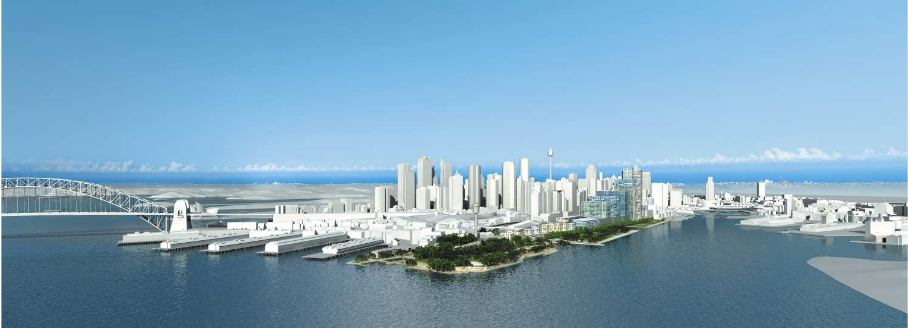
option_3 modification report