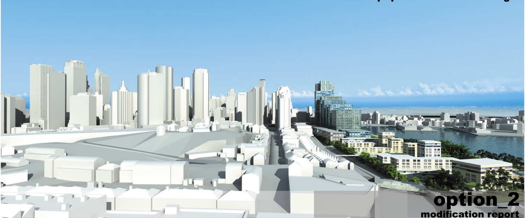
option_2 modification report