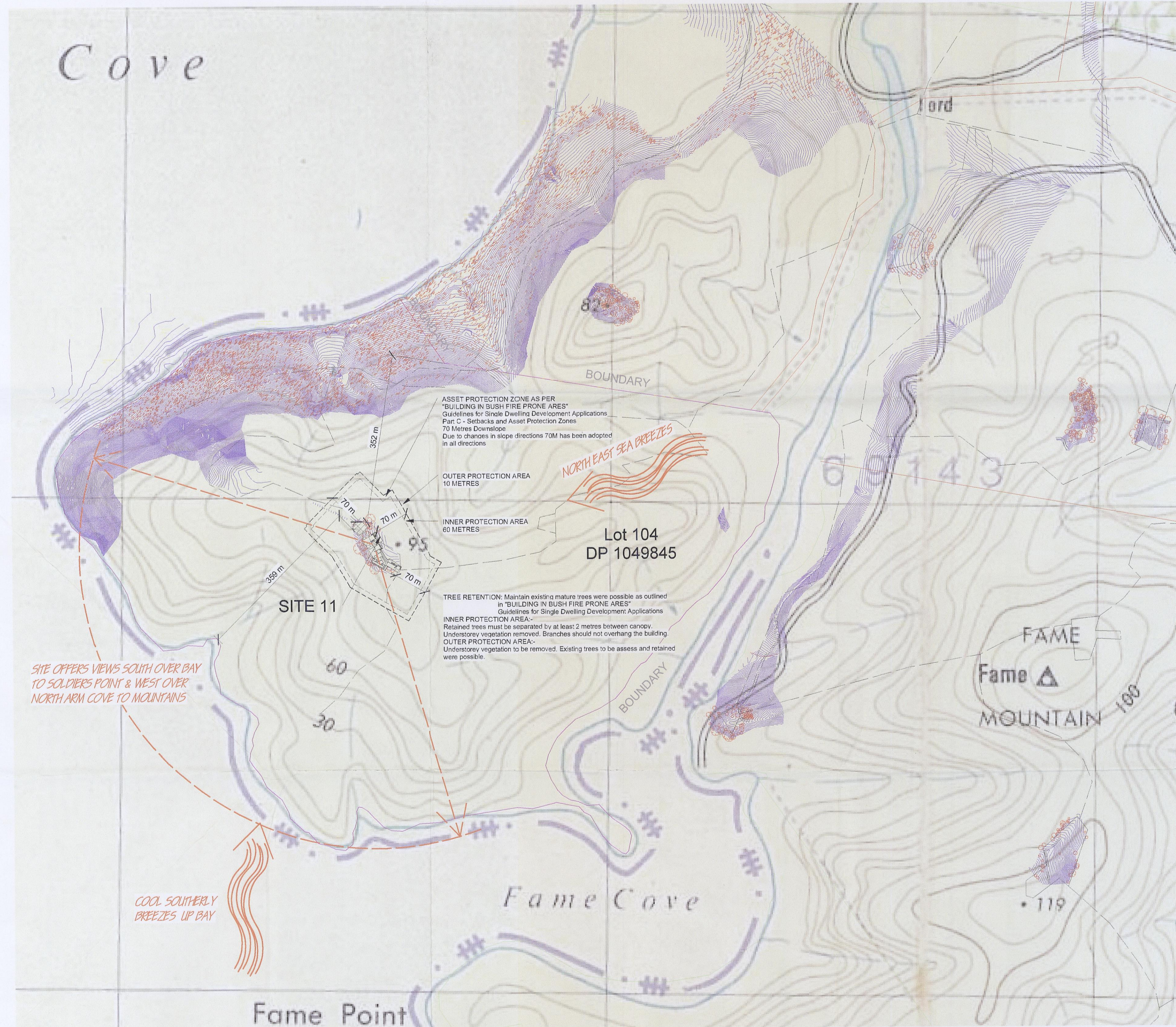
SITE & SITE ANALYSIS PLAN