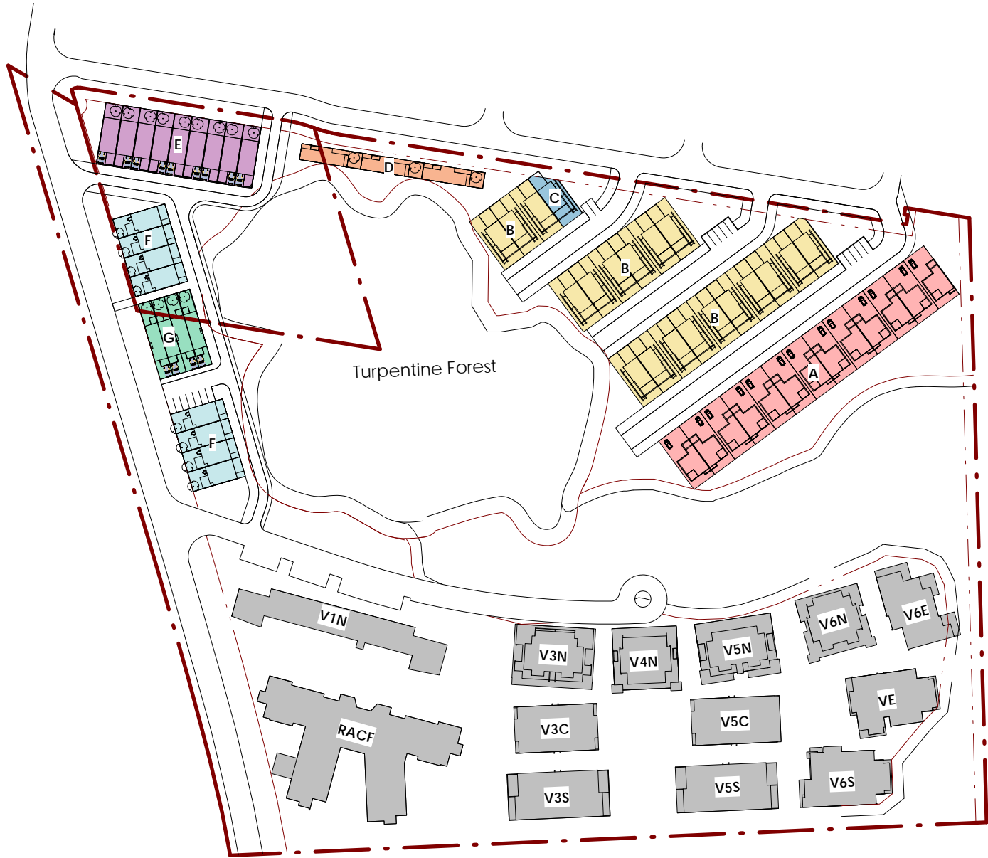
BLOCK PLAN Indicative layout only