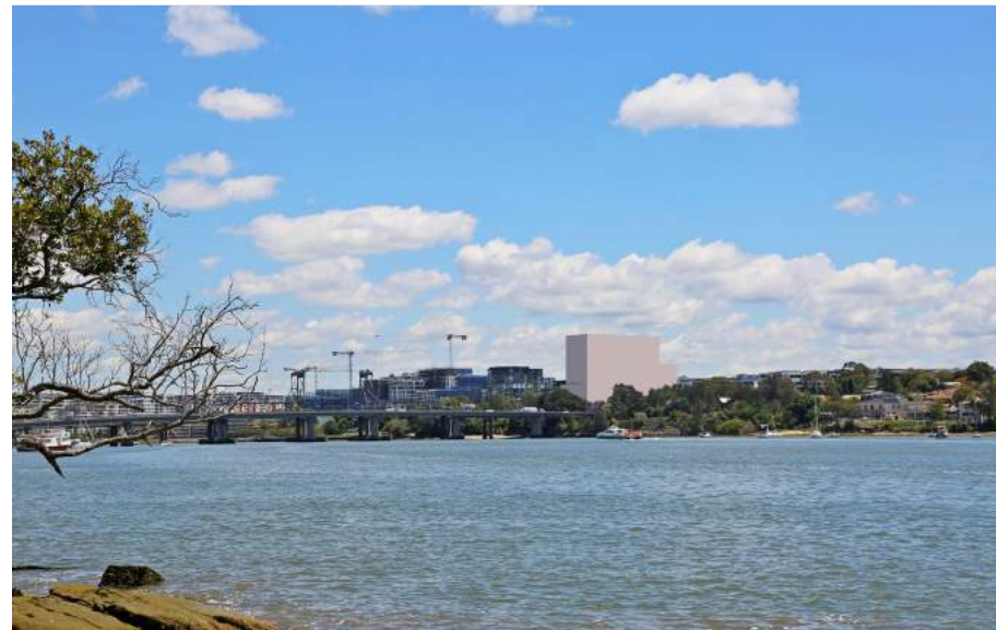
MOD 2 - Approved envelope