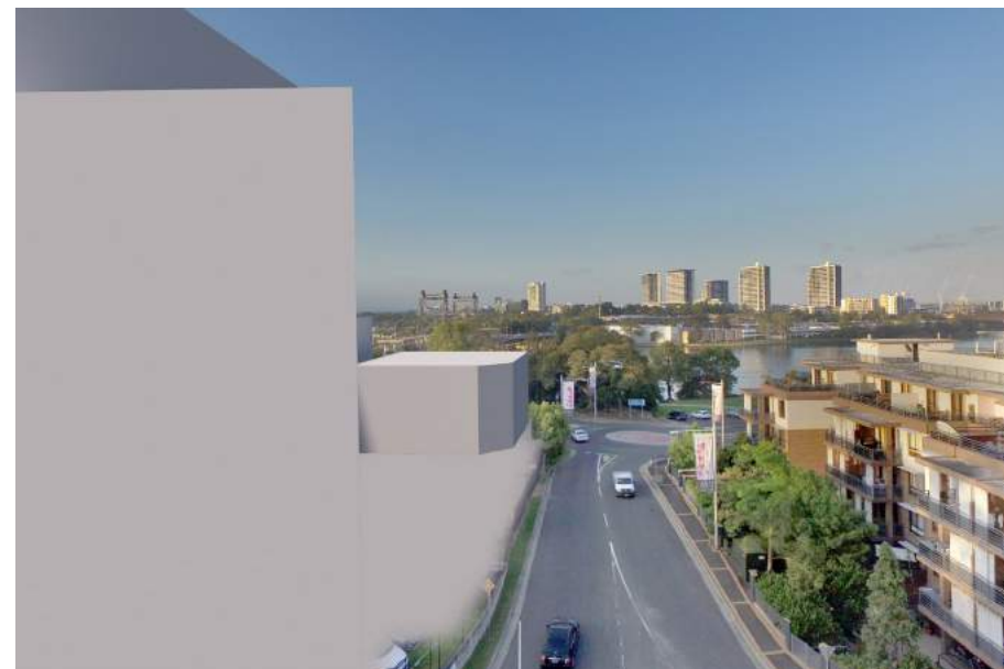
MOD 2 - Approved envelope