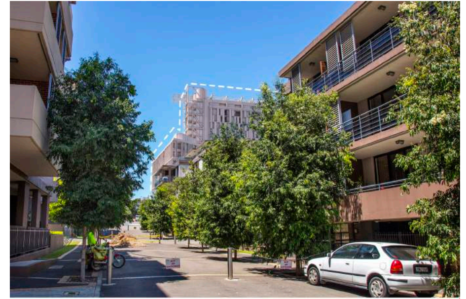
S75W Envelope & DA Massing