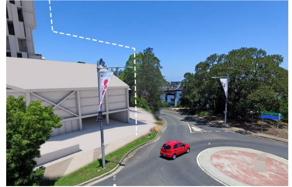
S75W Envelope & DA Massing