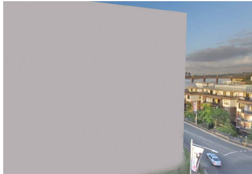
MOD 2 - Approved envelope