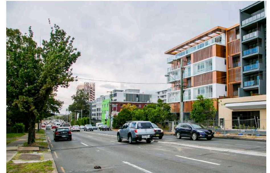
S75W Envelope & DA Massing