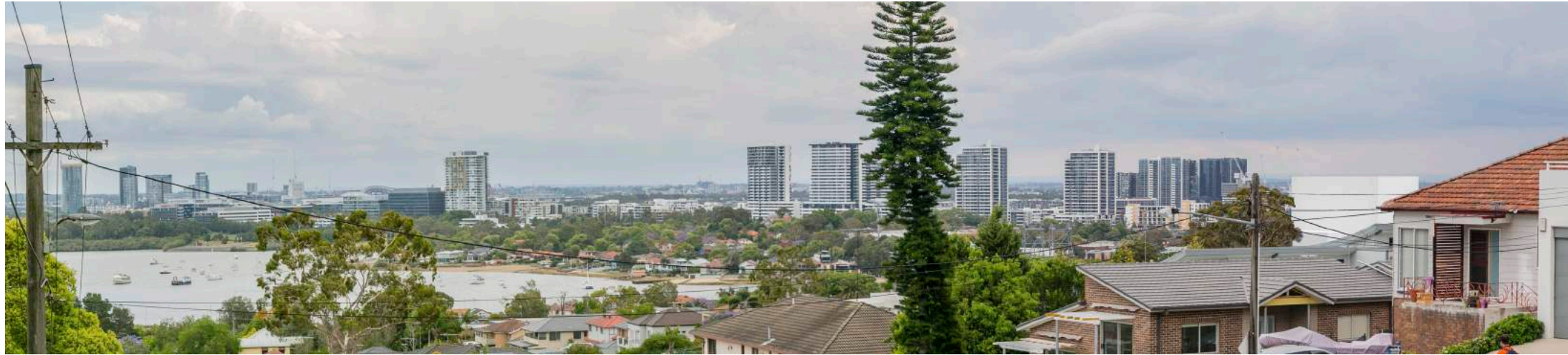
MOD 1 – Approved envelope