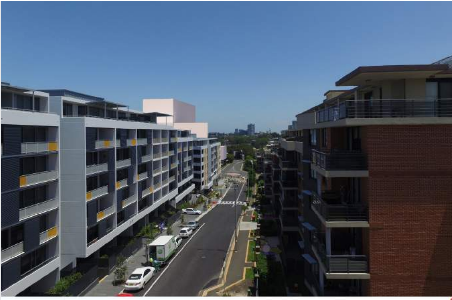
MOD 2 - Approved envelope