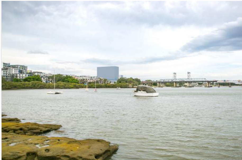
MOD 1 – Approved envelope