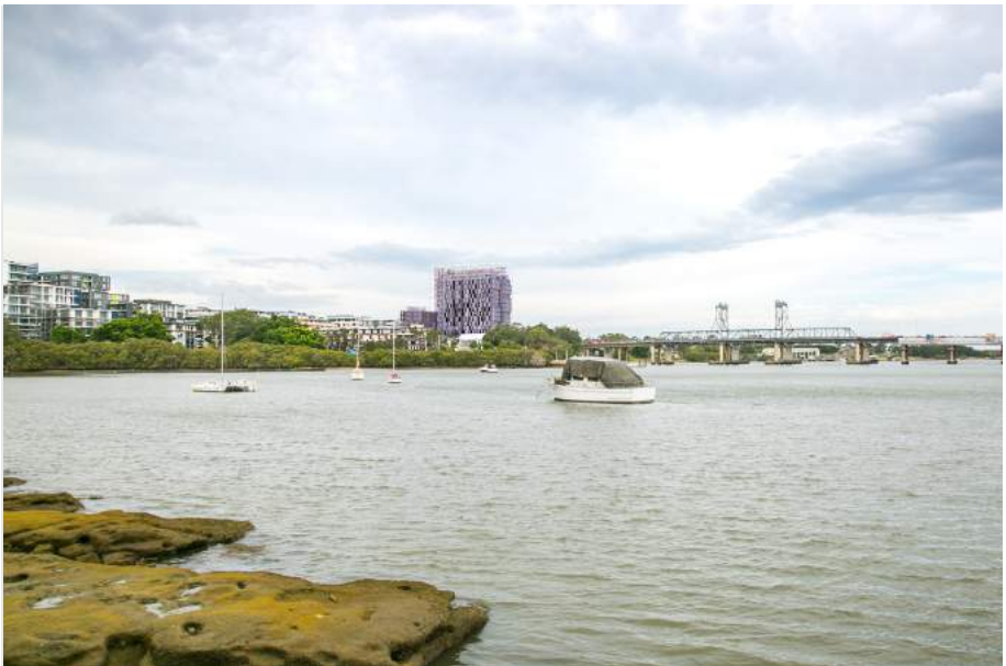
S75W Envelope & DA Massing