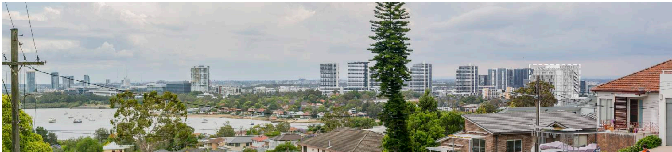
S75W Envelope & DA Massing