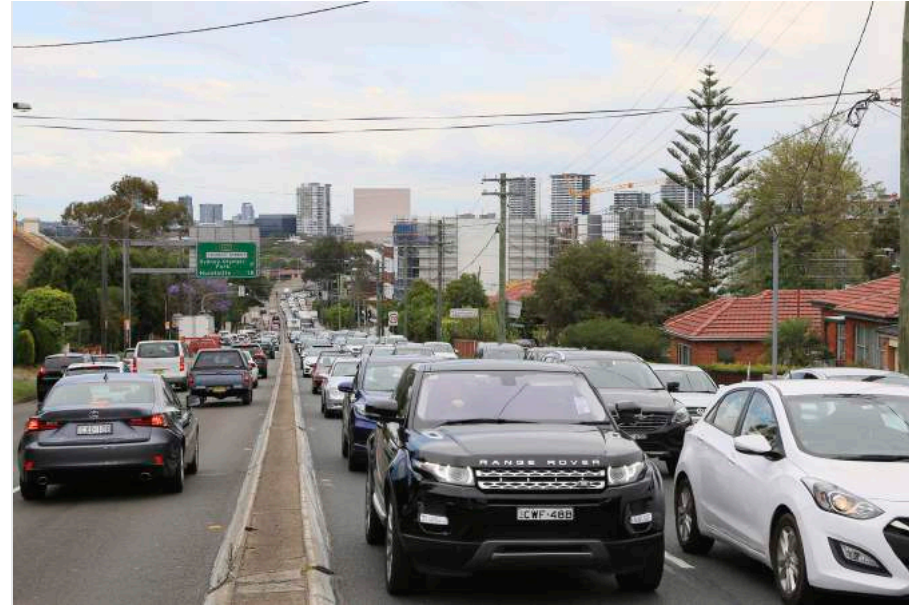
MOD 2 - Approved envelope