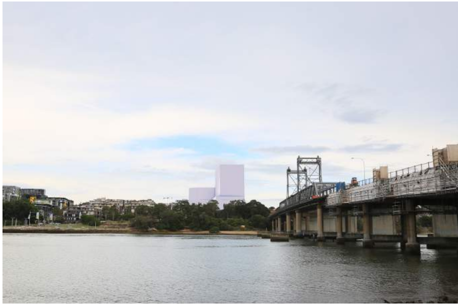
MOD 2 - Approved envelope