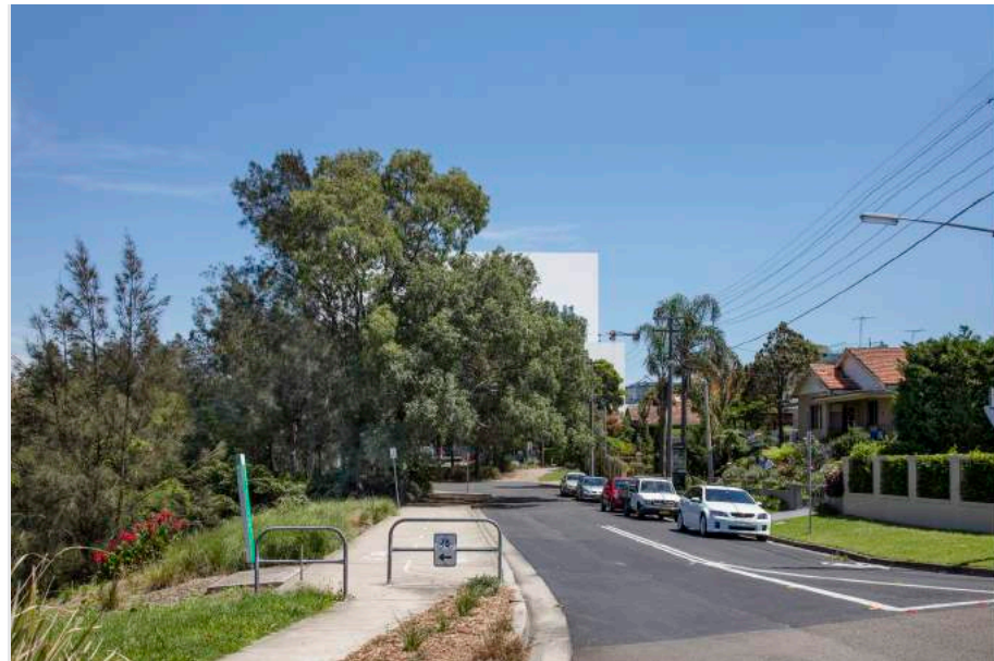
MOD 1 – Approved envelope