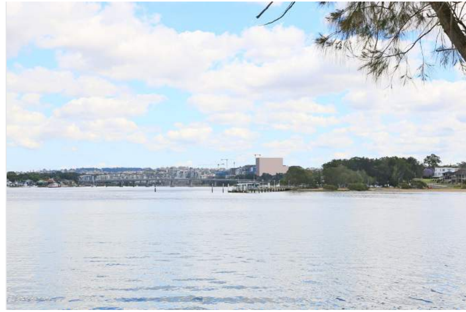
MOD 2 - Approved envelope