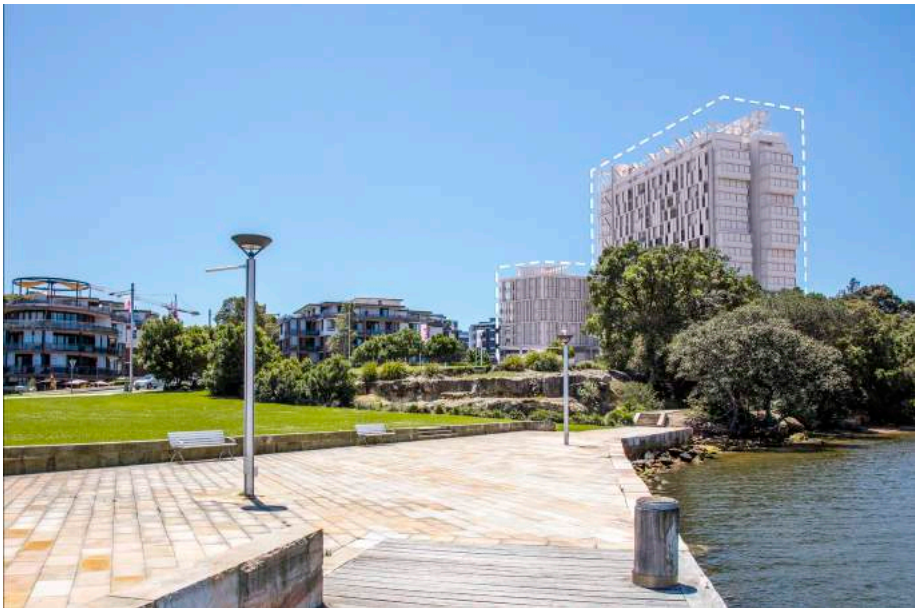
S75W Envelope & DA Massing