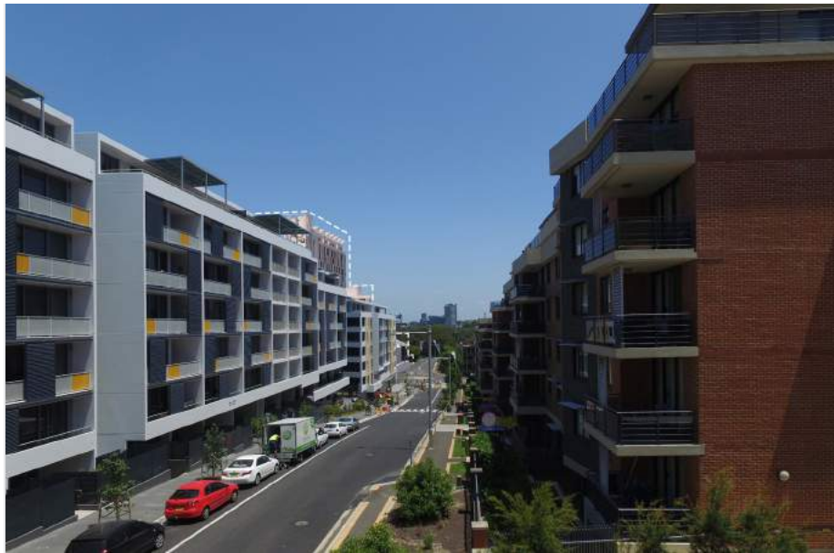
S75W Envelope & DA Massing