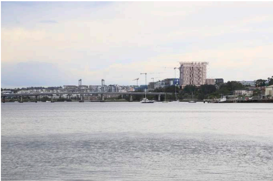
S75W Envelope & DA Massing