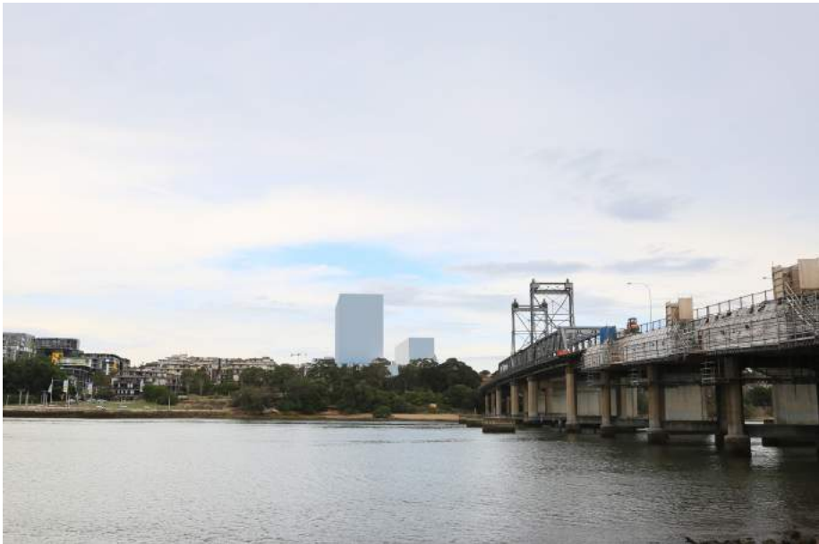
MOD 1 – Approved envelope