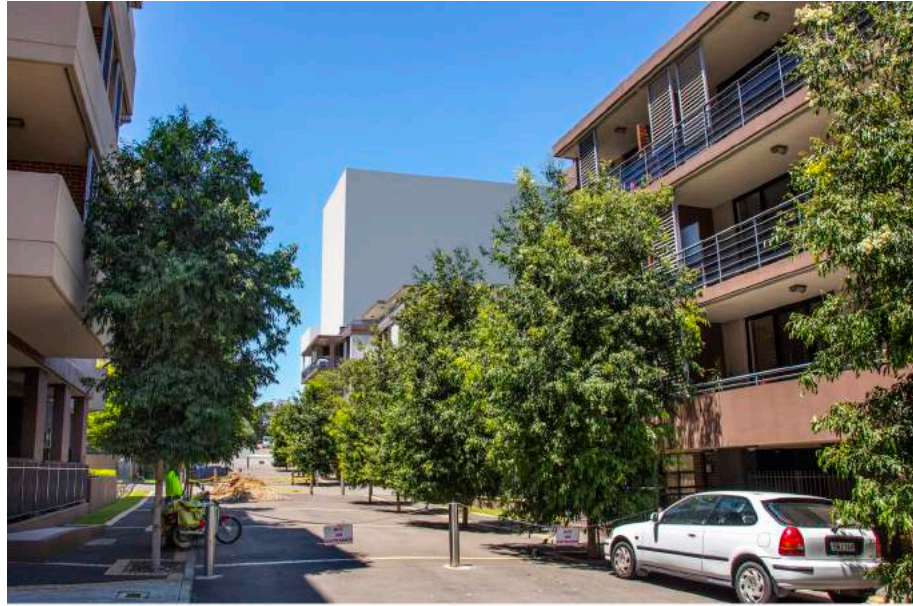
MOD 1 – Approved envelope