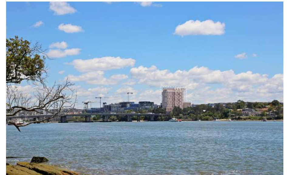
S75W Envelope & DA Massing