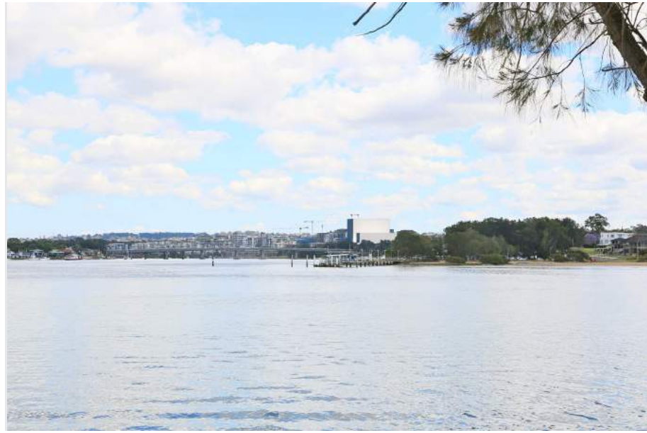
MOD 1 – Approved envelope