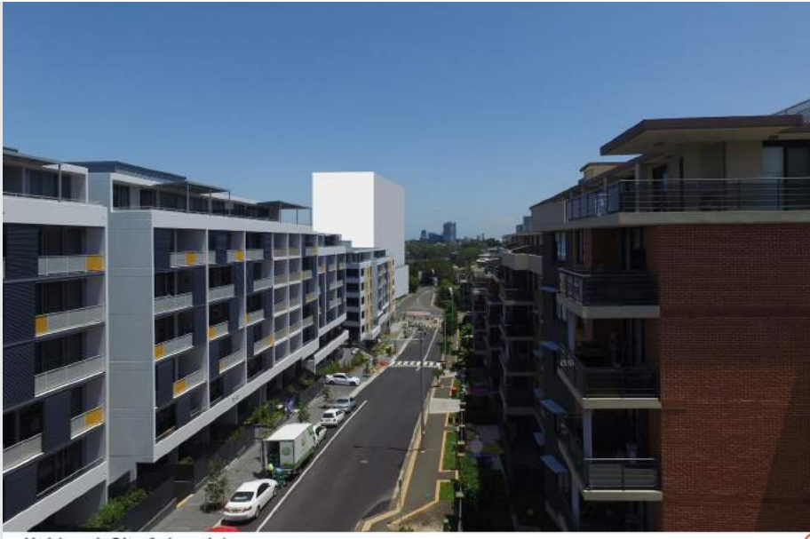
MOD 1 – Approved envelope