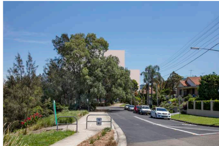
MOD 2 - Approved envelope