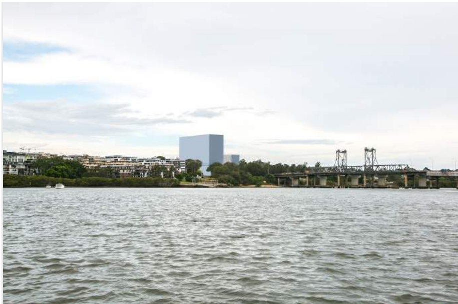
MOD 1 – Approved envelope