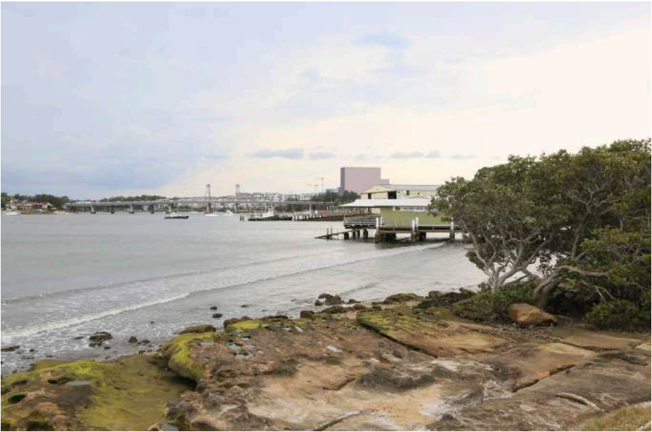
MOD 2 - Approved envelope