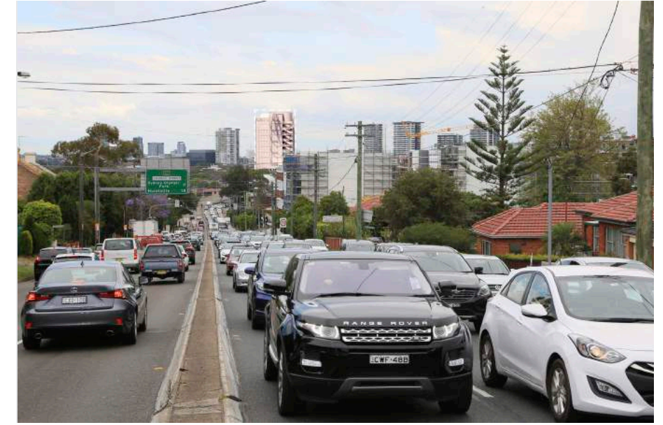
S75W Envelope & DA Massing