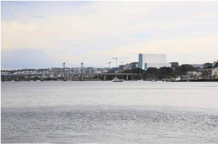
MOD 1 – Approved envelope