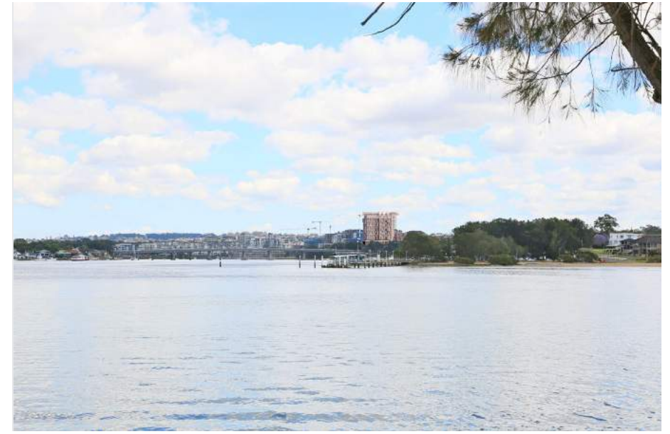
S75W Envelope & DA Massing