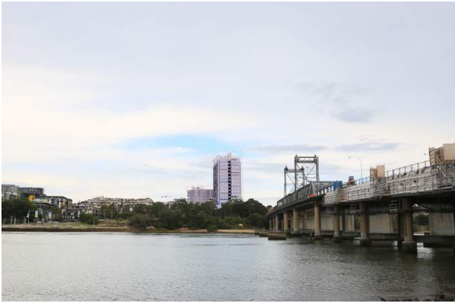
S75W Envelope & DA Massing