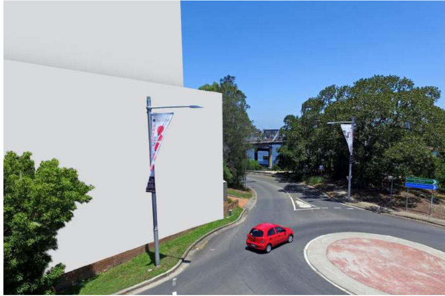
MOD 1 – Approved envelope