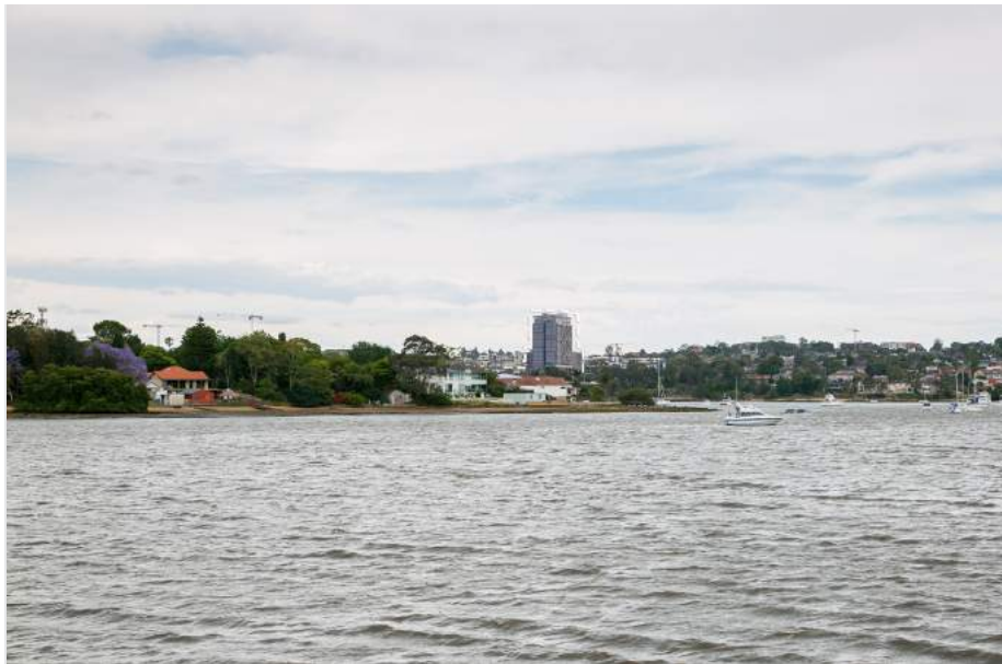
S75W Envelope & DA Massing