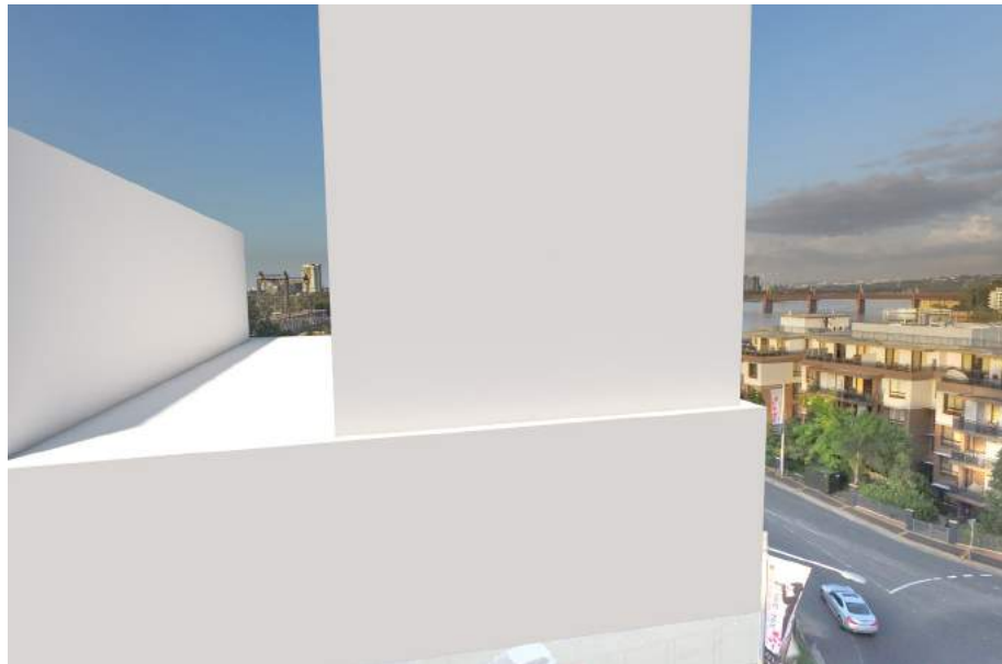
MOD 1 – Approved envelope