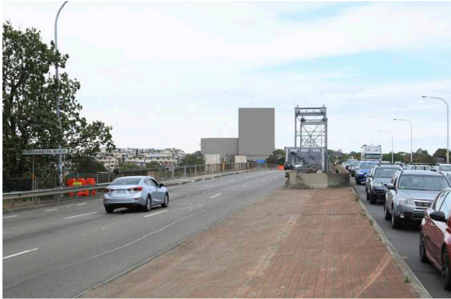
MOD 2 - Approved envelope