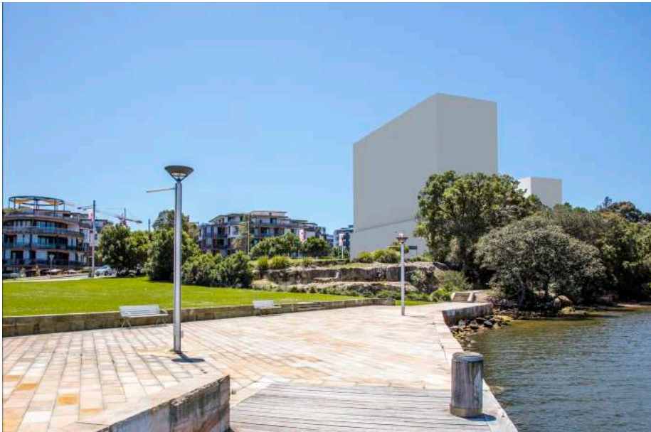
MOD 1 – Approved envelope