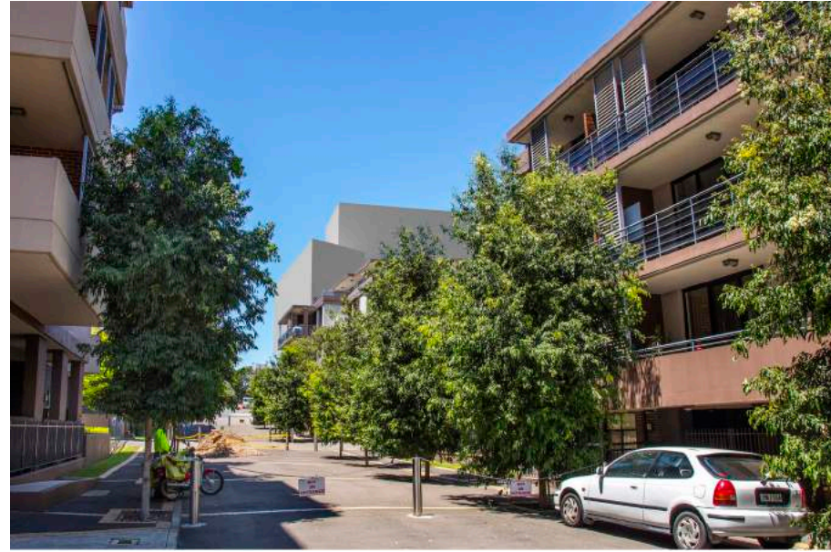
MOD 2 - Approved envelope