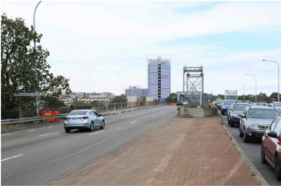
S75W Envelope & DA Massing