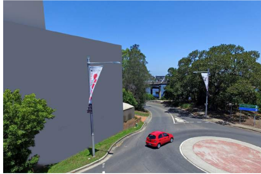
MOD 2 - Approved envelope