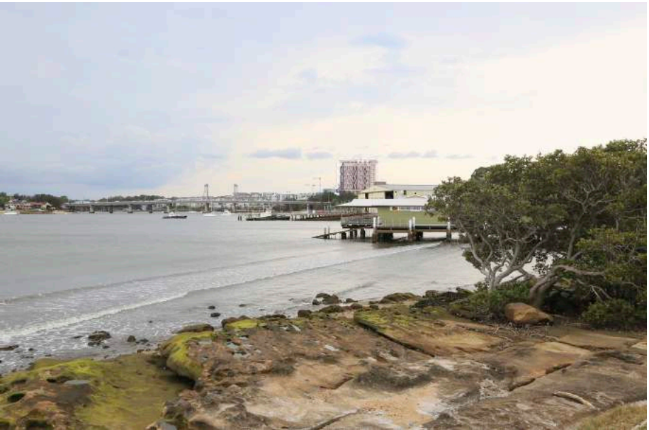
S75W Envelope & DA Massing