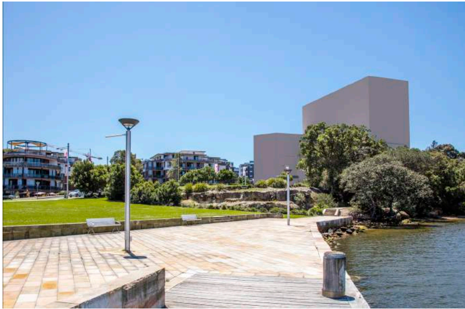
MOD 2 – Approved envelope