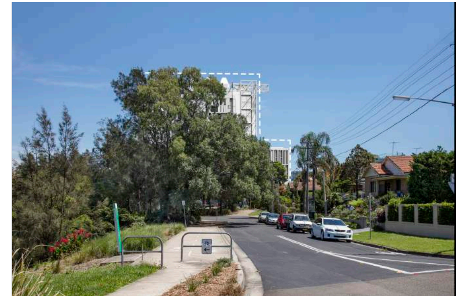
S75W Envelope & DA Massing