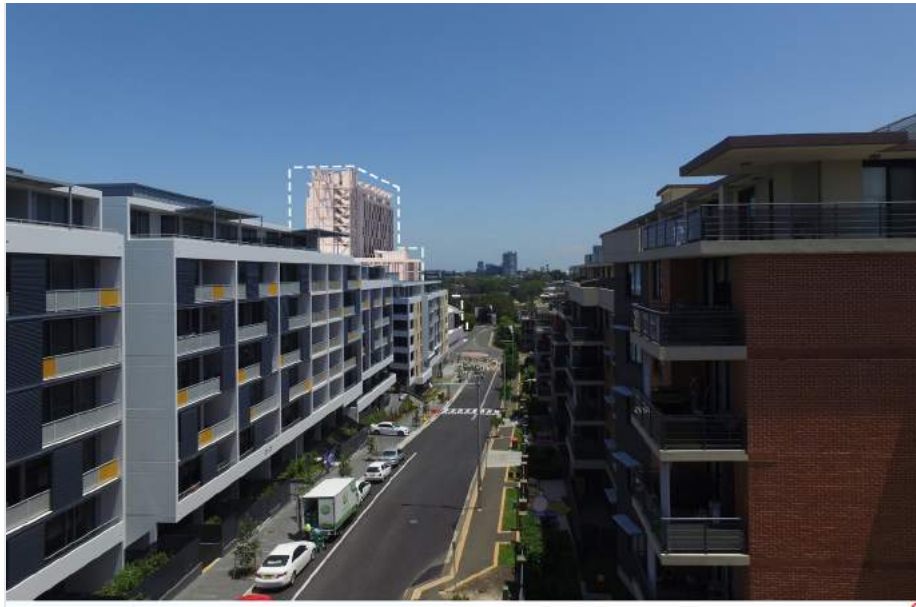
S75W Envelope & DA Massing