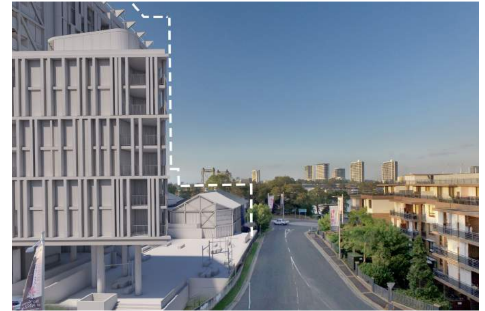
S75W Envelope & DA Massing