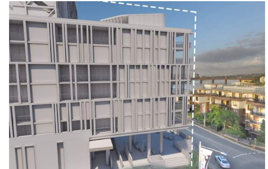
S75W Envelope & DA Massing