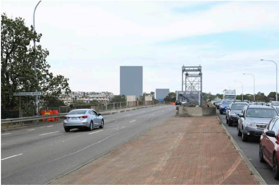
MOD 1 – Approved envelope