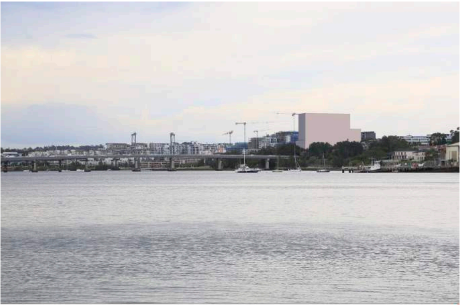
MOD 2 - Approved envelope