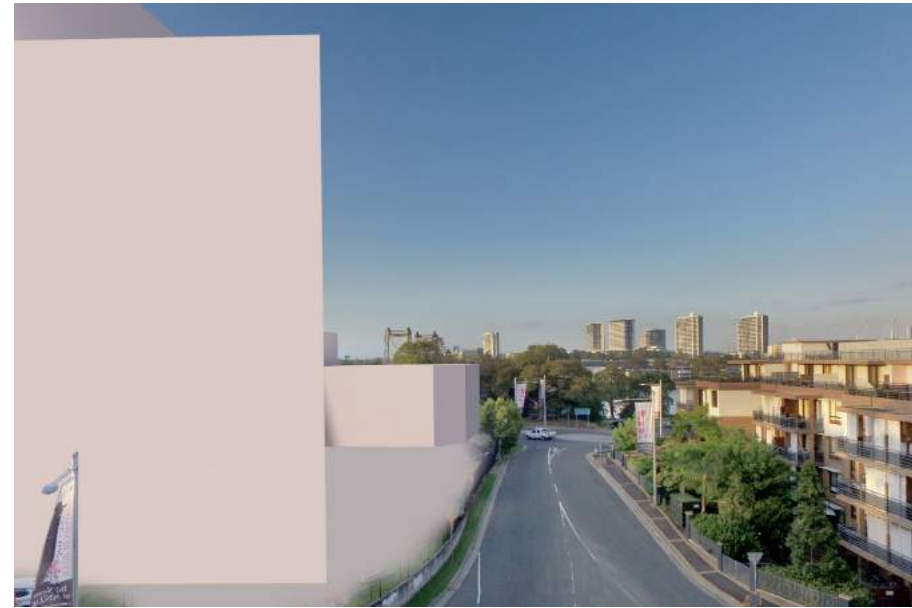
MOD 2 - Approved envelope