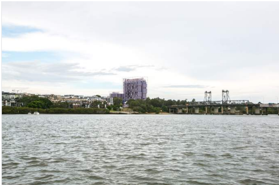
S75W Envelope & DA Massing