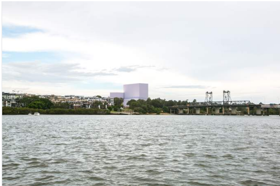
MOD 2 - Approved envelope