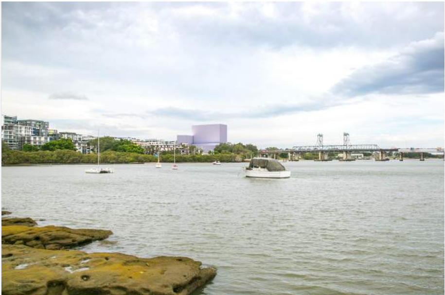
MOD 2 - Approved envelope