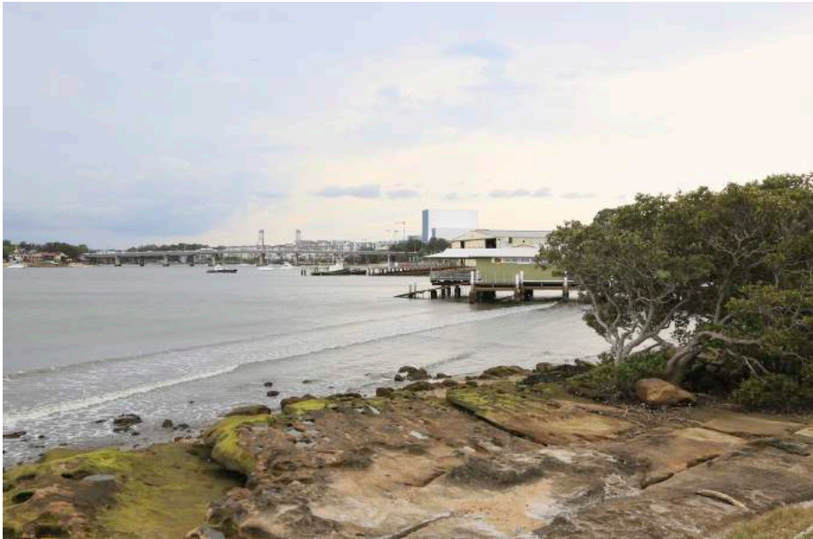
MOD 1 – Approved envelope