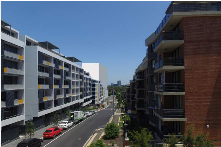
MOD 1 – Approved envelope