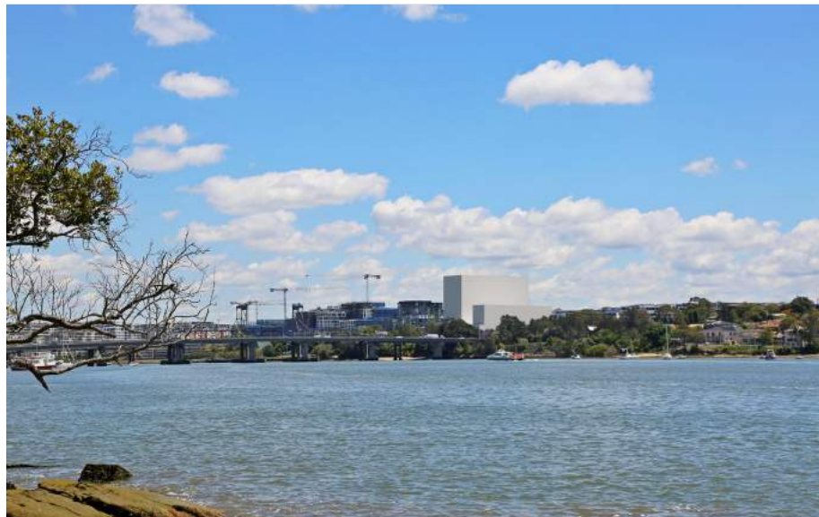
MOD 1 – Approved envelope