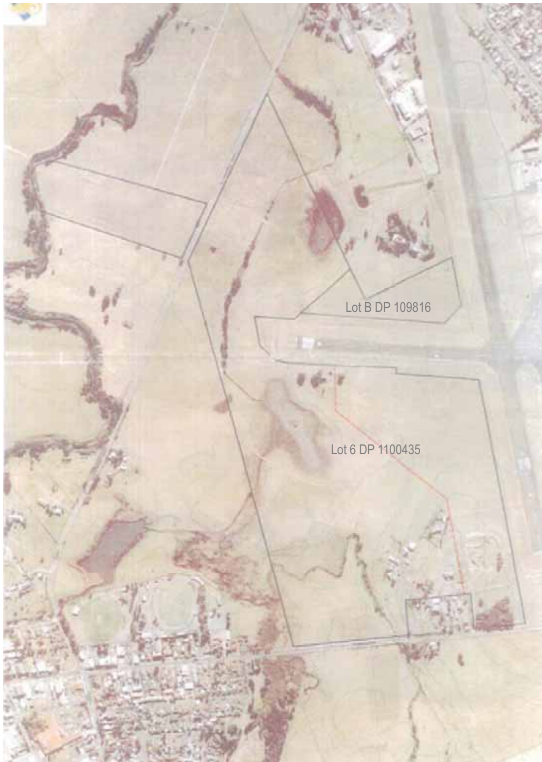
Figure 1.1 Site of Concept Plan