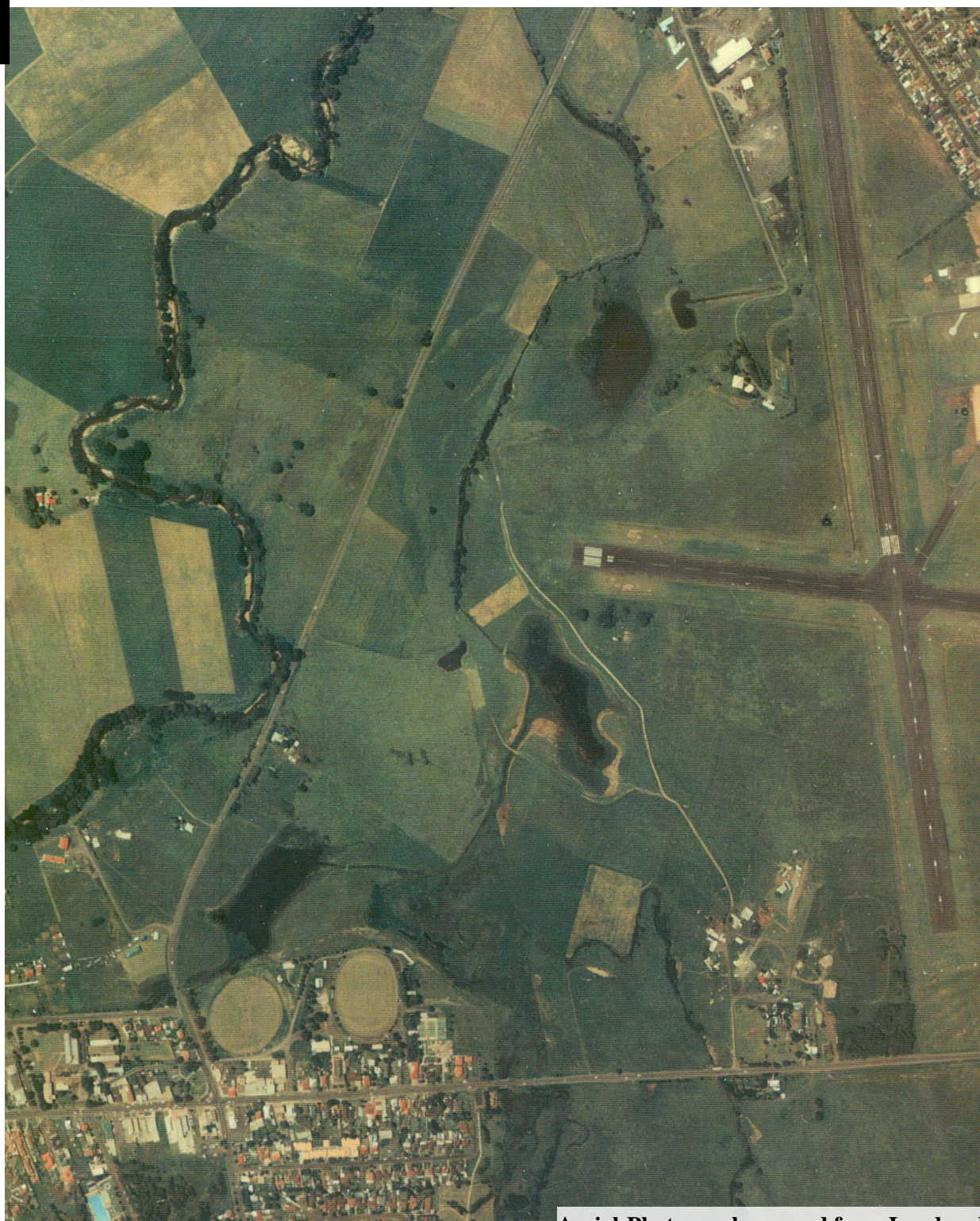
Aerial Photograph sourced from Land and Property Information NSW (LPINSW):