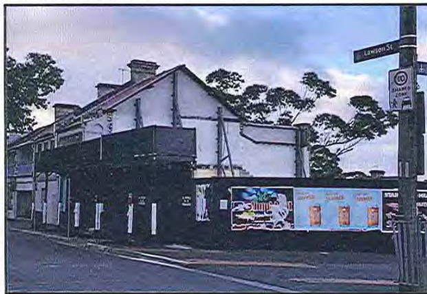
Photo: AHC Office demolition site

Sydney, 17th January 2018 - Following the DA approval in 2012, the Pemulwuy Project construction commenced in early September last year with the demolition of the Murawina building and the AHC office at 106 Lawson Street. Architectural and engineering plans have now commenced for Precinct 1, with the main focus being the inclusion of the gallery. It is anticipated that the construction of Precinct 1 will commence within the first half of 2018.