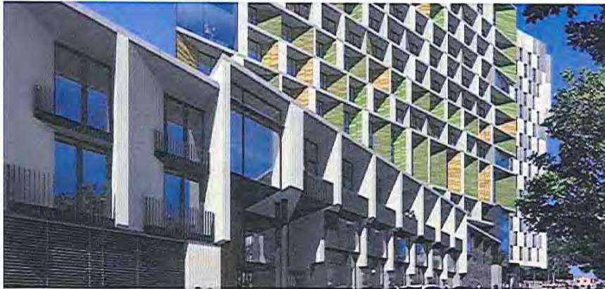
Pemulwuy student housing – Eveleigh Street towards the railway station (artist's impression)

REDFERN: The Aboriginal Housing Company (AHC) has submitted a new Development Application (DA) for the Col James Student Accommodation, Precinct 3 of the Pemulwuy Project, to the Department of Planning and Environment (DPE). No changes are sought for Precinct 1 (62 affordable homes for Aboriginal families and the gymnasium on The Block), nor Precinct 2 (the AHC office, shops, commercial space and child care centre). The change will go on exhibition through the DPE Major Projects website in coming weeks to allow for comment.