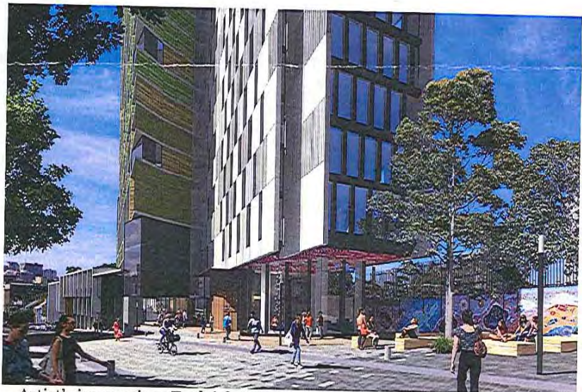
Artist's impression: Eveleigh Street view

The proposal comprises 522 rooms accommodating 596 student beds. It also includes associated public domain works. The Pemulwuy Project was on public exhibition with the NSW Department of Planning and Environment for 6 weeks, and came off exhibition on 27 October 2017.