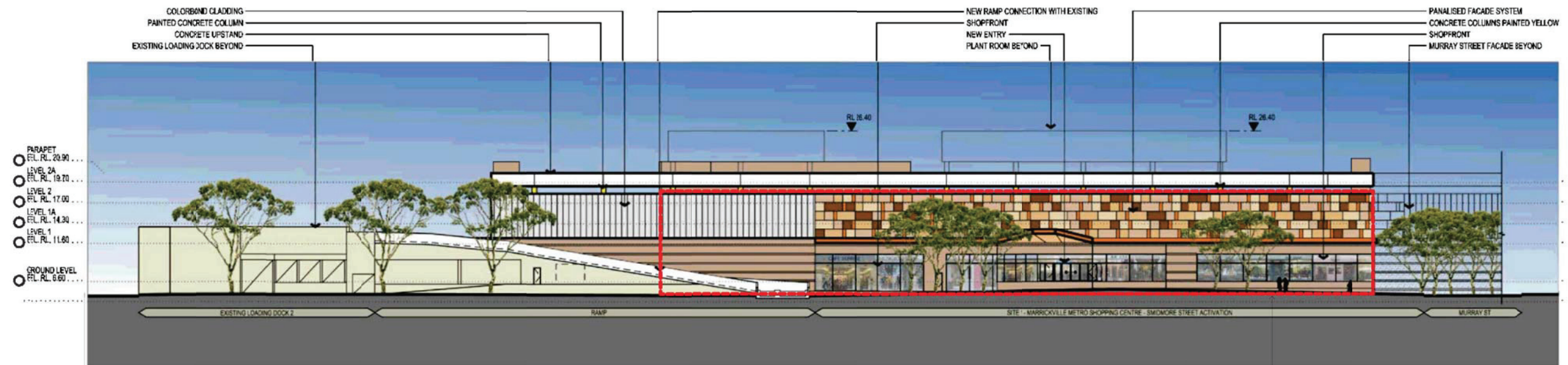
SOUTH ELEVATION - SMIDMORE STREET 1:250