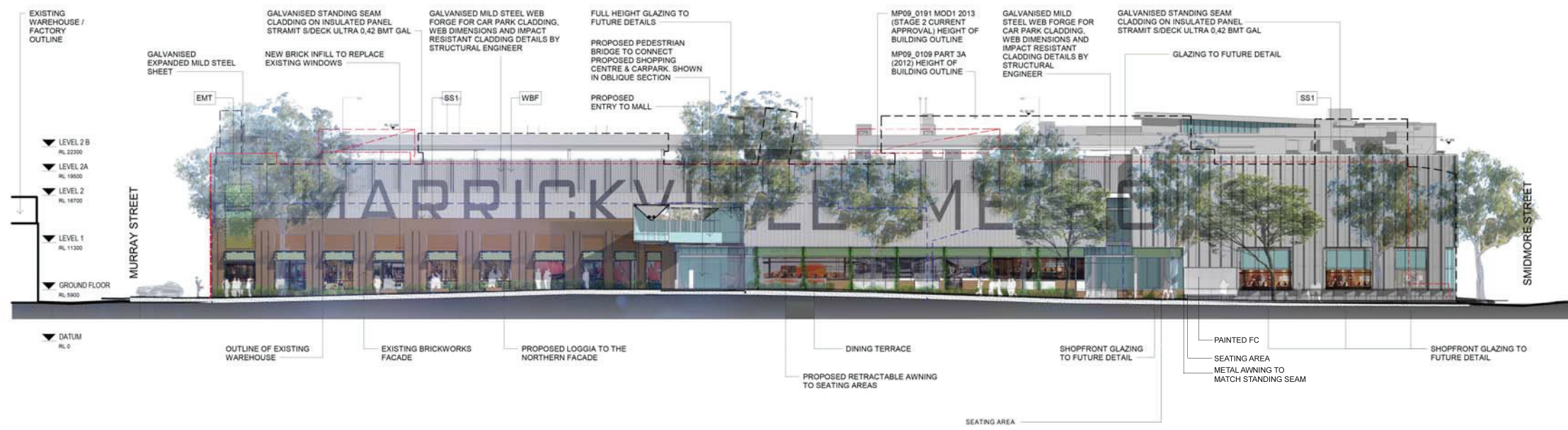
PROPOSED NORTH ELEVATION SMIDMORE STREET 1:250