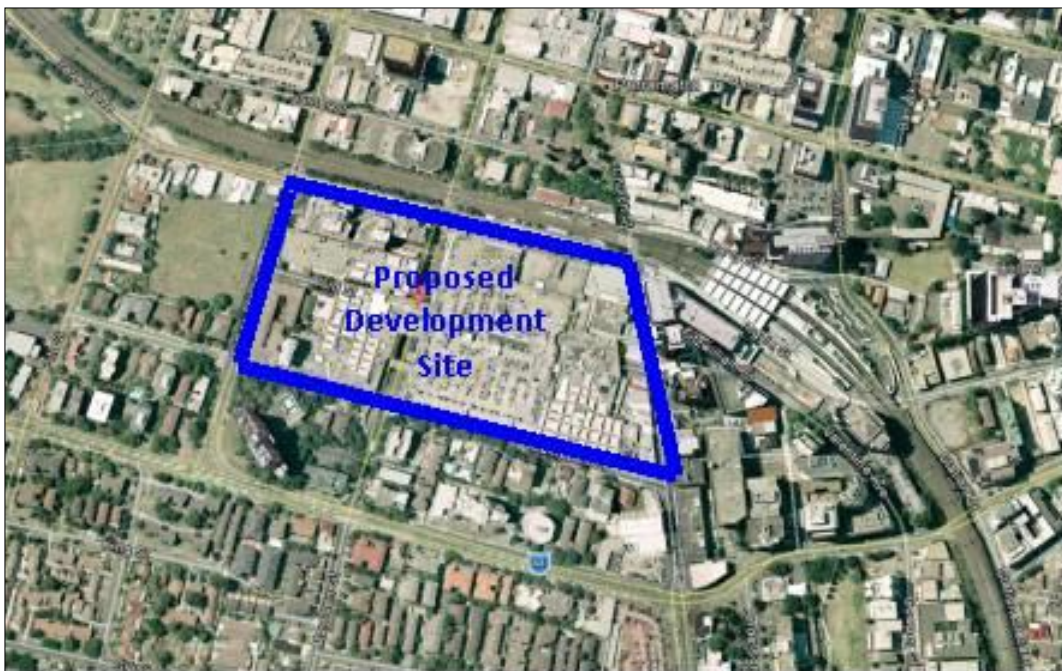
Figure 2-1: Site Location

The proposed development site is located centrally in Parramatta, Sydney. The surrounding areas consist of residential and commercial land uses.