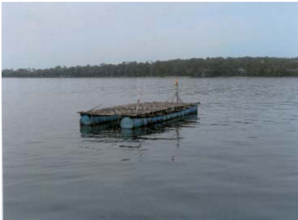
Existing (small) mussel raft off Collingwood Beach

These issues are to be addressed in greater detail in the Environmental Assessment Report. The proponents will also be preparing a draft Statement of Commitments to describe how these issues will be managed throughout the implementation of the project.