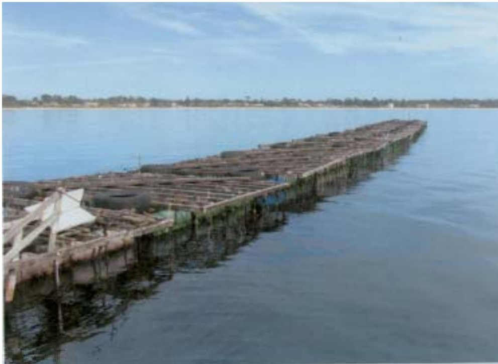
Existing (large) mussel raft off Collingwood Beach