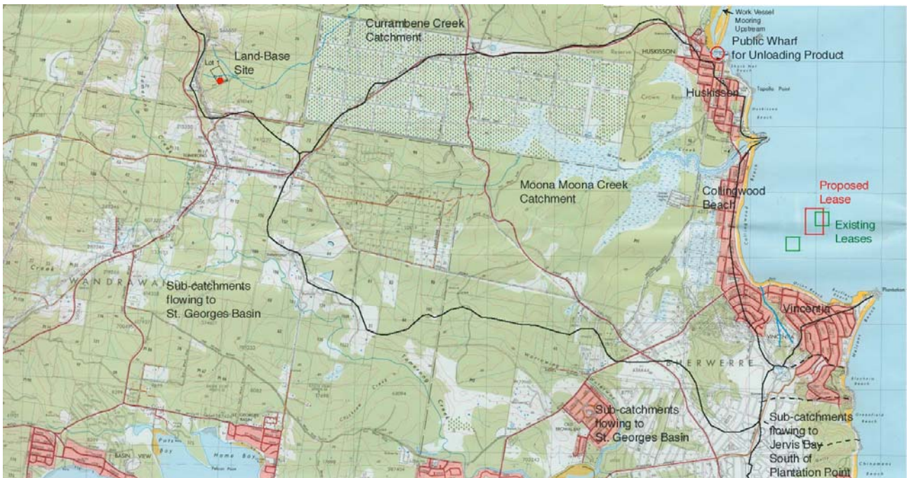
Fig 1 Relationship of Present Leases to Proposed Lease and Location of Land Based Site plus Work Vessel Mooring Site

A major restriction on aquaculture site selection is wave action, which can damage infrastructure and disrupt growing cycles of shellfish. Thus, suitable growing areas are restricted to semi-sheltered waters of the Bay. Trial mussel aquaculture has been undertaken at a number of locations around Jervis Bay since 1974. These sites have, of necessity, been located on the southern side of the Bay, as the northern peninsula is used by the Department of Defense as a live firing range which restricts access to that area and to a buffer area along the southern shore of the Bay. Declaration of the Marine Park introduced zoning, which further excludes aquaculture from certain potentially suitable areas of the Bay. The existing commercial aquaculture facility has been located in Collingwood Bay for thirty years and has proved to be safe and reliable. The zoning in the area of the Bay containing the lease (habitat protection zone) allows aquaculture. Accordingly the proposal is for the location to remain at the existing site.