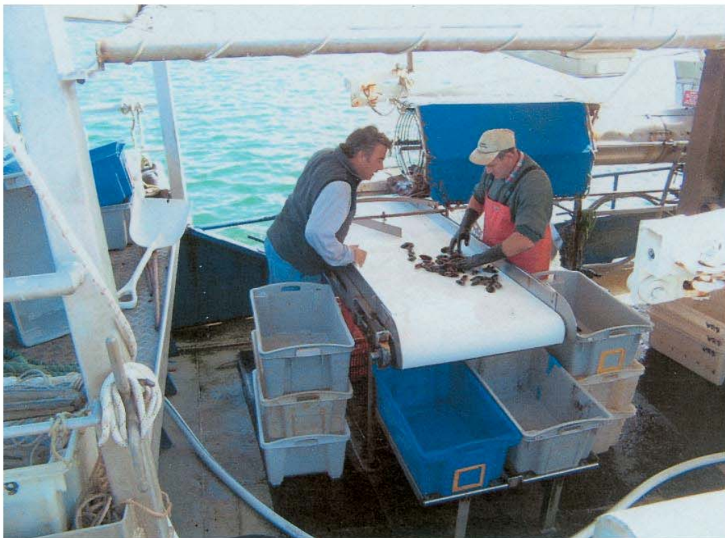
Figure 3 Typical Aquaculture Work Vessel as used in the Victorian Mussel Fishery