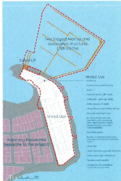
Figure 2: Approved Concept Plan Layout