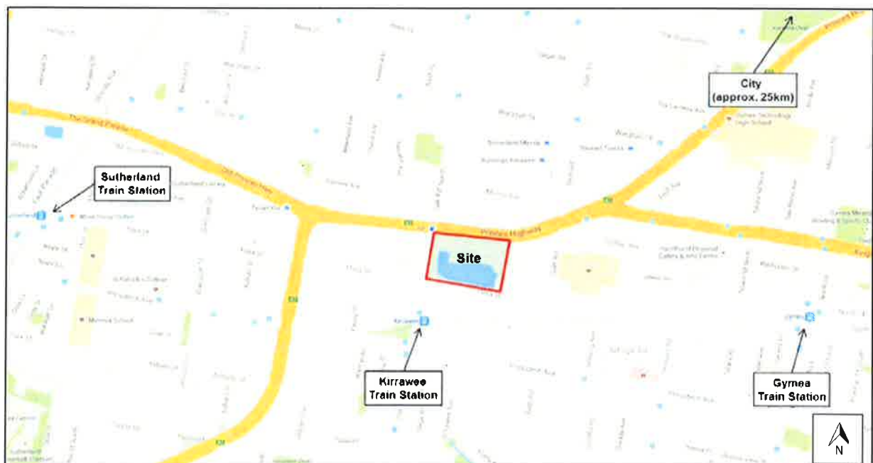
Figure 1: Site location.

The site is located approximately 250 metres to the north of Kirrawee Village Centre and train station and was formally used as a brick pit.