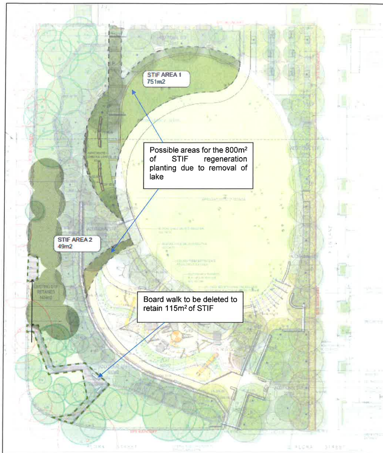
Figure 4: Updated Landscape Plan showing additional 800m 2 of STIF and removal of board walk