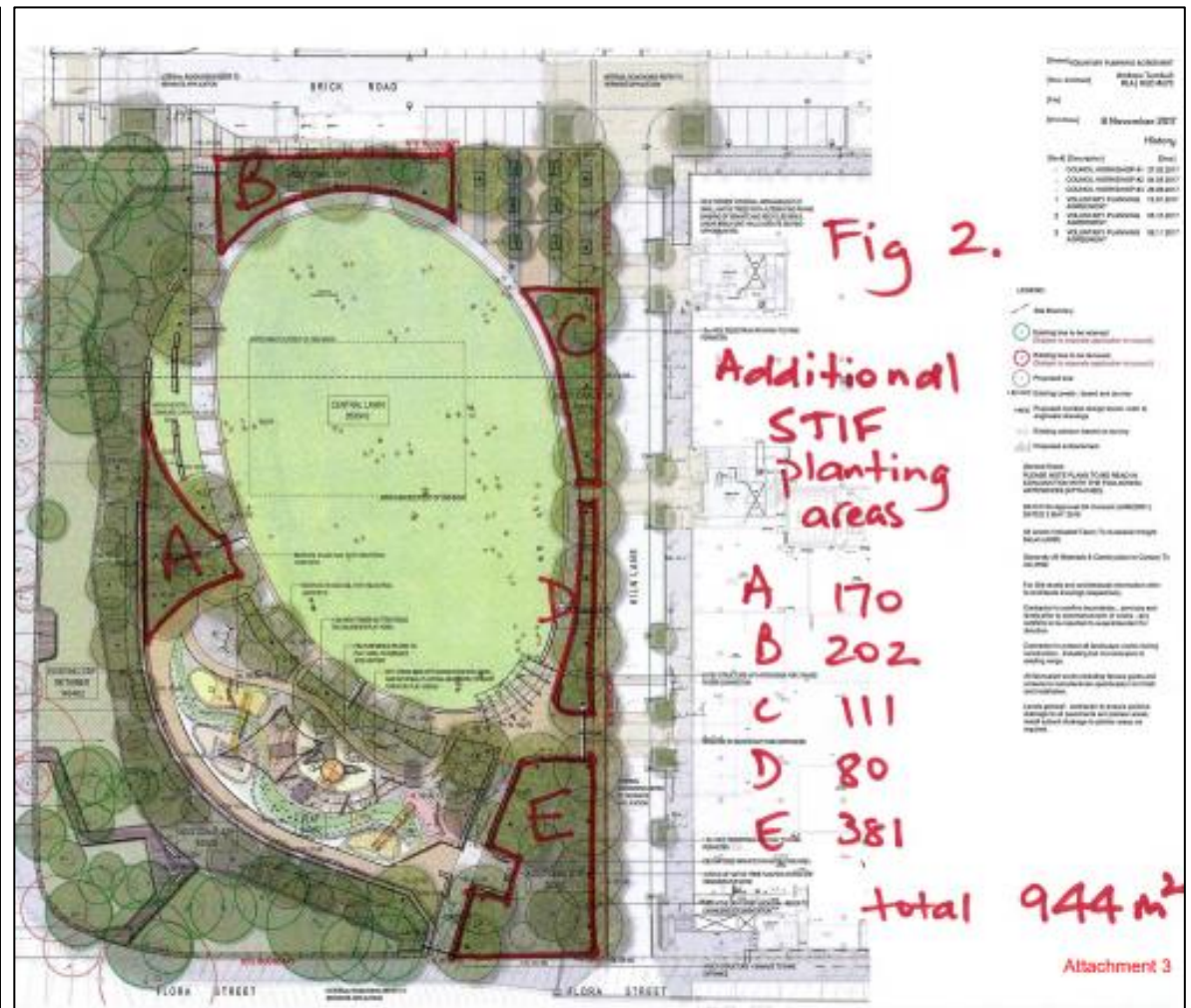
Figure 3: Proposed Areas of STIF Regeneration.