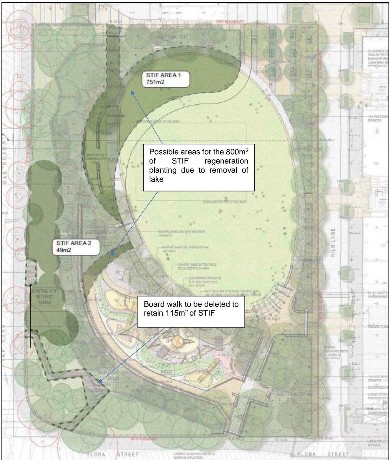
Figure 4: Updated Landscape Plan showing additional 800m 2 of STIF and removal of board walk