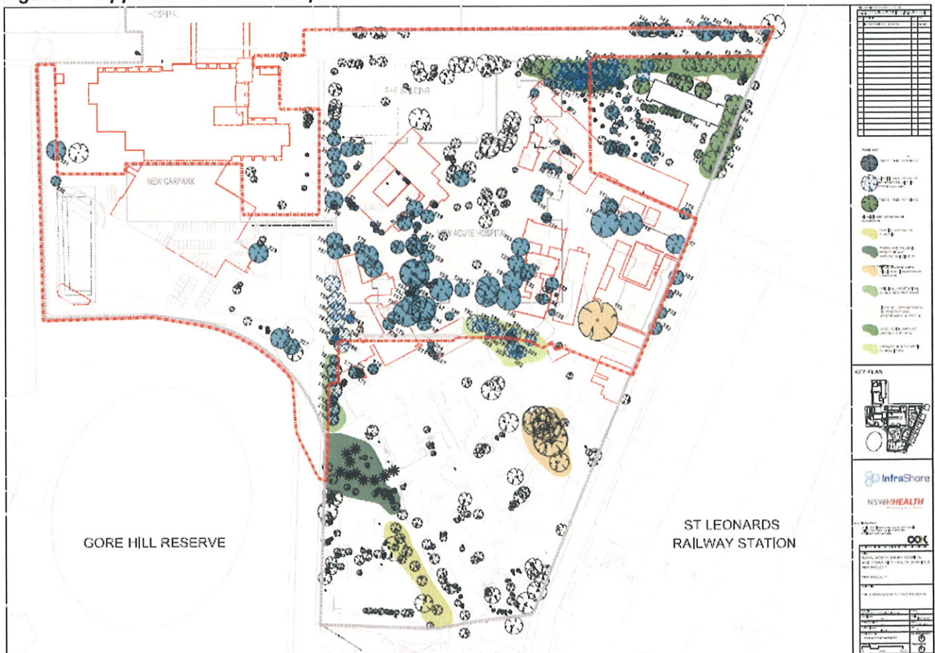
Figure 2 – Proposed Hospital Layout and Tree Removal Plan