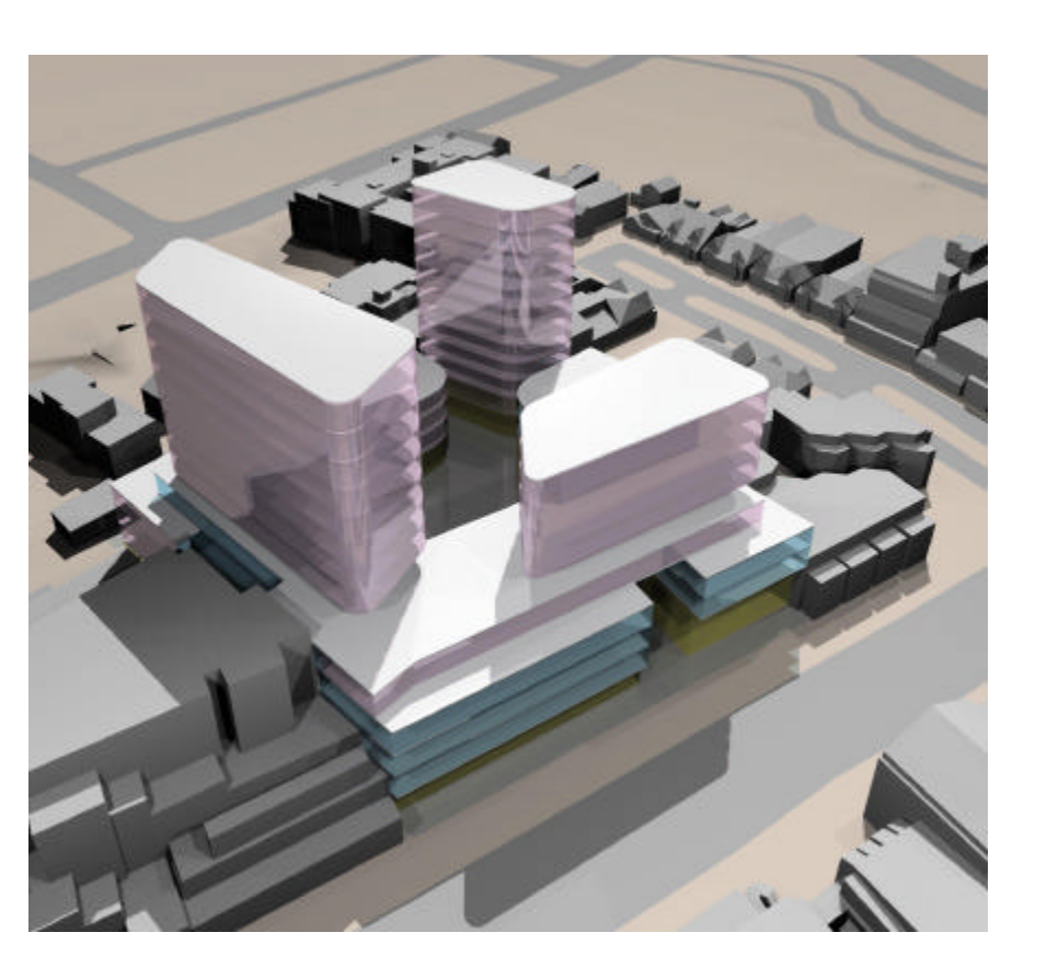
View From South West