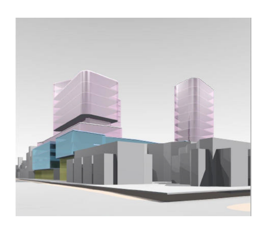
View From Cross Street