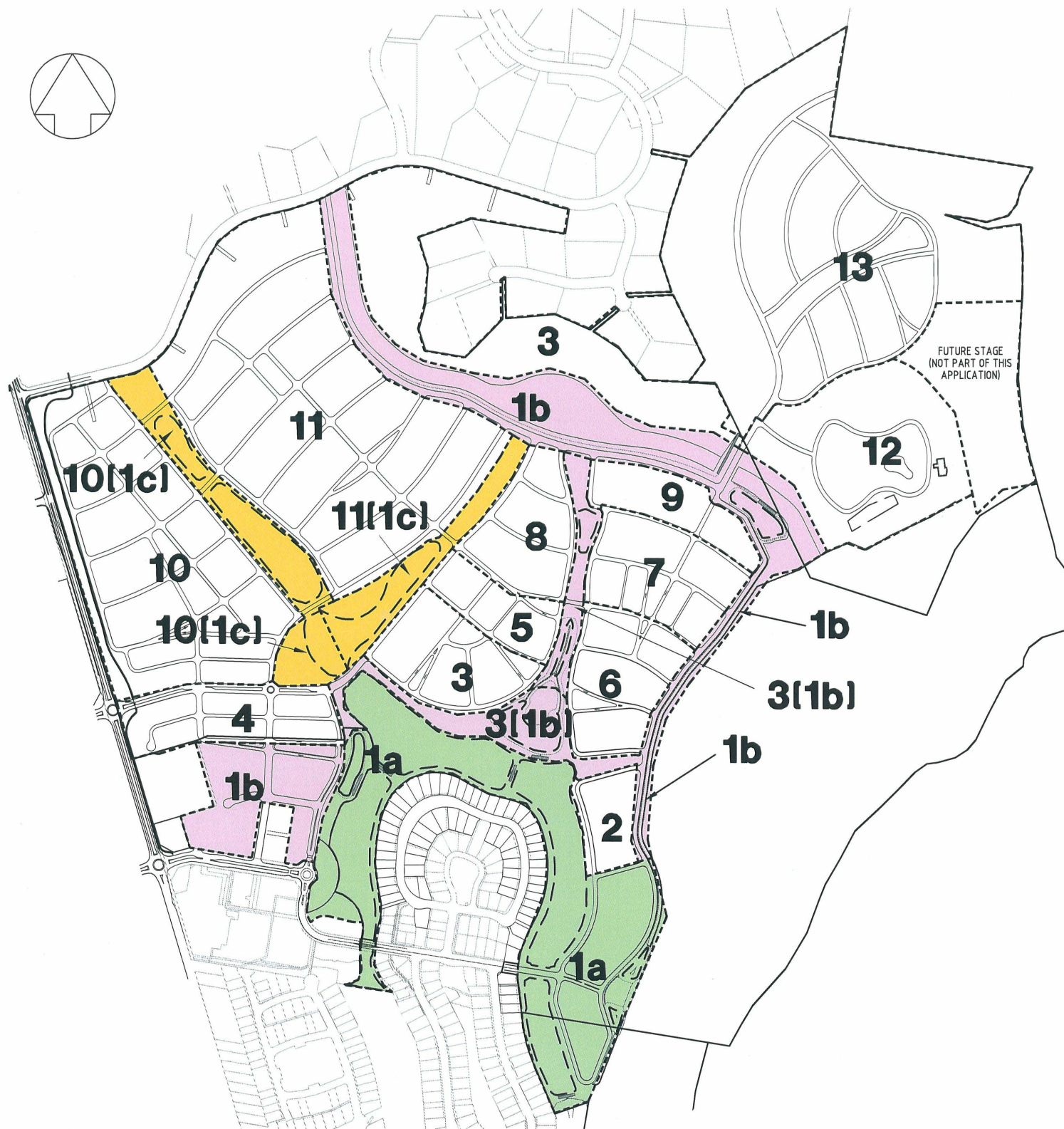
CONSTRUCTION ACTIVITY STAGING PLAN INDICATING STAGE 1 ACTIVITIES