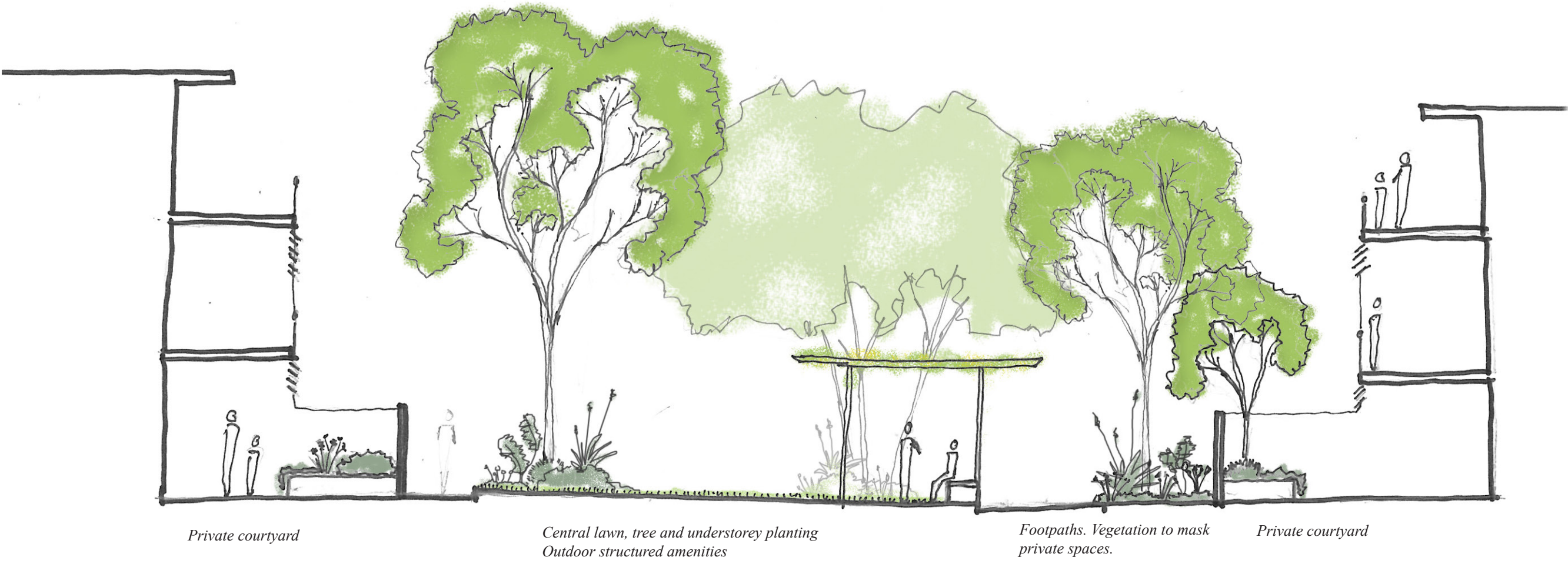
Section B - Village Square nts