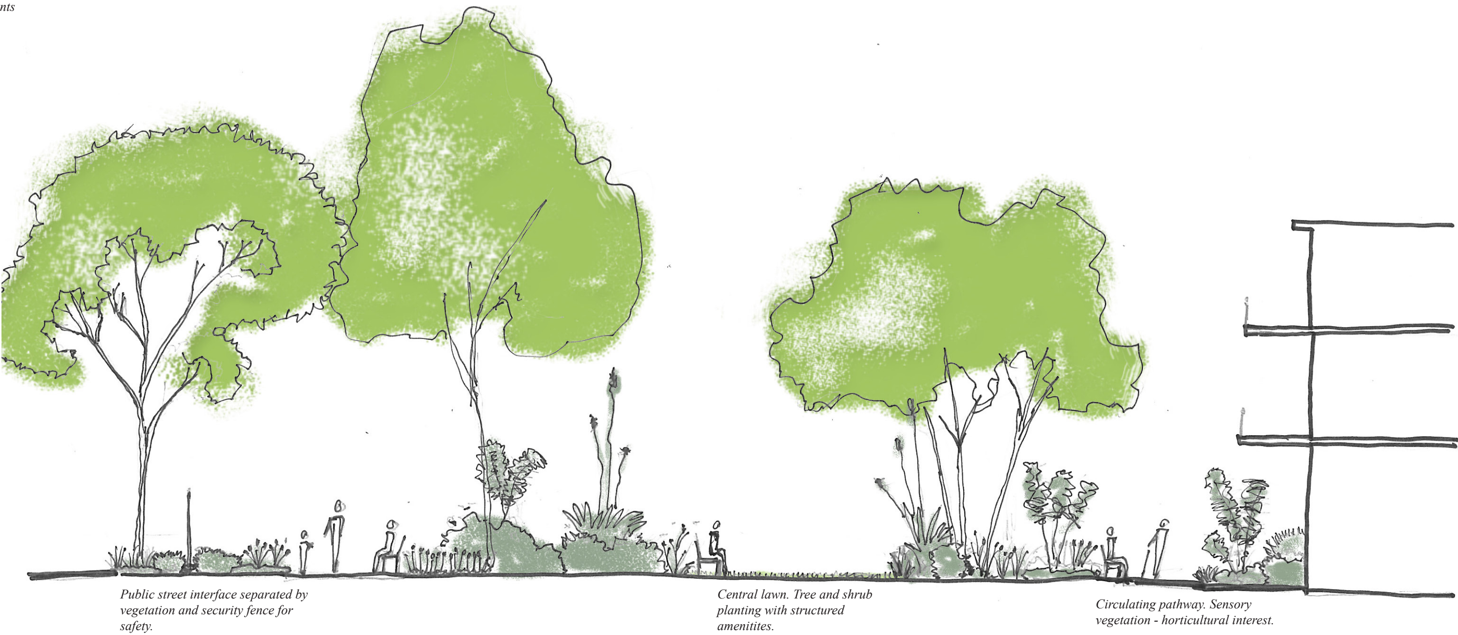
Section C - Dementia Garden nts