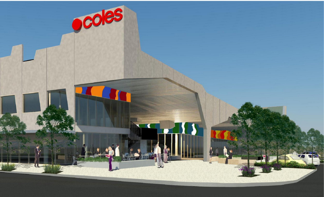
PERSPECTIVE VIEW 6 FROM CNR CASUARINA WAY AND THE MAIN STREET LOOKING WEST