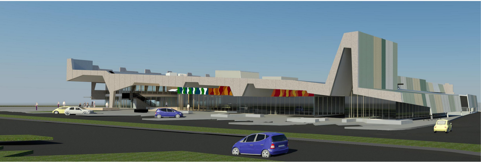
PERSPECTIVE VIEW 5 FROM THE MAIN STREET LOOKING SOUTH EAST TO SITE