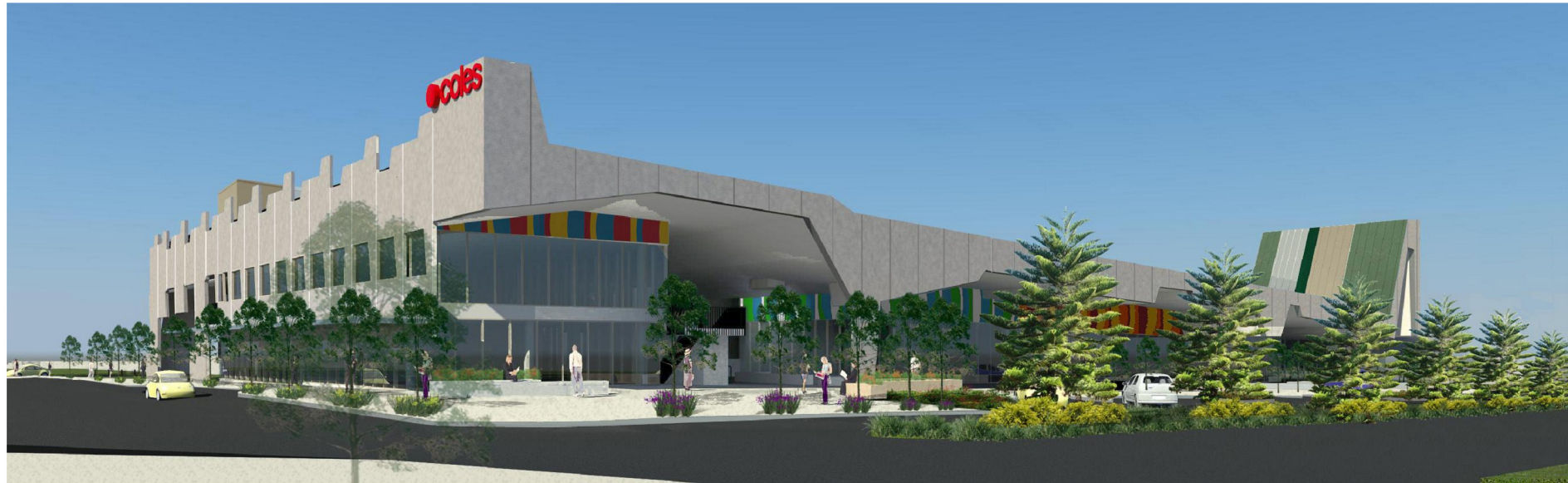
PERSPECTIVE VIEW 2 FROM THE MAIN STREET + CASUARINA WAY INTERSECTION LOOKING TO SOUTHWEST CORNER OF SITE