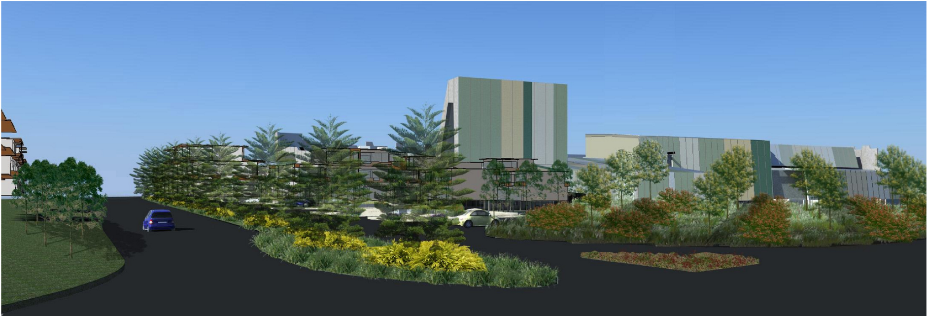
PERSPECTIVE VIEW 1 FROM TWEED COAST ROAD LOOKING SOUTH EAST TO SITE