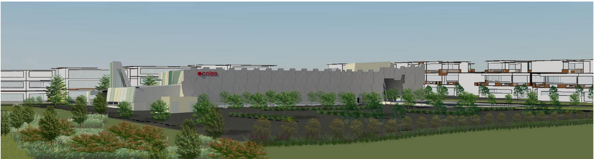
PERSPECTIVE VIEW 4 FROM TWEED COAST ROAD LOOKING NORTH EAST TO SITE