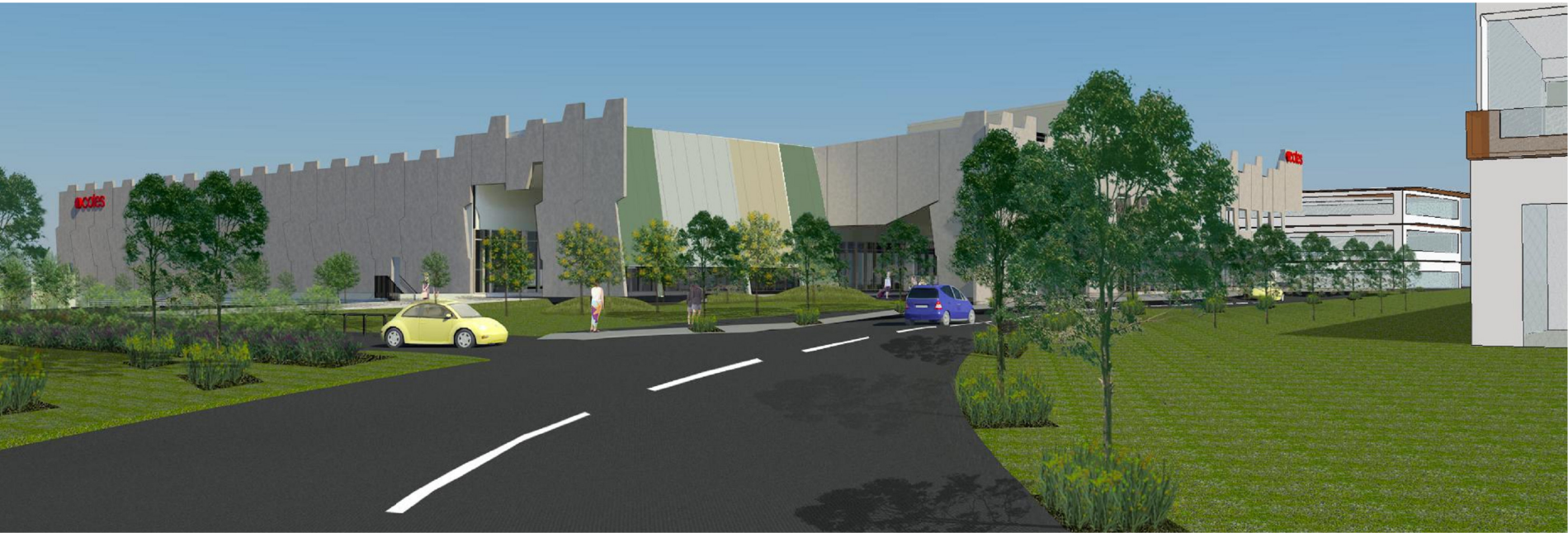
PERSPECTIVE VIEW 3 FROM CASUARINA WAY LOOKING NORTH WEST TO SITE