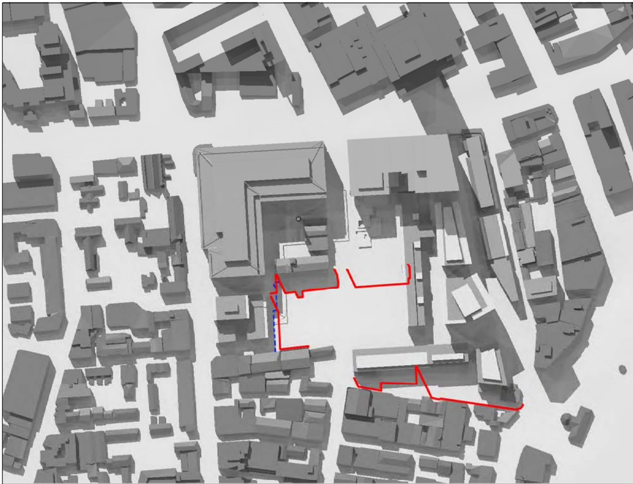
02 21 March 1pm