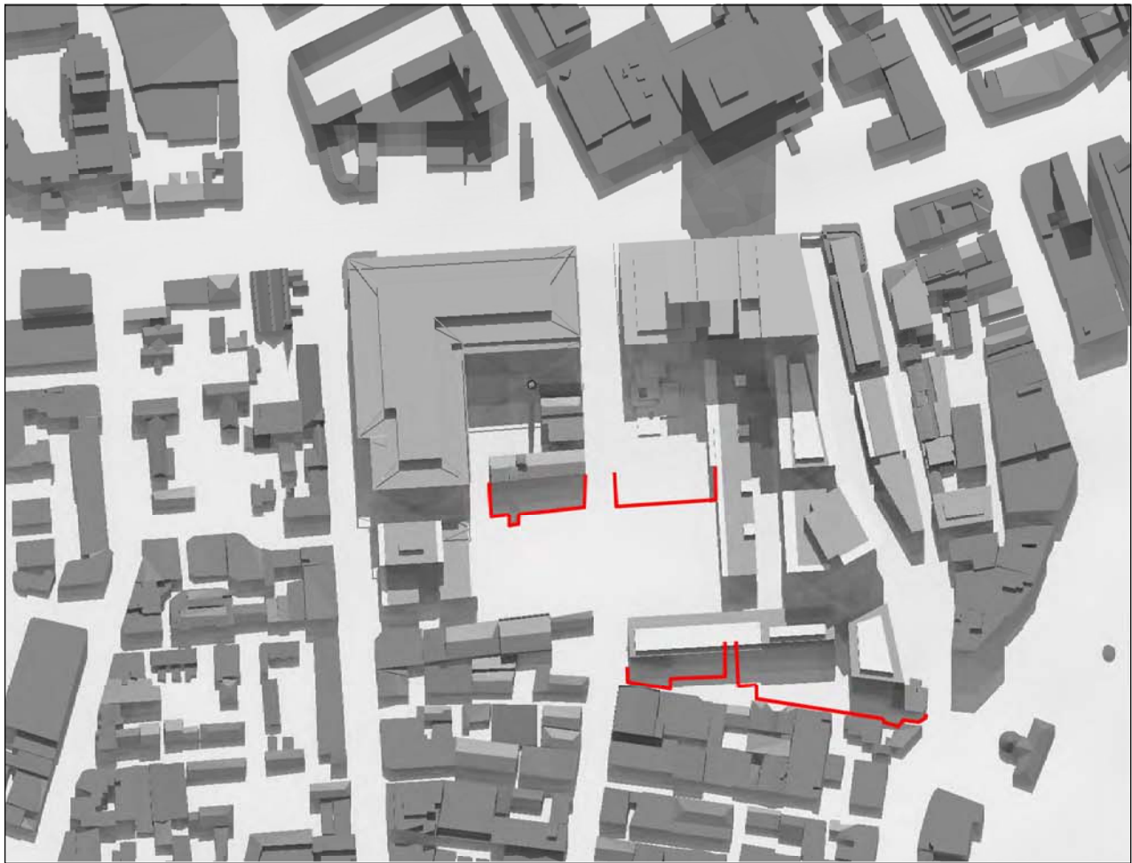
01 21 March 12pm