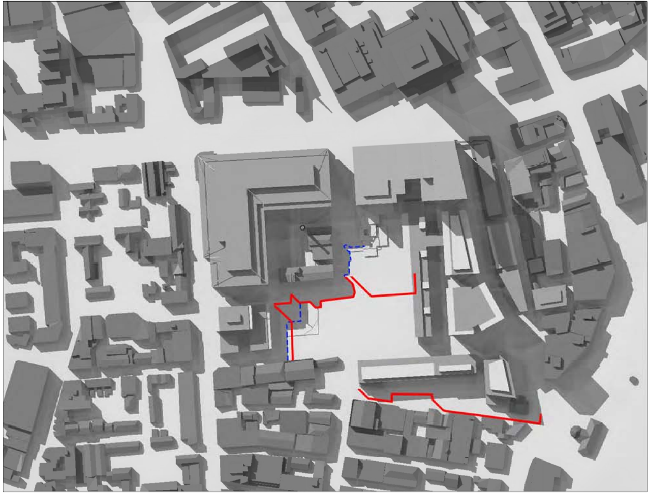
03 21 March 3pm