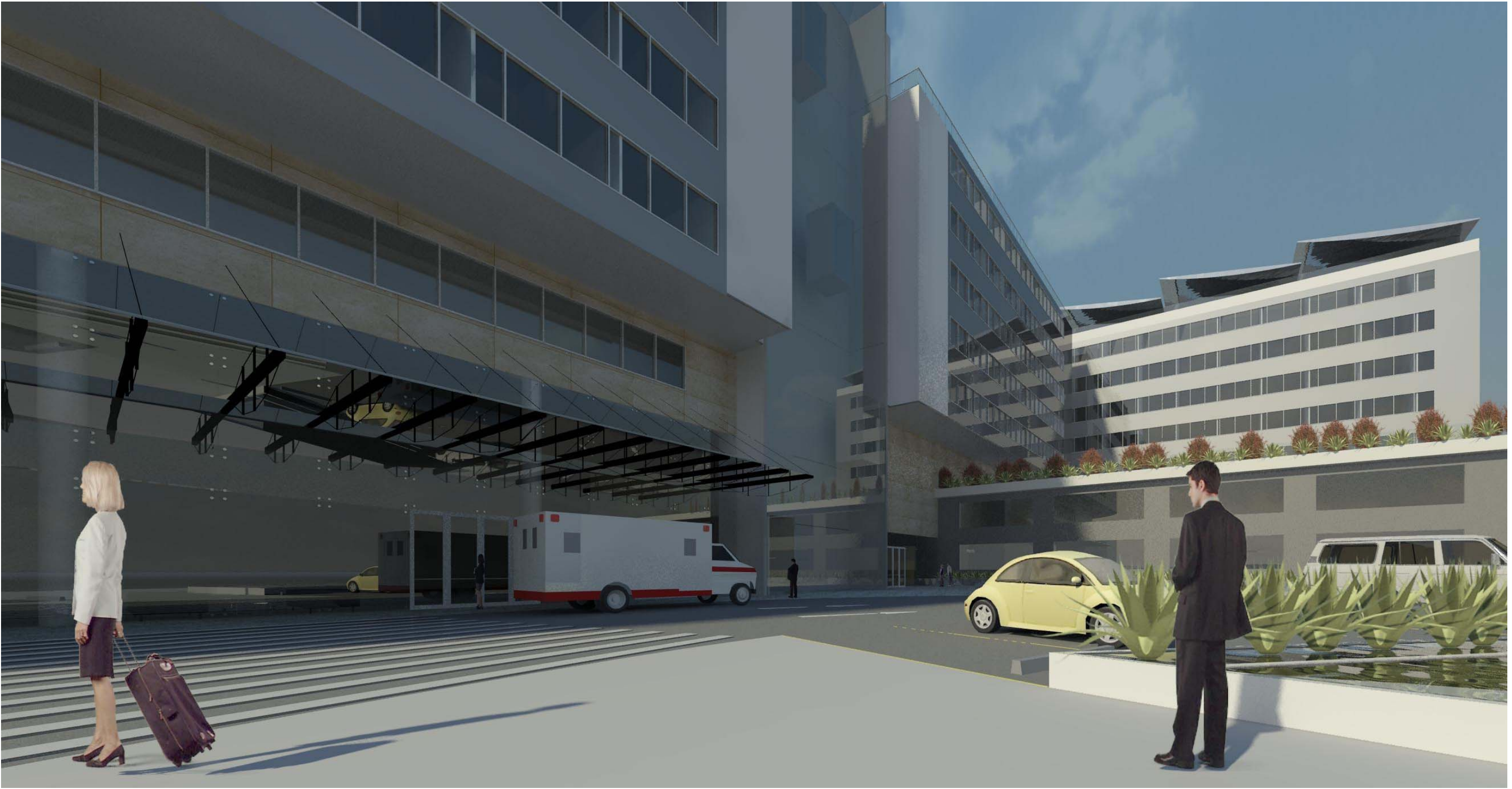
1 Perspective of Hospital Entrance