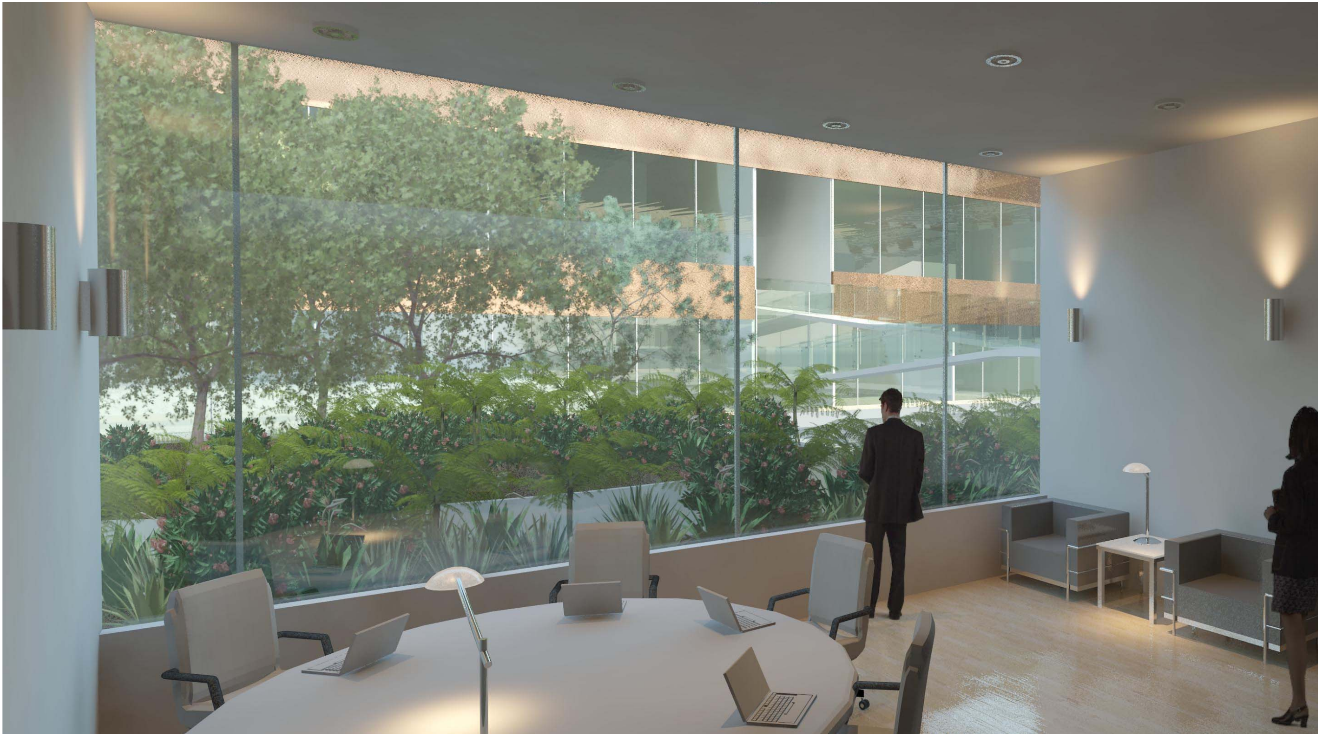
2 Surgicentre Interior Perspective out to Courtyard