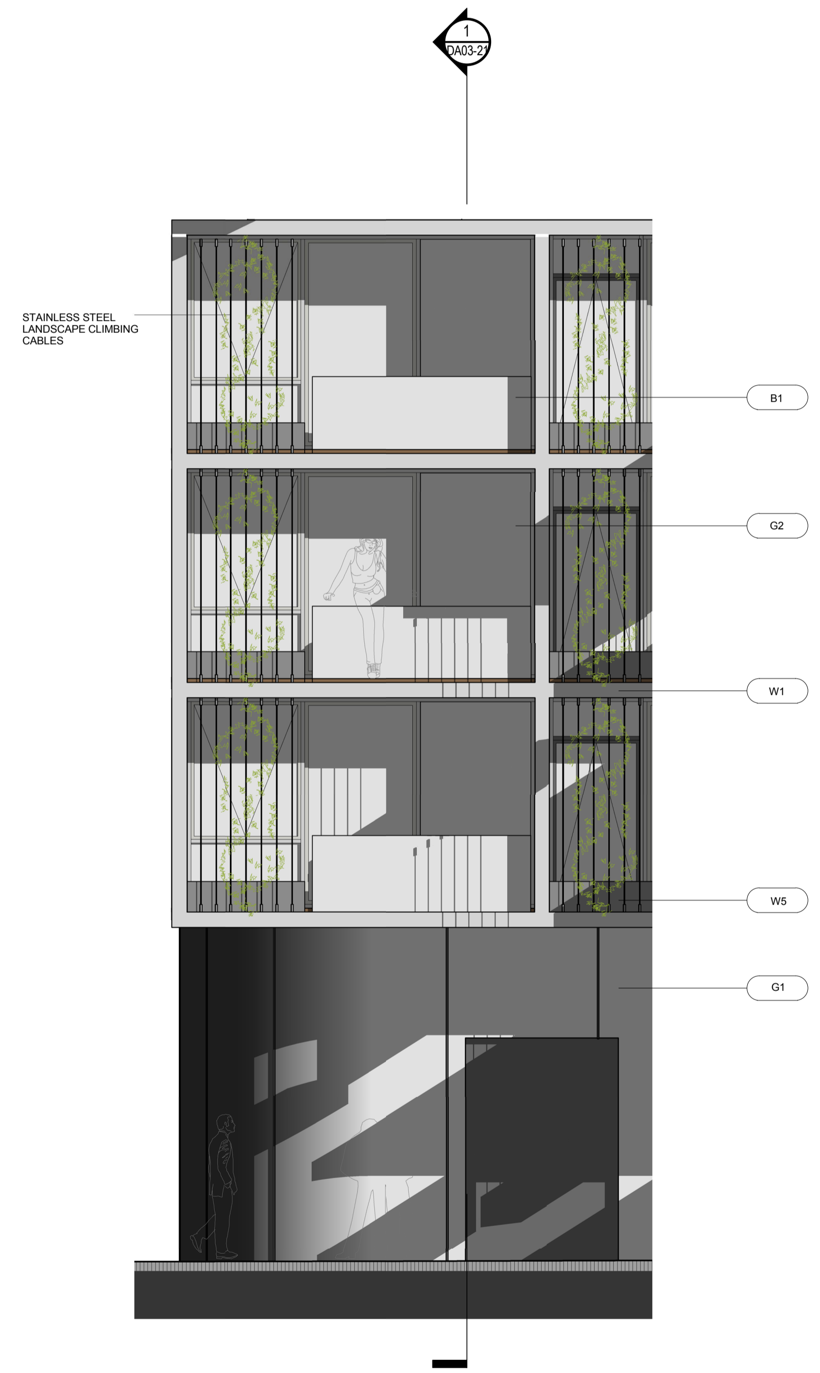
2 ELEVATION DETAIL 1-1 Scale: 1 : 50