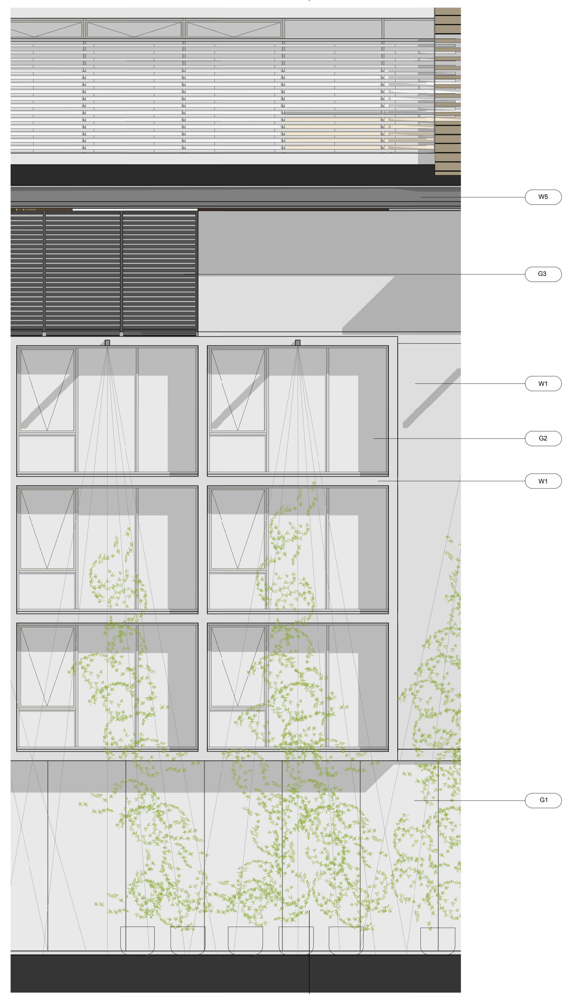
2 ELEVATION DETAIL 3-3